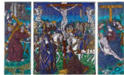
Title: Triptych: The Way to Calvary; The Crucifixion; Pietà Date: ca. 1525–35 Primary Maker: Jean Pénicaud I Medium: Painted enamel on copper, partly gilded Dimensions: 10 x 12 7/16 in. (25.4 x 31.6 cm) Central plaque: 10 3/16 x 8 3/4 in. (25.9 x 22.2 cm) Wings: 10 1/4 x 3 3/4 in. (26 x 9.5 cm)