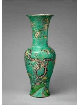
Title: Tall Vase with Green Ground Date: probably 19th century Primary Maker: Chinese, Qing Dynasty (1644–1911) Medium: Famille verte porcelain Dimensions: 27 x 10 in. (68.6 x 25.4 cm)