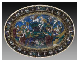
Title: Oval Dish: Apollo and the Muses; Fame Date: late 16th century Primary Maker: Martial Reymond Medium: Painted enamel on copper, partly gilded Dimensions: 21 7/16 × 16 × 2 in. (54.5 × 40.6 × 5.1 cm)