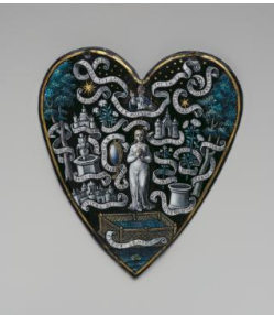
Title: Plaque: The Litanies of the Blessed Virgin Date: mid 16th century Primary Maker: Pierre Reymond Medium: Limoges; enamel on copper, parcel-gilt Dimensions: 4 5/16 x 3 11/16 in. (11 x 9.4 cm)