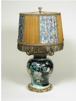
Title: Covered Jar with Black Ground Date: 19th century Primary Maker: Chinese, Qing Dynasty (1644–1911) Medium: Famille noire porcelain Dimensions: 16 x 10 in. (40.6 x 25.4 cm)