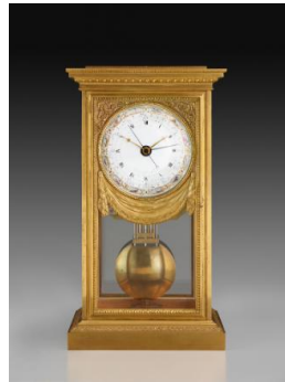
Title: Regulator Clock Showing Mean and Solar Time Date: 1792 Primary Maker: Robert Robin Medium: Gilt brass, steel, polychrome enamel and gold on gilt brass and bronze Dimensions: 16 5/8 × 9 3/8 × 7 5/8 in. (42.2 × 23.8 × 19.4 cm)