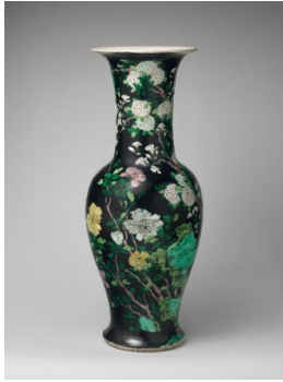
Title: Vase Date: probably 19th century Primary Maker: Chinese, Qing Dynasty (1644–1911) Medium: Famille noire porcelain Dimensions: 27 x 10 1/2 in. (68.6 x 26.7 cm)