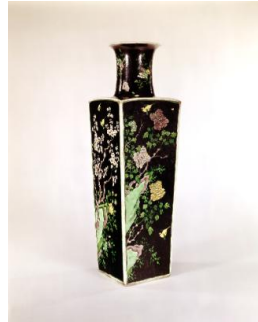
Title: Two Square Vases Date: probably 19th century Primary Maker: Chinese, Qing Dynasty (1644–1911) Medium: Famille noire porcelain Dimensions: H.: 19 1/4 in. (48.9 cm)