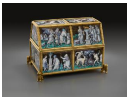
Title: Casket: Old Testament Subjects Date: mid-16th century, with later additions Primary Maker: Pierre Reymond Medium: Painted enamel on copper, partly gilded, and gilt brass Dimensions: 4 1/2 × 6 1/2 × 4 1/2 in. (11.4 × 16.5 × 11.4 cm)