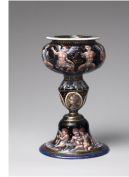
Title: Saltcellar: Amorini and Satyrs Date: mid-16th century Primary Maker: Pierre Reymond Medium: Painted enamel on copper, partly gilded Dimensions: H.: 5 9/16 in. (14.1 cm), diam.: 3 1/2 in. (8.9 cm)