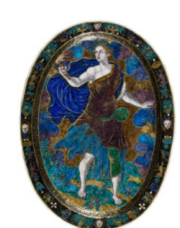
Title: Oval Plate: Ceres Holding a Torch; Minerva Date: late 16th century Primary Maker: Martial Reymond Medium: Enamel on copper Dimensions: 14 1/2 × 10 9/16 in. (36.8 × 26.8 cm)