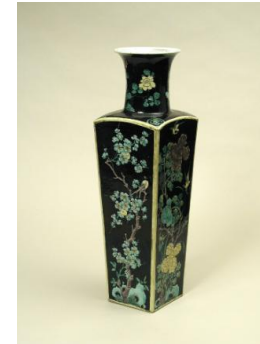
Title: Two Square Vases Date: probably 19th century Primary Maker: Chinese, Qing Dynasty (1644–1911) Medium: Famille noire porcelain Dimensions: H.: 19 1/4 in. (48.9 cm)