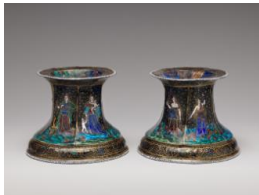
Title: Pair of Saltcellars: The Story of Minos and Scylla, and Allegorical Figures Date: early 17th century Primary Maker: Jean Guibert Medium: Painted enamel on copper, partly gilded Dimensions: H.: 4 3/8 in. (11.1 cm), diam.: 6 in. (15.2 cm)