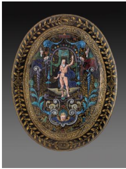
Title: Oval Dish: Jupiter Date: late 16th century Primary Maker: Jean Reymond Medium: Painted enamel on copper, partly gilded Dimensions: 20 3/8 × 16 × 2 in. (51.8 × 40.6 × 5.1 cm)