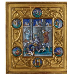
Title: Plaque: Christ Crowned with Thorns Date: mid- to late 16th century Primary Maker: Pierre Reymond Medium: Painted enamel on copper, partly gilded Dimensions: Plaque: 8 x 6 1/4 in. (20.3 x 15.9 cm) Roundels: diam. 2 1/16 in. (5.2 cm)