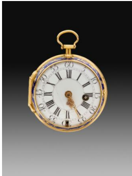
Title: Pocket Watch Date: ca. 1750 Primary Maker: Julien Le Roy Medium: Gold and enamel Dimensions: 2 1/4 x 1 3/4 x 1 3/4 in. (5.8 x 4.5 x 4.4 cm)