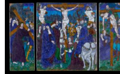
Title: Triptych: The Way to Calvary; The Crucifixion; The Deposition Date: ca. 1520–25 Primary Maker: Nardon Pénicaud Medium: Painted enamel on copper, partly gilded Dimensions: Central plaque: 10 3/16 × 9 1/2 in. (25.9 × 24.1 cm) Wings: 10 1/2 × 3 3/4 in. (26.7 × 9.5 cm)