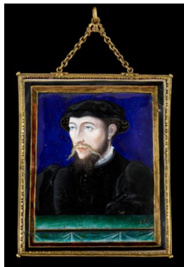
Title: Portrait of a Man (Antoine de Bourbon?) Date: ca. 1560 Primary Maker: Léonard Limosin (or Limousin) Medium: Enamel on copper Dimensions: 5 1/8 × 4 1/2 in. (13 × 11.4 cm)