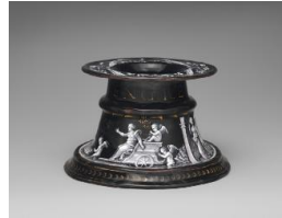
Title: Saltcellar Date: ca. 1545 Primary Maker: Pierre Reymond Medium: Limoges; enamel on copper, parcel-gilt Dimensions: H.: 2 13/16 (7.1 cm); diam.: 4 3/4 in. (12.1 cm)