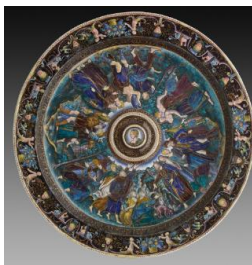
Title: Ewer Stand: Moses Striking the Rock Date: late 16th century Primary Maker: Pierre Reymond Medium: Painted enamel on copper, partly gilded Dimensions: H.: 1 1/2 in. (3.8 cm), diam.: 18 in. (45.7 cm)