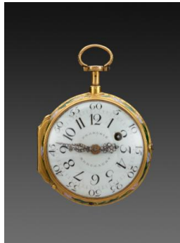
Title: Pocket Watch Date: 1750-55 Primary Maker: François Beeckaert Medium: Gold and enamel Dimensions: 2 1/4 x 1 3/4 x 1 3/4 in. (5.7 x 4.4 x 4.4 cm)