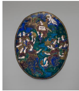
Title: Oval Medallion, Apollo and the Muses Date: ca. 1600 Primary Maker: Suzanne de Court Medium: Limoges; enamel on copper, parcel-gilt Dimensions: 4 1/4 × 3 1/2 in. (10.8 × 8.9 cm)