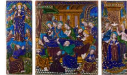
Title: Triptych: The Death of the Virgin with The Assumption and The Coronation Date: ca. 1520–25 Primary Maker: Nardon Pénicaud Medium: Painted enamel on copper, partly gilded Dimensions: Central plaque: 9 1/8 × 7 1/2 in. (23.2 × 19.1 cm) Wings: 9 1/8 × 3 1/4 in.