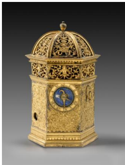
Title: Table Clock Date: ca. 1530 Primary Maker: Pierre de Fobis Medium: Gilt brass and enamel Dimensions: 5 × 2 3/4 × 2 3/4 in. (12.8 × 7 × 7 cm)