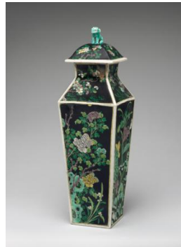
Title: Pair of Square Vases with Covers Date: probably 19th century Primary Maker: Chinese, Qing Dynasty (1644–1911) Medium: Famille noire porcelain Dimensions: H.: 19 1/4 in. (48.9 cm)