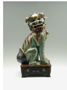
Title: Pair of Lions Date: 18th century Primary Maker: Chinese, Qing Dynasty (1644–1911) Medium: Famille verte porcelain Dimensions: H.: 19 in. (48.3 cm)