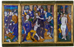
Title: Triptych: Christ Crowned with Thorns with The Kiss of Judas and The Flagellation Date: ca. 1525–35 Primary Maker: Jean Pénicaud I Medium: Painted enamel on copper, partly gilded Dimensions: 21 x 13 3/16 in. (53.3 x 33.5 cm) Central plaque: 10 5/8 x 9 3/8 in. (27 x 23.8 cm) Wings: 10 5/8 x 4 3/16 in. (27 x 10.6 cm)