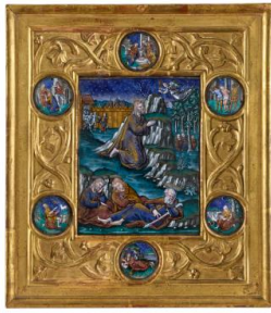
Title: Plaque: The Agony in the Garden Date: mid- to late 16th century Primary Maker: Pierre Reymond Medium: Painted enamel on copper, partly gilded Dimensions: Plaque: 8 x 6 1/4 in. (20.3 x 15.9 cm) Roundels: diam. 2 1/16 in. (5.2 cm)