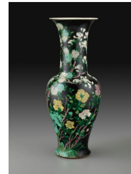
Title: Vase Date: probably 19th century Primary Maker: Chinese, Qing Dynasty (1644-1911) Medium: Hard-paste porcelain with polychrome overglaze Dimensions: H.: 27 in. (68.6 cm), diam.: 11 in. (27.9 cm)