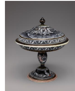
Title: Covered Tazza (One of a Pair) Date: late 16th century Primary Maker: Pierre Reymond Medium: Limoges; enamel on copper, parcel-gilt Dimensions: H.: 8 1/2 in. (21.6 cm); diam.: 7 1/4 in. (18.4 cm)