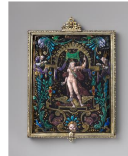
Title: Plaque: Jupiter under a Canopy Date: 16th century Primary Maker: Jean de Court (Master I.C.) Medium: Limoges; enamel on copper, parcel-gilt Dimensions: 4 3/16 x 3 3/8 in. (10.6 x 8.6 cm)