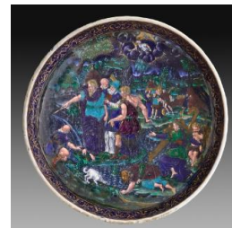
Title: Cup: Moses Striking the Rock Date: late 16th century Primary Maker: Master I.C. Medium: Painted enamel on copper, partly gilded Dimensions: H.: 4 5/8 in. (11.7 cm), diam.: 10 in. (25.4 cm)