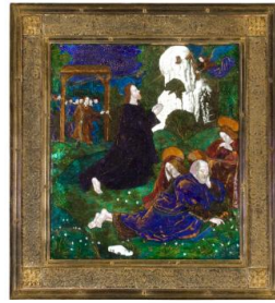
Title: The Agony in the Garden Date: ca. 1520–25 Primary Maker: Jean Pénicaud I Medium: Painted enamel on copper, partly gilded Dimensions: 10 7/8 × 9 1/2 in. (27.6 × 24.1 cm)