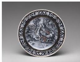
Title: Jason Confronting the Dragon Guarding the Golden Fleece Date: 1567–68 Primary Maker: Pierre Reymond Medium: Limoges; enamel on copper, parcel-gilt Dimensions: Diam.: 7 15/16 in. (20.2 cm); d.: 7/8 in. (2.2 cm)