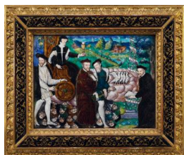
Title: The Triumph of the Eucharist and the Catholic Faith Date: 1561–62 Primary Maker: Léonard Limosin (or Limousin) Medium: Painted enamel on copper, partly gilt Dimensions: 7 3/4 × 10 in. (19.7 × 25.4 cm)