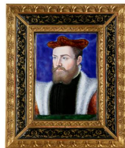
Title: Odet de Coligny, Cardinal de Chatillon (1515–1571) Date: ca. 1555 Primary Maker: Léonard Limosin (or Limousin) Medium: Enamel on copper Dimensions: 7 1/2 x 5 1/4 in. (19 x 13.4 cm)