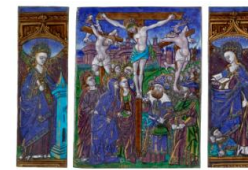
Title: Triptych: The Crucifixion; Saint Barbara; Saint Catherine of Alexandria Date: ca. 1500 Primary Maker: Master of the Orléans Triptych Medium: Painted enamel on copper, partly gilded Dimensions: 16 1/4 × 8 7/8 in. (41.3 × 22.5 cm) Central plaque: 8 × 6 3/8 in. (20.3 × 16.2 cm) Wings: 8 1/8 × 2 5/8 in. (20.6 × 6.7 cm)