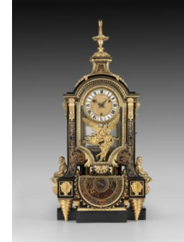
Title: Barometer Clock Date: ca. 1690–1700 Primary Maker: André-Charles Boulle Medium: Ebony, turtle shell, brass, gilt bronze, and enamel Dimensions: 45 1/4 × 23 1/8 × 10 1/4 in. (114.9 × 58.7 × 26 cm)