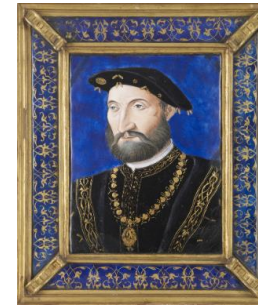
Title: Guy Chabot, Baron de Jarnac Date: 1540-45 Primary Maker: Léonard Limosin (or Limousin) Medium: Enamel on copper Dimensions: 9 3/8 x 7 1/16 in. (23.8 x 17.9 cm)