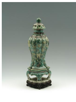
Title: Jar (One of Five Piece Set with Famille Verte Decoration) Date: probably 18th century Primary Maker: Chinese, Qing Dynasty (1644–1911) Medium: Famille verte porcelain Dimensions: H.: 10 1/8 in. (25.7 cm)