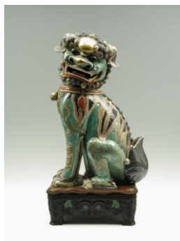
Title: Pair of Lions Date: 18th century Primary Maker: Chinese, Qing Dynasty (1644–1911) Medium: Famille verte porcelain Dimensions: H.: 19 in. (48.3 cm)