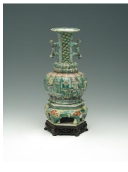
Title: Jar (One of a Five Piece Set with Famille Verte Decoration) Date: probably 18th century Primary Maker: Chinese, Qing Dynasty (1644–1911) Medium: Famille verte porcelain Dimensions: H.: 8 5/8 in. (21.9 cm)