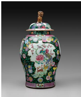
Title: Two Covered Jars with Famille Rose Decoration Date: 18th century Primary Maker: Chinese, Qing Dynasty (1644–1911) Medium: Hard-paste porcelain with polychrome overglaze Dimensions: 33 x 18 3/4 in. (83.8 x 47.6 cm)