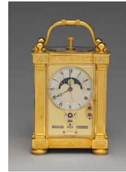
Title: Carriage Clock with Calendar Date: 1811 Primary Maker: Abraham-Louis Breguet Medium: Gilt bronze, silver, and enamel Dimensions: 4 3/8 × 3 5/16 × 2 7/16 in. (11.1 × 8.4 × 6.2 cm)