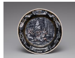
Title: Calendar Plate for May Date: ca. 1565–75 Primary Maker: Martial Courteys Medium: Limoges; enamel on copper, parcel-gilt Dimensions: Diam.: 7 5/16 in. (18.6 cm); d.: 1/2 in. (1.3 cm)