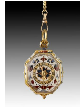
Title: Pendant Watch Date: ca. 1620 Primary Maker: C. De Lespée Medium: Gold, rock crystal, and enamel Dimensions: 2 5/8 x 1 9/16 x 1 1/16 in. (6.6 x 3.9 x 2.8 cm)