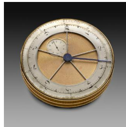
Title: Double-Dial Desk Watch Showing Decimal and Traditional Time Date: ca. 1795–after 1807 Primary Maker: Abraham-Louis Breguet Medium: Gold, enamel, gilt brass, brass, and steel Dimensions: 2 7/8 × 2 7/8 × 13/16 in. (7.3 × 7.3 × 2 cm) H.: 15/16 in. (2.4 cm), diam.: 2 7/8 in. (7.3 cm)