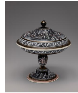
Title: Covered Tazza (One of a Pair) Date: late 16th century Primary Maker: Pierre Reymond Medium: Limoges; enamel on copper, parcel-gilt Dimensions: H.: 8 1/2 in. (21.6 cm); diam.: 7 1/4 in. (18.4 cm)