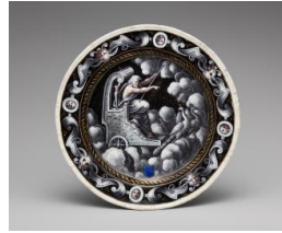
Title: Dish with Jupiter on a Chariot Date: mid 16th century Primary Maker: Jean de Court (Master I.C.) Medium: Limoges; enamel on copper, parcel-gilt Dimensions: Diam.: 9 in. (22.9 cm); d.: 5/8 in. (1.6 cm)