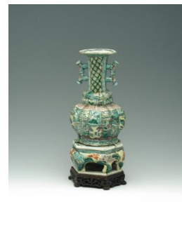
Title: Jar (One of a Five Piece Set with Famille Verte Decoration) Date: probably 18th century Primary Maker: Chinese, Qing Dynasty (1644–1911) Medium: Famille verte porcelain Dimensions: H.: 8 5/8 in. (21.9 cm)