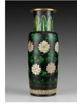
Title: Cylindrical Vase Date: probably 19th century Primary Maker: Chinese, Qing Dynasty (1644–1911) Medium: Famille noire porcelain Dimensions: 22 x 8 in. (55.9 x 20.3 cm)