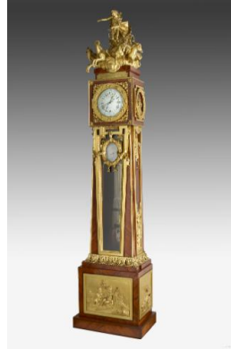
Title: Longcase Regulator Clock Date: 1767 Primary Maker: Balthazar Lieutaud Medium: Oak veneered with various woods including tulipwood, kingwood, and amaranth; gilt bronze, enamel, and marble Dimensions: 100 × 21 3/4 × 13 5/8 in. (254 × 55.2 × 34.6 cm)