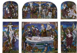
Title: Double-Tiered Triptych: Scenes from the Passion of Christ Date: mid-16th century Primary Maker: Nardon Pénicaud Medium: Painted enamel on copper, partly gilded Dimensions: 14 × 16 in. (35.6 × 40.6 cm) Upper central plaque: 5 1/2 × 11 in. (14 × 27.9 cm) Upper wings: 5 3/4 × 4 3/4 in. (14.6 × 12.1 cm) Lower central plaque: 9 7/8 × 11 3/8 in. (25.1 × 28.9 cm) Lower wings: 9 3/4 × 5 in. (24.8 × 12.7 cm)