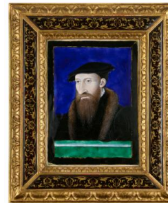
Title: Portrait of a Man (Guillaume Farel?) Date: 1546 Primary Maker: Léonard Limosin (or Limousin) Medium: Enamel on copper Dimensions: 7 9/16 × 5 5/8 in. (19.2 × 14.3 cm)