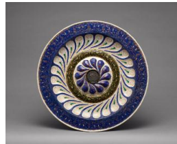
Title: Dish Date: early 16th century Primary Maker: Italian, Venice Medium: Enamel on copper, parcel-gilt Dimensions: Diam.: 17 1/2 in. (43.8 cm); d.: 1 5/8 in. (4.1 cm)