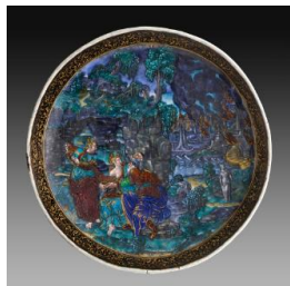
Title: Cup: Lot and His Daughters Date: late 16th century Primary Maker: Master I.C. Medium: Painted enamel on copper, partly gilded Dimensions: H.: 4 3/8 in. (11.1 cm), diam.: 9 7/8 in. (25.1 cm)