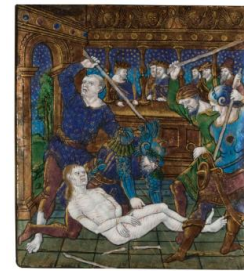
Title: Martyrdom of a Saint Date: ca. 1525–35 Primary Maker: Jean Pénicaud I Medium: Painted enamel on copper, partly gilded Dimensions: 6 1/2 × 6 1/8 in. (16.5 × 15.6 cm)