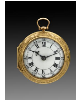
Title: Pocket Watch Date: 1757 Primary Maker: Thomas Mudge Medium: Gold and enamel Dimensions: 2 3/8 × 1 15/16 × 1 3/4 in. (6 × 4.9 × 4.4 cm)