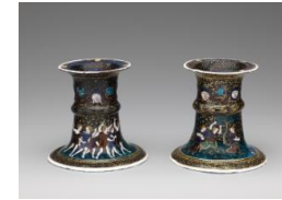
Title: Pair of Saltcellars: Scenes from the Story of Orpheus Date: late 16th or early 17th century Primary Maker: Suzanne de Court Medium: Painted enamel on copper, partly gilded Dimensions: H.: 3 1/2 in. (8.9 cm), diam.: 3 9/16 in. (9 cm)