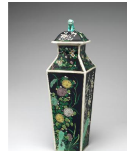
Title: Pair of Square Vases with Covers Date: probably 19th century Primary Maker: Chinese, Qing Dynasty (1644–1911) Medium: Famille noire porcelain Dimensions: H.: 19 1/4 in. (48.9 cm)