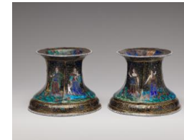
Title: Pair of Saltcellars: The Story of Minos and Scylla, and Allegorical Figures Date: early 17th century Primary Maker: Jean Guibert Medium: Painted enamel on copper, partly gilded Dimensions: H.: 4 3/8 in. (11.1 cm), diam.: 6 in. (15.2 cm)