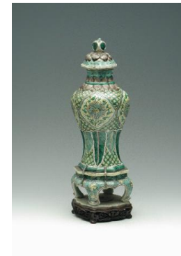
Title: Jar (One of a Five Piece Set with Famille Verte Decoration) Date: 1644-1911 Primary Maker: Chinese, Qing Dynasty (1644-1911) Medium: Famille verte porcelain Dimensions: H.: 10 1/8 in. (25.7 cm)