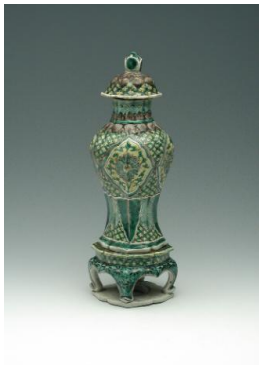
Title: Jar (One of a Five Piece Set with Famille Verte Decoration) Date: 1644-1911 Primary Maker: Chinese, Qing Dynasty (1644-1911) Medium: Famille verte porcelain Dimensions: H.: 10 1/8 in. (25.7 cm)