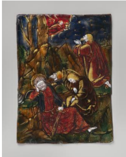
Title: Plaque: Agony in the Garden of Gethsemane Date: mid 16th century Primary Maker: French, Limoges Medium: Limoges; enamel on copper, parcel-gilt Dimensions: 4 3/4 × 3 1/2 in. (12.1 × 8.9 cm)