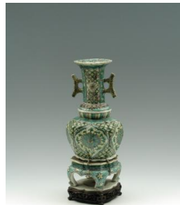
Title: Jar (One of a Five Piece Set with Famille Verte Decoration) Date: 1644-1911 Primary Maker: Chinese, Qing Dynasty (1644-1911) Medium: Famille verte porcelain Dimensions: H.: 8 5/8 in. (21.9 cm)