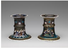
Title: Pair of Saltcellars: Scenes from the Story of Orpheus Date: late 16th or early 17th century Primary Maker: Suzanne de Court Medium: Painted enamel on copper, partly gilded Dimensions: H.: 3 1/2 in. (8.9 cm), diam.: 3 9/16 in. (9 cm)