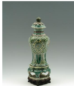
Title: Jar (One of a Five Piece Set with Famille Verte Decoration) Date: 1644-1911 Primary Maker: Chinese, Qing Dynasty (1644-1911) Medium: Famille verte porcelain Dimensions: H.: 10 1/8 in. (25.7 cm)