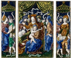
Title: Triptych: The Lineage of St. Anne Date: 19th century (?) Primary Maker: Jean II Pénicaud Medium: Enamel on copper Dimensions: Central Plaque: 11 3/4 × 7 1/2 in. (29.8 × 19.1 cm); wings: 11 3/4 × 3 1/8 in. (29.8 × 7.9 cm)