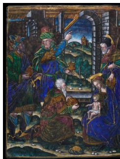
Title: The Adoration of the Magi Date: late 16th century Primary Maker: Jean Reymond Medium: Painted enamel on copper, partly gilded Dimensions: 11 7/8 × 9 1/2 in. (30.2 × 24.1 cm)