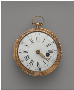
Title: Pendant Watch Date: ca. 1765 Primary Maker: Dutertre Medium: Gold, gilt brass, enamel, and copper Dimensions: 2 3/8 × 1 7/8 × 1 in. (6 × 4.8 × 2.5 cm)