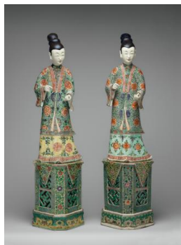
Title: Two Figures of Ladies on Stands Date: 1662–1722 Primary Maker: Chinese, Qing Dynasty (1644–1911), Kangxi Period (1662–1722) Medium: Hard-paste porcelain with polychrome overglaze Dimensions: 38 × 10 1/4 × 10 1/4 in. (96.5 × 26 × 26 cm)