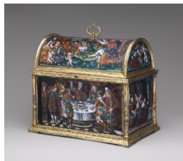
Title: Casket: Old Testament Subjects Date: mid-16th century Primary Maker: Pierre Courteys Medium: Enamel on copper with gilt-metal frame Dimensions: 8 5/16 × 9 13/16 × 6 1/4 in. (21.1 × 24.9 × 15.9 cm)