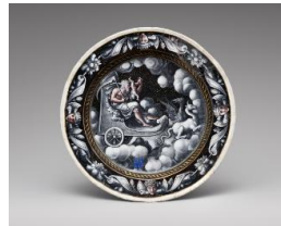
Title: Dish with Saturn on a Chariot Date: late 16th century Primary Maker: Jean de Court (Master I.C.) Medium: Limoges; enamel on copper, parcel-gilt Dimensions: Diam.: 9 in. (22.9 cm); d.: 5/8 in. (1.6 cm)