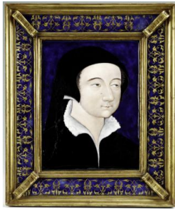
Title: Louise de Pisseleu, Madame de Jarnac Date: late 16th century or later Primary Maker: Léonard Limosin (or Limousin) Medium: Enamel on copper Dimensions: 9 3/8 × 7 1/16 in. (23.8 × 17.9 cm)