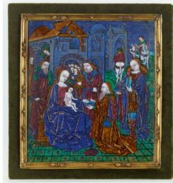
Title: The Adoration of the Magi Date: ca. 1510 Primary Maker: Master of the Large Foreheads Medium: Painted enamel on copper, partly gilded Dimensions: 10 1/4 × 9 1/8 in. (26 × 23.2 cm)