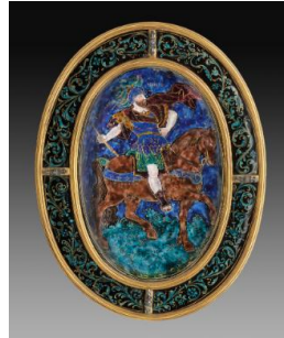
Title: Ninus, King of Nineveh Date: early 17th century or later Primary Maker: Jean II Limousin Medium: Enamel on copper Dimensions: 8 3/16 × 5 5/8 in. (20.8 × 14.3 cm)