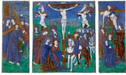
Title: Triptych: The Way to Calvary; The Crucifixion; The Deposition Date: ca. 1510 Primary Maker: Master of the Large Foreheads Medium: Painted enamel on copper, partly gilded Dimensions: Central plaque: 9 1/4 × 8 1/8 in. (23.5 × 20.6 cm) Wings: 9 1/4 × 3 1/2 in. (23.5 × 8.9 cm)