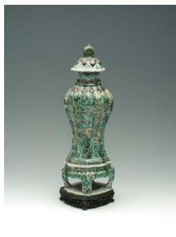
Title: Jar (One of a Five Piece Set with Famille Verte Decoration) Date: probably 18th century Primary Maker: Chinese, Qing Dynasty (1644–1911) Medium: Famille verte porcelain Dimensions: H.: 10 1/8 in. (25.7 cm)