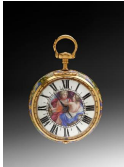
Title: Pendant Watch Date: ca. 1685 Primary Maker: Henry Arlaud Medium: Gold and enamel Dimensions: 2 5/16 x 1 5/8 x 15/16 in. (5.9 x 4.1 x 2.4 cm)