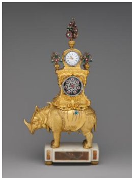
Title: Musical Automaton Rhinoceros Clock Date: ca. 1765-72 Primary Maker: James Cox Medium: Case: gilt bronze, silver enamel, and paste jewels Pedestal: white marble and agate Dimensions: 15 9/16 × 8 3/8 × 3 1/2 in. (39.5 × 21.3 × 8.9 cm)