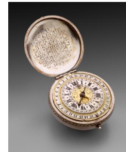
Title: Silver Case Verge Watch Date: 1643 Primary Maker: Robert Grinkin Medium: Silver Dimensions: 2 3/4 x 1 7/8 x 7/8 in. (7 x 4.8 x 2.2 cm)