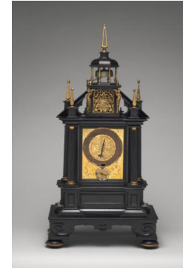
Title: Altar Clock Date: ca. 1635 Primary Maker: Hans Bushman Medium: Ebony and gilt brass Dimensions: 26 7/8 x 13 3/4 x 7 7/8 in. (68.2 x 34.9 x 20 cm)