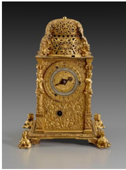
Title: Tower Table Clock Date: ca. 1580 Primary Maker: German, probably Augsburg Medium: Gilt brass Dimensions: 9 3/4 x 7 1/8 x 7 1/8 in. (24.8 x 18.1 x 18.1 cm)