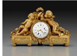
Title: Mantel Clock Date: ca. 1770 Primary Maker: Ferdinand Berthoud Medium: Gilt bronze Dimensions: 16 1/4 x 26 1/4 x 7 7/8 in. (41.3 x 66.7 x 20 cm)