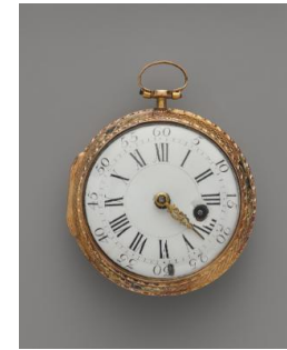
Title: Pendant Watch Date: ca. 1765 Primary Maker: Dutertre Medium: Gold, gilt brass, enamel, and copper Dimensions: 2 3/8 x 1 7/8 x 1 in. (6 x 4.8 x 2.5 cm)