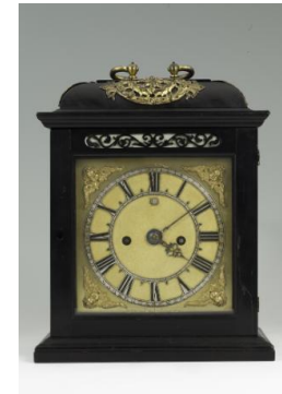
Title: Ebony Bracket Clock Date: 1685 Primary Maker: Joseph Knibb Medium: Ebony on oak Dimensions: 13 3/8 x 9 9/16 x 6 in. (34 x 24.3 x 15.2 cm)