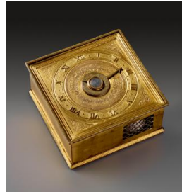
Title: Table Clock Date: ca. 1565 Primary Maker: Flemish Medium: Gilt brass Dimensions: 2 7/16 x 5 3/16 x 5 1/4 in. (6.2 x 13.2 x 13.3 cm)