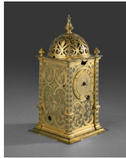
Title: Gilt-Brass Tower Table Clock Date: ca. 1575 Primary Maker: Hans Koch Medium: Cast and sheet gilt brass Dimensions: 7 1/8 x 3 9/16 x 3 9/16 in. (18.1 x 9 x 9 cm)