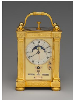
Title: Carriage Clock with Calendar Date: 1811 Primary Maker: Abraham-Louis Breguet Medium: Gilt bronze, silver, and enamel Dimensions: 4 3/8 × 3 5/16 × 2 7/16 in. (11.1 × 8.4 × 6.2 cm)