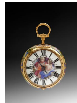
Title: Pendant Watch Date: ca. 1685 Primary Maker: Henry Arlaud Medium: Gold and enamel Dimensions: 2 5/16 × 1 5/8 × 15/16 in. (5.9 × 4.1 × 2.4 cm)