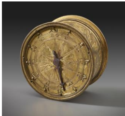
Title: Portable Drum Clock Date: ca. 1550 Primary Maker: German, probably Augsburg Medium: Gilt brass Dimensions: H.: 1 1/2 in. (3.8 cm), diam.: 2 3/8 in. (6 cm)