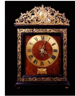
Title: Pendulum Wall Clock Date: ca. 1665 Primary Maker: Nicolas Hanet Medium: Ebony and bronze on walnut and fruitwood Dimensions: 16 7/8 × 10 3/4 × 4 5/8 in. (42.9 × 27.3 × 11.7 cm)