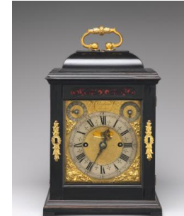
Title: Bracket Clock Date: ca. 1695-97 Primary Maker: George Graham Medium: Ebony and oak Dimensions: 11 5/16 x 6 15/16 x 4 13/16 in. (28.7 x 17.7 x 12.3 cm)