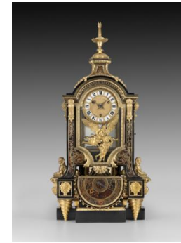
Title: Barometer Clock Date: ca. 1690-1700 Primary Maker: André-Charles Boulle Medium: Ebony, turtle shell, brass, gilt bronze, and enamel Dimensions: 45 1/4 x 23 1/8 x 10 1/4 in. (114.9 x 58.7 x 26 cm)