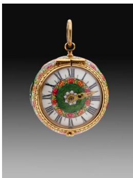
Title: Pendant Watch Date: ca. 1660 Primary Maker: Chavannes le Jeune Medium: Gold and enamel Dimensions: 1 7/8 × 1 5/16 × 1 1/4 in. (4.7 × 3.3 × 3.2 cm)