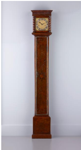
Title: Longcase Clock Date: ca. 1675–80 Primary Maker: Edward East Medium: Olive wood and brass on oak, walnut, and burl wood Dimensions: 79 1/2 × 16 1/8 × 9 in. (201.9 × 41 × 22.9 cm)