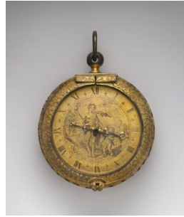
Title: Gilt Brass Coach Clock-Watch Date: 1645 Primary Maker: Pierre Norry Medium: Gilt brass, glass Dimensions: 6 5/8 x 4 7/8 x 2 1/2 in. (16.8 x 12.3 x 6.4 cm)