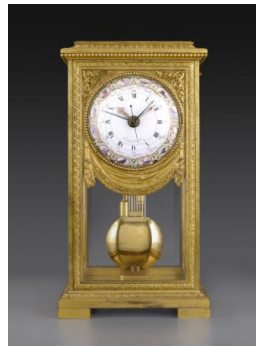
Title: Regulator Clock Showing Mean and Solar Time Date: 1784 Primary Maker: Robert Robin Medium: Gilt brass, steel, polychrome enamel and gold on gilt brass and bronze Dimensions: 16 1/8 x 8 3/4 x 6 13/16 in. (41 x 22.3 x 17.3 cm)