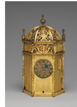
Title: Table Clock Date: ca. 1550 Primary Maker: French, Sixteenth Century Medium: Gilt brass Dimensions: 5 1/4 × 3 1/16 × 2 3/4 in. (13.3 × 7.7 × 7 cm)