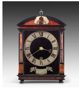
Title: Hague Clock Date: probably ca. 1678–85 Primary Maker: Benjamin Lisle Medium: Silver, tortoiseshell and ebony on oak, ebony, and tortoiseshell Dimensions: 14 1/4 × 9 3/4 × 4 7/8 in. (36.2 × 24.8 × 12.4 cm)