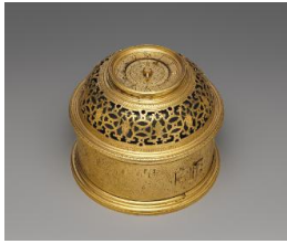
Title: Drum Table Clock Date: ca. 1575 Primary Maker: Pierre Auvray Medium: Gilded brass on brass Dimensions: 4 1/8 x 5 x 5 in. (10.5 x 12.7 x 12.7 cm)