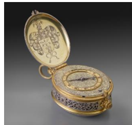
Title: Pendant Clock Date: ca. 1620 Primary Maker: Abraham Gribelin Medium: Silver Dimensions: 3 1/4 x 1 7/8 x 1 1/8 in. (8.3 x 4.7 x 2.9 cm)