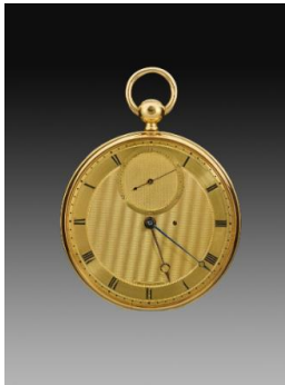
Title: Pocket Watch with Tourbillon Date: ca. 1820 Primary Maker: Abraham-Louis Breguet Medium: Gold, gilt brass, and steel Dimensions: 3 1/8 x 2 5/16 x 2 5/8 in. (8 x 5.9 x 6.7 cm)