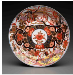
Title: Stand for a Tureen Date: ca. 1740 Primary Maker: Meissen Porcelain Manufactory Medium: Hard-paste porcelain Dimensions: Diam.: 16 5/8 in. (42.5 cm)