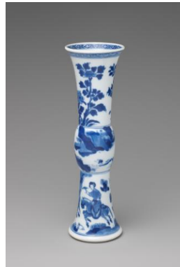
Title: Slim Beaker Vase Date: 1662–1722 Primary Maker: Chinese, Qing Dynasty (1644–1911), Kangxi Period (1662–1722) Medium: Hard-paste porcelain with underglaze blue Dimensions: 7 11/16 x 2 5/16 in. (19.5 x 5.8 cm)