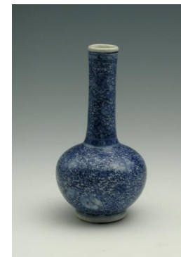
Title: Bottle-Shaped Vase Date: 1662–1722 Primary Maker: Chinese, Qing Dynasty (1644–1911), Kangxi Period (1662–1722) Medium: Hard-paste porcelain with underglaze blue Dimensions: 4 5/16 x 2 5/16 in. (11 x 5.9 cm)