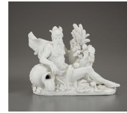
Title: River God Date: ca. 1740 Primary Maker: Meissen Porcelain Manufactory Medium: Hard-paste porcelain Dimensions: H.: 5 3/4 in. (14.6 cm)