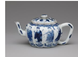
Title: Squat Melon-Form Wine Ewer Date: 17th century Primary Maker: Chinese, Transitional Period (1620–1683) Medium: Hard-paste porcelain with underglaze blue Dimensions: 3 1/8 x 6 x 3 1/4 in. (8 x 15.2 x 8.3 cm)