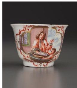
Title: Tea Bowl and Saucer

Date: ca. 1737–40 Primary Maker: Meissen Porcelain Manufactory Medium: Hard-paste porcelain Dimensions: Cup H.: 3 3/8 in. (8.6 cm); diam.: 3 in. (7.6 cm); Saucer diam.: 5 7/8 in. (14.9 cm)