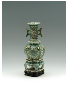
Title: Jar (One of a Five Piece Set with Famille Verte Decoration) Date: 1644-1911 Primary Maker: Chinese, Qing Dynasty (1644-1911) Medium: Famille verte porcelain Dimensions: H.: 8 5/8 in. (21.9 cm)