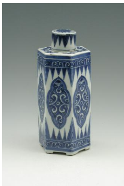
Title: Hexagonal Tea Caddie (One of a Pair) Date: 1662–1722 Primary Maker: Chinese, Qing Dynasty (1644–1911), Kangxi Period (1662–1722) Medium: Hard-paste porcelain with underglaze blue Dimensions: 6 7/8 x 3 1/16 in. (17.4 x 7.8 cm)