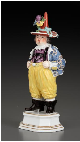
Title: Figure of Hofnarr Fröhlich Date: 1738 Primary Maker: Meissen Porcelain Manufactory Medium: Hard-paste porcelain Dimensions: H.: 9 3/4 in. (24.8 cm)