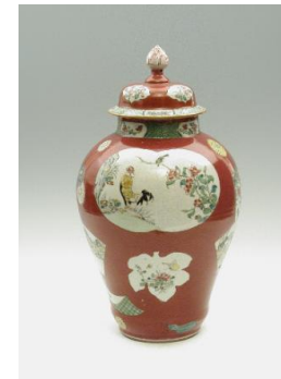
Title: Covered Jar with Famille Rose Decoration Date: 18th century Primary Maker: Chinese, Qing Dynasty (1644-1911) Medium: Hard-paste porcelain with polychrome overglaze Dimensions: 17 3/4 x 10 in. (45.1 x 25.4 cm)