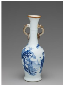
Title: Bottle-Shaped Vase with Handles (One of a Pair) Date: 1662–1722 Primary Maker: Chinese, Qing Dynasty (1644–1911), Kangxi Period (1662–1722) Medium: Hard-paste porcelain with underglaze blue Dimensions: H.: 7 in. (17.8 cm)