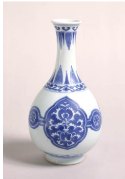
Title: Bottle-Shaped Vase Date: 1662–1722 Primary Maker: Chinese, Qing Dynasty (1644–1911), Kangxi Period (1662–1722) Medium: Hard-paste porcelain with underglaze blue Dimensions: 7 1/2 x 4 1/8 in. (19.1 x 10.5 cm)