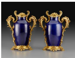
Title: Pair of Mounted Vases Date: ca. 1755-60 Primary Maker: Chinese, Qing Dynasty (1644-1911), First Half of the Eighteenth Century Medium: Hard-paste porcelain and gilt bronze Dimensions: 18 1/8 x 14 1/4 x 8 1/2 in. (46 x 36.2 x 21.6 cm)