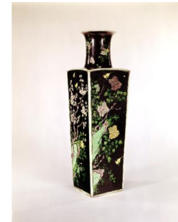
Title: Two Square Vases Date: probably 19th century Primary Maker: Chinese, Qing Dynasty (1644–1911) Medium: Famille noire porcelain Dimensions: H.: 19 1/4 in. (48.9 cm)