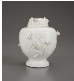
Title: Tea Caddy Date: ca. 1715 Primary Maker: Meissen Porcelain Manufactory Medium: Hard-paste porcelain Dimensions: H.: 6 in. (15.2 cm)