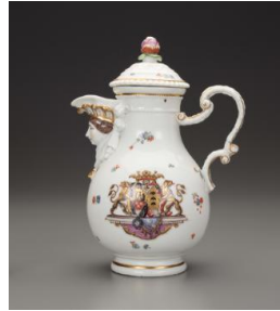
Title: Small Pot from the "Sulkowski" Service Date: ca. 1737 Primary Maker: Meissen Porcelain Manufactory Medium: Hard-paste porcelain Dimensions: H.: 8 1/4 in. (21 cm)