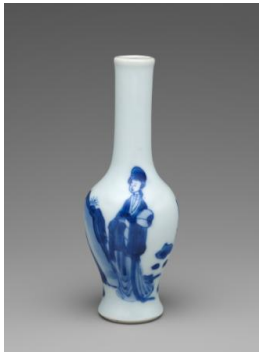
Title: Bottle-Shaped Vase Date: 1662–1722 Primary Maker: Chinese, Qing Dynasty (1644–1911), Kangxi Period (1662–1722) Medium: Hard-paste porcelain with underglaze blue Dimensions: 5 5/8 x 2 1/16 in. (14.3 x 5.2 cm)