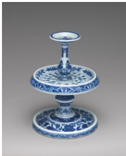
Title: Pricket Candlestick (One of a Pair) Date: 1736–96 Primary Maker: Chinese, Qing Dynasty (1644–1911), Qianlong Period (1736–1796) Medium: Hard-paste porcelain with underglaze blue Dimensions: 5 1/4 x 3 7/8 in. (13.3 x 9.8 cm)