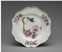
Title: Two Plates from the “Brühl'sche Allerlei” Service Date: 1743–47 Primary Maker: Meissen Porcelain Manufactory Medium: Hard-paste porcelain Dimensions: Diam.: 10 3/8 in. (26.5 cm)