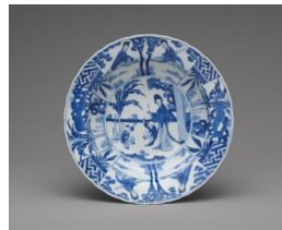
Title: Deep Plate (One of a Pair) Date: 1662–1722 Primary Maker: Chinese, Qing Dynasty (1644–1911), Kangxi Period (1662–1722) Medium: Hard-paste porcelain with underglaze blue Dimensions: 2 1/16 x 8 11/16 in. (5.3 x 22 cm)