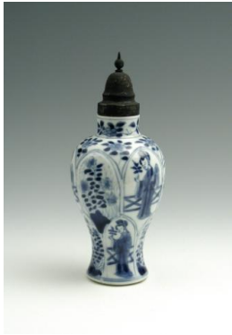
Title: Jar Date: 1662–1722 Primary Maker: Chinese, Qing Dynasty (1644–1911), Kangxi Period (1662–1722) Medium: Hard-paste porcelain with underglaze blue Dimensions: 6 x 2 1/2 in. (15.2 x 6.4 cm)