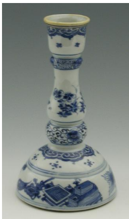
Title: Candlestick (One of a Pair) Date: 1662–1722 Primary Maker: Chinese, Qing Dynasty (1644–1911), Kangxi Period (1662–1722) Medium: Hard-paste porcelain with underglaze blue Dimensions: 7 x 4 in. (17.8 x 10.2 cm)