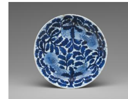
Title: Deep Plate (One of a Pair) Date: 1662–1722 Primary Maker: Chinese, Qing Dynasty (1644–1911), Kangxi Period (1662–1722) Medium: Hard-paste porcelain with underglaze blue Dimensions: 8 3/8 x 4 1/4 in. (21.3 x 10.8 cm)