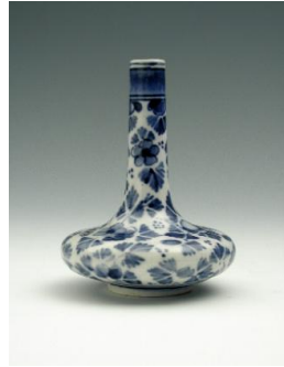
Title: Bottle Date: 1662–1722 Primary Maker: Chinese, Qing Dynasty (1644–1911), Kangxi Period (1662–1722) Medium: Hard-paste porcelain with underglaze blue Dimensions: 3 1/16 x 2 1/4 in. (7.7 x 5.7 cm)