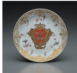
Title: Plate from the "Coronation" Service Date: ca. 1733–34 Primary Maker: Meissen Porcelain Manufactory Medium: Hard-paste porcelain Dimensions: Diam.: 9 in. (22.8 cm)