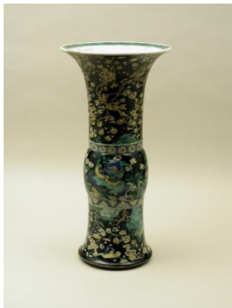
Title: Pair of Vases Date: 18th century Primary Maker: Chinese, Qing Dynasty (1644–1911) Medium: Famille noire porcelain Dimensions: 18 x 9 in. (45.7 x 22.9 cm)