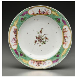
Title: Plate Date: ca. 1725–30 Primary Maker: Meissen Porcelain Manufactory Medium: Hard-paste porcelain Dimensions: Diam.: 8 3/4 in. (22.4 cm)