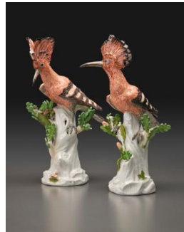
Title: Pair of Hoopoes ("Wiedehopf") on Tree Trunks Date: 1736 Primary Maker: Meissen Porcelain Manufactory Medium: Hard-paste porcelain Dimensions: H.: 12 3/16 in. (31 cm)