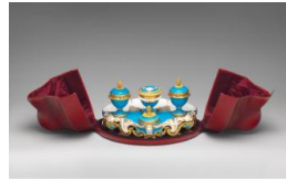
Title: Inkstand with Turquoise Blue Ground and Gilt-Bronze Mounts Date: 18th century Primary Maker: Sèvres Porcelain Manufactory Medium: Soft-paste porcelain and gilt-bronze mounts Dimensions: 3 3/8 x 9 3/8 x 4 1/2 in. (8.6 x 23.8 x 11.4 cm)