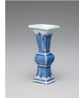
Title: Square Beaker-Form Vase Date: 1736–96 Primary Maker: Chinese, Qing Dynasty (1644–1911), Qianlong Period (1736–1796) Medium: Hard-paste porcelain with underglaze blue Dimensions: 2 1/2 x 1 x 1 in. (6.4 x 2.6 x 2.6 cm)