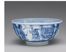
Title: Bowl Date: 1662–1722 Primary Maker: Chinese, Qing Dynasty (1644–1911), Kangxi Period (1662–1722) Medium: Hard-paste porcelain with underglaze blue Dimensions: H.: 3 9/16 in. (9.1 cm)