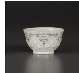
Title: Tea Bowl and Saucer Date: ca. 1715 Primary Maker: Meissen Porcelain Manufactory Medium: Hard-paste porcelain Dimensions: Tea bowl H.: 1 3/4 in. (4.4 cm); Saucer diam.: 1 1/4 in. (3.3 cm)