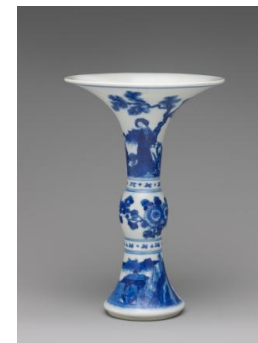
Title: Slender Beaker with Broad Rim Date: 1662–1722 Primary Maker: Chinese, Qing Dynasty (1644–1911), Kangxi Period (1662–1722) Medium: Hard-paste porcelain with underglaze blue Dimensions: 6 7/8 x 4 1/2 in. (17.4 x 11.5 cm)