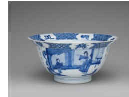
Title: Bowl Date: 1662–1722 Primary Maker: Chinese, Qing Dynasty (1644–1911), Kangxi Period (1662–1722) Medium: Hard-paste porcelain with underglaze blue Dimensions: 4 1/16 x 8 3/8 in. (10.3 x 21.2 cm)