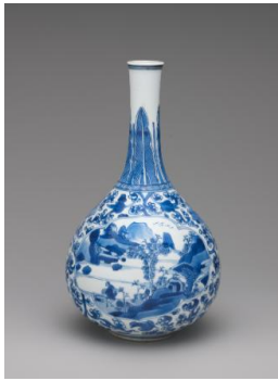
Title: Bottle-Shaped Vase with Globular Body Date: 1662–1722 Primary Maker: Chinese, Qing Dynasty (1644–1911), Kangxi Period (1662–1722) Medium: Hard-paste porcelain with underglaze blue Dimensions: 9 1/2 x 5 3/8 in. (24.1 x 13.7 cm)