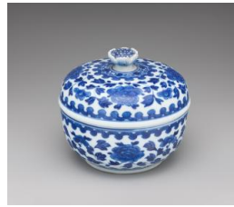
Title: Bowl with Cover Date: 1662–1722 Primary Maker: Chinese, Qing Dynasty (1644–1911), Kangxi Period (1662–1722) Medium: Hard-paste porcelain with underglaze blue Dimensions: 5 x 5 in. (12.7 x 12.7 cm)