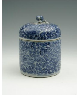
Title: Wine Cup Warmer (One of a Four-Piece Set) Date: late 17th–early 18th century Primary Maker: Chinese, Qing Dynasty (1644–1911) Medium: Hard-paste porcelain with underglaze blue Dimensions: 3 15/16 x 2 13/16 in. (10 x 7.2 cm)