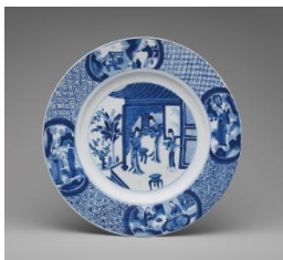
Title: Dish with Broad Flat Rim Date: 1662–1722 Primary Maker: Chinese, Qing Dynasty (1644–1911), Kangxi Period (1662–1722) Medium: Hard-paste porcelain with underglaze blue Dimensions: H.: 1 1/4 in. (3.2 cm), diam.: 10 1/8 in. (25.7 cm)