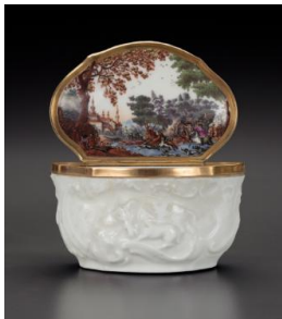
Title: Snuff-Box with Gilt-Metal Mount and Cover Date: ca. 1737–40 Primary Maker: Meissen Porcelain Manufactory Medium: Hard-paste porcelain with gilt-metal mounts Dimensions: H.: 2 1/8 in. (5.4 cm)