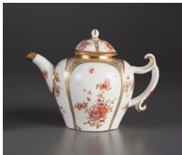
Title: Lobed Teapot Date: ca. 1735 Primary Maker: Meissen Porcelain Manufactory Medium: Hard-paste porcelain Dimensions: H. (without lid): 5 in. (12.7 cm); H. (with lid): 7 in. (18 cm)