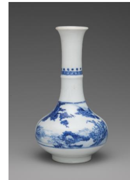
Title: Bottle-Shaped Vase Date: 1662–1722 Primary Maker: Chinese, Qing Dynasty (1644–1911), Kangxi Period (1662–1722) Medium: Hard-paste porcelain with underglaze blue Dimensions: 5 1/2 x 3 in. (14 x 7.6 cm)