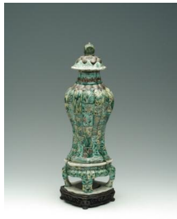
Title: Jar (One of a Five Piece Set with Famille Verte Decoration) Date: probably 18th century Primary Maker: Chinese, Qing Dynasty (1644–1911) Medium: Famille verte porcelain Dimensions: H.: 10 1/8 in. (25.7 cm)