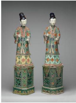
Title: Two Figures of Ladies on Stands Date: 1662–1722 Primary Maker: Chinese, Qing Dynasty (1644–1911), Kangxi Period (1662–1722) Medium: Hard-paste porcelain with polychrome overglaze Dimensions: 38 × 10 1/4 × 10 1/4 in. (96.5 × 26 × 26 cm)