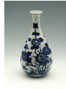
Title: Bottle-Shaped Vase (One of a Set of Three) Date: 1662–1722 Primary Maker: Chinese, Qing Dynasty (1644–1911), Kangxi Period (1662–1722) Medium: Hard-paste porcelain with underglaze blue Dimensions: 5 7/16 x 2 3/4 in. (13.8 x 7 cm)