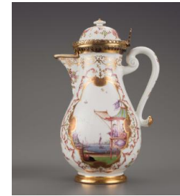
Title: Coffee Pot with Mounted Cover Date: ca. 1725–30 Primary Maker: Meissen Porcelain Manufactory Medium: Hard-paste porcelain with gilt-metal mounts Dimensions: H.: 8 in. (20.3 cm)