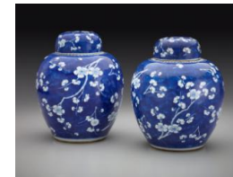
Title: Four Covered Jars with Blue and White Decoration Date: 18th century Primary Maker: Chinese, Qing Dynasty (1644–1911), Kangxi Period (1662–1722) Medium: Hard-paste porcelain decorated with underglaze blue Dimensions: H.: 10 1/8 in. (25.7 cm), diam.: 8 1/2 in. (21.6 cm)