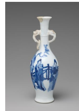
Title: Bottle-Shaped Vase with Handles (One of a Pair) Date: 1662–1722 Primary Maker: Chinese, Qing Dynasty (1644–1911), Kangxi Period (1662–1722) Medium: Hard-paste porcelain with underglaze blue Dimensions: 6 7/8 x 2 5/16 in. (17.5 x 5.9 cm)