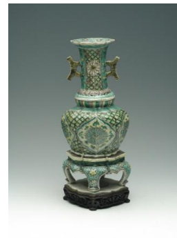
Title: Jar (One of a Five Piece Set with Famille Verte Decoration) Date: 1644-1911 Primary Maker: Chinese, Qing Dynasty (1644-1911) Medium: Famille verte porcelain Dimensions: H.: 8 5/8 in. (21.9 cm)