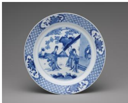
Title: Plate (One of a Set of Four) Date: 1662–1722 Primary Maker: Chinese, Qing Dynasty (1644–1911), Kangxi Period (1662–1722) Medium: Hard-paste porcelain with underglaze blue Dimensions: 1 7/16 x 10 9/16 in. (3.7 x 26.8 cm)