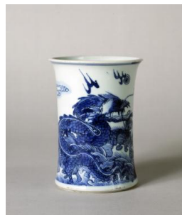
Title: Pi-tung (Brush Holder) Date: 1662–1722 Primary Maker: Chinese, Qing Dynasty (1644–1911), Kangxi Period (1662–1722) Medium: Hard-paste porcelain with underglaze blue Dimensions: 5 9/16 x 4 in. (14.1 x 10.2 cm)