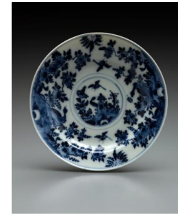
Title: Plate Date: ca. 1724 Primary Maker: Meissen Porcelain Manufactory Medium: Hard-paste porcelain Dimensions: Diam.: 9 7/16 in. (24 cm)