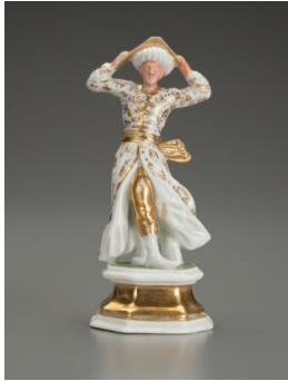
Title: Turkish Male Figure Date: ca. 1725 Primary Maker: Meissen Porcelain Manufactory Medium: Hard-paste porcelain Dimensions: H.: 4 1/4 in. (11 cm)