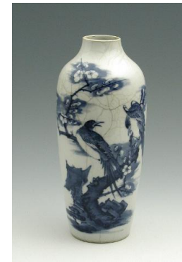
Title: Ovoid Vase Date: 1662–1722 Primary Maker: Chinese, Qing Dynasty (1644–1911), Kangxi Period (1662–1722) Medium: Hard-paste porcelain with underglaze blue Dimensions: 8 5/16 x 3 9/16 in. (21.1 x 9 cm)