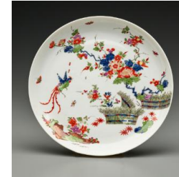
Title: Shallow Dish Date: ca. 1725–30 Primary Maker: Meissen Porcelain Manufactory Medium: Hard-paste porcelain Dimensions: Diam., 8 1/4 in. (21 cm)