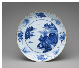
Title: Dish with Foliate Rim Date: 18th century Primary Maker: Chinese, Qing Dynasty (1644–1911) Medium: Hard-paste porcelain with underglaze blue Dimensions: 1 7/8 x 11 in. (4.8 x 27.9 cm)