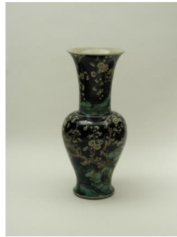
Title: Tall Vase with Black Ground Date: probably 19th century Primary Maker: Chinese, Qing Dynasty (1644–1911) Medium: Famille noire porcelain on wood base with brass fittings Dimensions: 22 1/4 x 10 in. (56.5 x 25.4 cm)