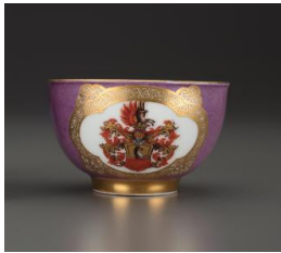
Title: Tea Bowl and Saucer Date: ca. 1740 Primary Maker: Meissen Porcelain Manufactory Medium: Hard-paste porcelain Dimensions: Tea bowl H.: 1 3/4 in. (4.4 cm); Saucer diam.: 5 in. (12.7 cm)