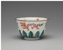
Title: Tea Bowl and Saucer Date: ca. 1715–20 Primary Maker: Meissen Porcelain Manufactory Medium: Hard-paste porcelain Dimensions: Tea bowl H.: 1 3/4 in. (4.4 cm); diam.: 2 7/8 in. (7.3 cm); Saucer diam.: 5 in. (12.7 cm)