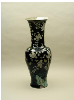
Title: Vase Date: probably 19th century Primary Maker: Chinese, Qing Dynasty (1644-1911) Medium: Famille noire porcelain Dimensions: 27 x 10 1/2 in. (68.6 x 26.7 cm)