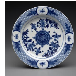
Title: Stand Date: ca. 1740 Primary Maker: Meissen Porcelain Manufactory Medium: Hard-paste porcelain Dimensions: Diam.: 12 5/8 in. (32 cm)