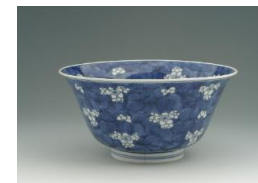
Title: Bowl Date: 1662–1722 Primary Maker: Chinese, Qing Dynasty (1644–1911), Kangxi Period (1662–1722) Medium: Hard-paste porcelain with underglaze blue Dimensions: 3 15/16 x 7 3/4 in. (10 x 19.7 cm)