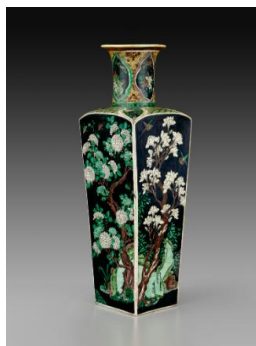
Title: Square Vase with Black Ground Date: probably 19th century Primary Maker: Chinese, Qing Dynasty (1644-1911) Medium: Famille noire porcelain Dimensions: H.: 18 1/2 in. (47 cm)