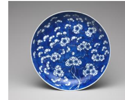
Title: Dish with Plum-Blossom Decoration Date: 18th century Primary Maker: Chinese, Qing Dynasty (1644–1911) Medium: Hard-paste porcelain with underglaze blue Dimensions: 1 1/2 x 9 7/8 in. (3.8 x 25.1 cm)