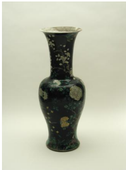
Title: Tall Vase with Black Ground Date: probably 19th century Primary Maker: Chinese, Qing Dynasty (1644–1911) Medium: Famille noire porcelain Dimensions: 27 1/4 x 10 1/2 in. (69.2 x 26.7 cm)