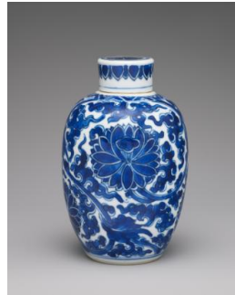
Title: Jar with Cylindrical Lid Date: 1662–1722 Primary Maker: Chinese, Qing Dynasty (1644–1911), Kangxi Period (1662–1722) Medium: Hard-paste porcelain with underglaze blue Dimensions: 4 3/4 x 3 in. (12.1 x 7.6 cm)