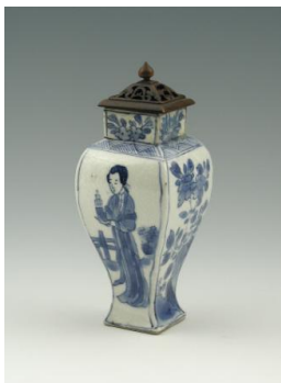
Title: Square Baluster-Form Small Vase Date: 1662–1722 Primary Maker: Chinese, Qing Dynasty (1644–1911), Kangxi Period (1662–1722) Medium: Hard-paste porcelain with underglaze blue Dimensions: 4 1/2 x 1 15/16 x 2 in. (11.5 x 5 x 5.1 cm)