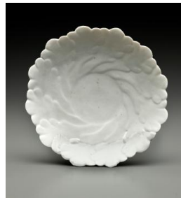
Title: Dish Date: ca. 1729–31 Primary Maker: Meissen Porcelain Manufactory Medium: Hard-paste porcelain Dimensions: Diam.: 8 3/4 in. (22.2 cm)