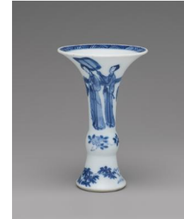
Title: Beaker Vase (One of a Pair) Date: 1662–1722 Primary Maker: Chinese, Qing Dynasty (1644–1911), Kangxi Period (1662–1722) Medium: Hard-paste porcelain with underglaze blue Dimensions: 5 1/4 x 3 5/16 in. (13.3 x 8.4 cm)