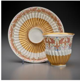
Title: Beaker and Trembleuse Saucer Date: ca. 1717–18 Primary Maker: Meissen Porcelain Manufactory Medium: Hard-paste porcelain Dimensions: Beaker H.: 3 1/8 in. (7.9 cm); Saucer diam.: 5 3/4 in. (14.7 cm)