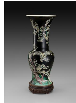
Title: Tall Vase with Black Ground Date: probably 19th century Primary Maker: Chinese, Qing Dynasty (1644–1911) Medium: Famille noire porcelain Dimensions: 16 3/4 x 7 1/8 in. (42.5 x 18.1 cm)