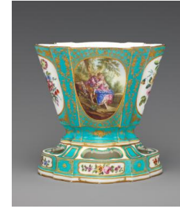
Title: Fan-Shaped Jardinière and Stand with Shepherd Scene, Turquoise Blue Ground Date: ca. 1760 Primary Maker: Sèvres Porcelain Manufactory Medium: Soft-paste porcelain Dimensions: 6 7/8 x 6 7/8 x 4 7/8 in. (17.5 x 17.5 x 12.4 cm)