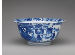
Title: Bowl Date: 1662–1722 Primary Maker: Chinese, Qing Dynasty (1644–1911), Kangxi Period (1662–1722) Medium: Hard-paste porcelain with underglaze blue Dimensions: 3 5/8 x 7 15/16 in. (9.2 x 20.1 cm)