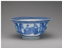
Title: Bowl Date: 1662–1722 Primary Maker: Chinese, Qing Dynasty (1644–1911), Kangxi Period (1662–1722) Medium: Hard-paste porcelain with underglaze blue Dimensions: 3 3/4 x 7 7/8 in. (9.6 x 20 cm)