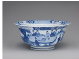
Title: Bowl Date: 1662–1722 Primary Maker: Chinese, Qing Dynasty (1644–1911), Kangxi Period (1662–1722) Medium: Hard-paste porcelain with underglaze blue Dimensions: 3 11/16 x 7 15/16 in. (9.3 x 20.2 cm)