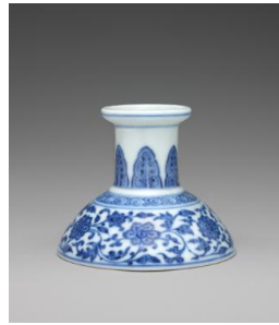
Title: Low Candlestick (One of a Pair) Date: 18th century Primary Maker: Chinese, Qing Dynasty (1644–1911) Medium: Hard-paste porcelain with underglaze blue Dimensions: 2 7/8 x 2 7/8 in. (7.3 x 7.3 cm)