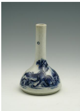
Title: Bottle-Shaped Vase Date: 1662–1722 Primary Maker: Chinese, Qing Dynasty (1644–1911), Kangxi Period (1662–1722) Medium: Hard-paste porcelain with underglaze blue Dimensions: H.: 3 15/16 in. (10 cm)