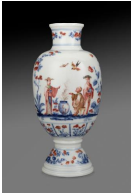
Title: Vase Date: ca. 1723 Primary Maker: Meissen Porcelain Manufactory Medium: Hard-paste porcelain Dimensions: H.: 9 1/2 in. (24.1 cm)