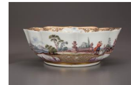
Title: Quatrefoil-Shaped Bowl Date: probably 1740 Primary Maker: Meissen Porcelain Manufactory Medium: Hard-paste porcelain Dimensions: Diam.: 9 1/8 in. (23.8 cm)