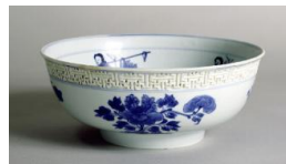
Title: Bowl Date: 1662–1722 Primary Maker: Chinese, Qing Dynasty (1644–1911), Kangxi Period (1662–1722) Medium: Hard-paste porcelain with underglaze blue Dimensions: 3 x 7 1/2 in. (7.6 x 19.1 cm)