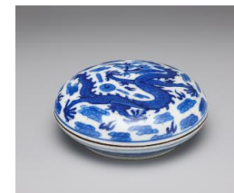
Title: Seal Box with Cover Date: 19th century Primary Maker: Chinese, Qing Dynasty (1644–1911) Medium: Hard-paste porcelain with underglaze blue Dimensions: 1 1/4 x 3 1/4 in. (3.1 x 8.2 cm)