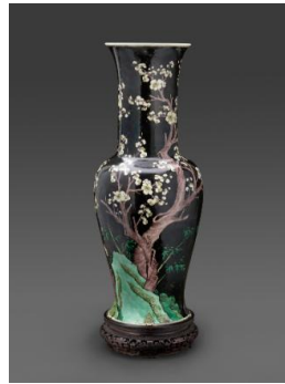
Title: Tall Vase with Black Ground Date: probably 19th century Primary Maker: Chinese, Qing Dynasty (1644–1911) Medium: Famille noire porcelain Dimensions: 24 1/4 x 9 5/8 in. (61.6 x 24.4 cm)