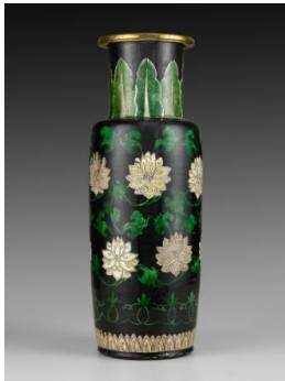
Title: Cylindrical Vase Date: probably 19th century Primary Maker: Chinese, Qing Dynasty (1644–1911) Medium: Famille noire porcelain Dimensions: 22 x 8 in. (55.9 x 20.3 cm)