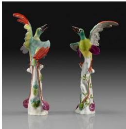
Title: Two Birds of Paradise Date: ca. 1733 Primary Maker: Meissen Porcelain Manufactory Medium: Hard-paste porcelain Dimensions: H. (each): 9 1/4 in. (23.5 cm)