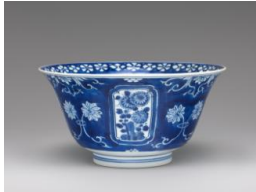
Title: Bowl Date: 1662–1722 Primary Maker: Chinese, Qing Dynasty (1644–1911), Kangxi Period (1662–1722) Medium: Hard-paste porcelain with underglaze blue Dimensions: 3 7/8 x 7 11/16 in. (9.9 x 19.6 cm)