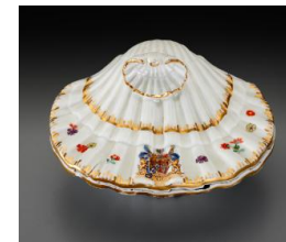
Title: Spice-Box from the "Swan" Service

Date: ca. 1723–24 Primary Maker: Meissen Porcelain Manufactory Medium: Hard-paste porcelain Dimensions: Saucer diam.: 5 1/16 in. (12.8 cm)