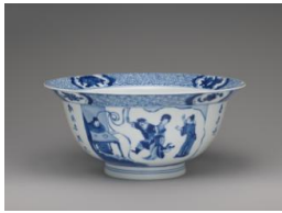
Title: Bowl Date: 1662–1722 Primary Maker: Chinese, Qing Dynasty (1644–1911), Kangxi Period (1662–1722) Medium: Hard-paste porcelain with underglaze blue Dimensions: 3 13/16 x 8 1/4 in. (9.7 x 20.9 cm)