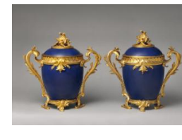
Title: Pair of Mounted Covered Jars Date: 1745-49 Primary Maker: Chinese, Qing Dynasty (1644-1911) Medium: Hard-paste porcelain and gilt bronze Dimensions: 18 7/16 x 18 5/8 x 10 5/8 in. (46.8 x 47.3 x 27 cm)