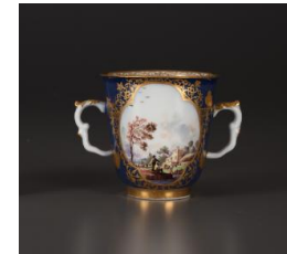
Title: Two-Handled Beaker and Saucer Date: ca. 1730–35 Primary Maker: Meissen Porcelain Manufactory Medium: Hard-paste porcelain Dimensions: Beaker H.: 2 7/8 in. (7.3 cm); Saucer diam.: 5 in. (12.7 cm)