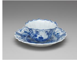
Title: Saucer (One Pair in a Set of Four) Date: 17th century Primary Maker: Chinese, Transitional Period (1620–1683) Medium: Hard-paste porcelain with underglaze blue Dimensions: 11/16 x 4 5/16 in. (1.8 x 11 cm)