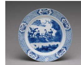
Title: Plate (One of a Set of Four) Date: 1662–1722 Primary Maker: Chinese, Qing Dynasty (1644–1911), Kangxi Period (1662–1722) Medium: Hard-paste porcelain with underglaze blue Dimensions: 1 7/16 x 10 1/4 in. (3.7 x 26.1 cm)