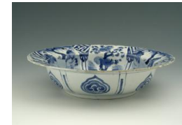
Title: Deep Plate (One of a Pair) Date: 1662–1722 Primary Maker: Chinese, Qing Dynasty (1644–1911), Kangxi Period (1662–1722) Medium: Hard-paste porcelain with underglaze blue Dimensions: 2 9/16 x 10 1/2 in. (6.5 x 26.7 cm)