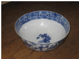
Title: Bowl Date: 1662–1722 Primary Maker: Chinese, Qing Dynasty (1644–1911), Kangxi Period (1662–1722) Medium: Hard-paste porcelain with underglaze blue Dimensions: 4 1/2 x 9 1/8 in. (11.4 x 23.1 cm)