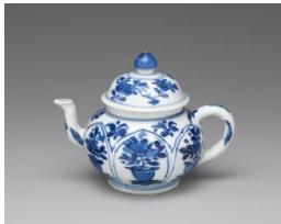
Title: Teapot (One of a Pair) Date: 17th century Primary Maker: Chinese, Transitional Period (1620–1683) Medium: Hard-paste porcelain with underglaze blue Dimensions: 3 1/8 x 2 3/4 in. (7.9 x 7 cm)