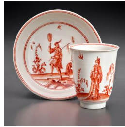
Title: Beaker and Saucer Date: ca. 1723 Primary Maker: Meissen Porcelain Manufactory Medium: Hard-paste porcelain Dimensions: Beaker H.: 3 1/8 in. (7.9 cm); Saucer diam.: 5 in. (12.7 cm)