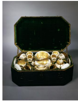
Title: Tea, Coffee and Chocolate Service Date: ca. 1720-25 Primary Maker: Meissen Porcelain Manufactory Medium: Hard-paste porcelain, leather, velvet Dimensions: Teapot H.: 5 in. (12.7 cm) Waste bowl H.: 3 in. (7.6 cm); diam.: 6 7/8 in. (17.5 cm) Tea Caddy H.: 4 3/8 in. (11.1 cm) Sugar Box H.: 3 in. (7.6 cm) Two-Handled Beaker H. (each): 3 in. (7.6 cm) Tea Bowls max. H.: 1 3/4 in. (4.4 cm) Saucers max. diam.: 5 1/8 in. (13 cm) Coffeepot H.: 8 in. (20.3 cm)