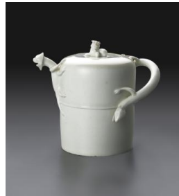
Title: Teapot Date: ca. 1713 Primary Maker: Meissen Porcelain Manufactory Medium: Hard-paste porcelain Dimensions: H.: 5 5/8 in. (14.3 cm)