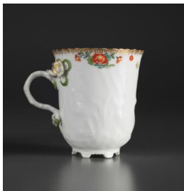
Title: Cup and Saucer from the "Swan" Service

Date: ca. 1723–24 Primary Maker: Meissen Porcelain Manufactory Medium: Hard-paste porcelain Dimensions: Tea Bowl H.: 2 in. (5.1 cm) Saucer diam.: 5 1/16 in. (12.9 cm)