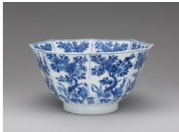
Title: Octagonal Form Bowl Date: ca. 1650 Primary Maker: Chinese, Transitional Period (1620–1683) Medium: Hard-paste porcelain with underglaze blue Dimensions: 4 1/4 x 7 7/8 x 7 3/4 in. (10.8 x 20 x 19.7 cm)