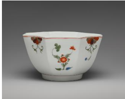
Title: Bowl Date: ca. 1730–35 Primary Maker: Meissen Porcelain Manufactory Medium: Hard-paste porcelain Dimensions: H.: 4 in. (10.2 cm); diam.: 7 3/4 in. (19.7 cm)