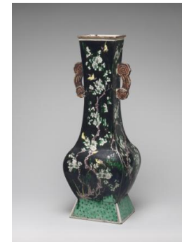
Title: Quadrilateral Vase Date: probably 19th century Primary Maker: Chinese, Qing Dynasty (1644–1911) Medium: Famille noire porcelain on wood base with brass fittings Dimensions: H.: 22 in. (55.9 cm)