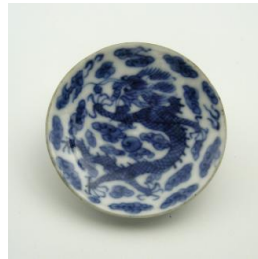
Title: Snuff Saucer Date: 1723–35 Medium: Hard-paste porcelain with underglaze blue Dimensions: 1/4 x 1 5/8 in. (0.7 x 4.1 cm)