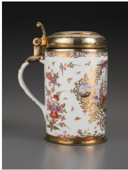
Title: Tankard with Silver-Gilt Cover and Mounts Date: ca. 1725–30 Primary Maker: Meissen Porcelain Manufactory Medium: Hard-paste porcelain with silver-gilt mounts Dimensions: H.: 7 1/4 in. (18.5 cm)