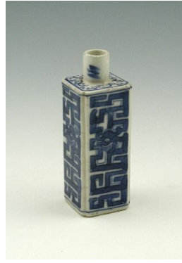
Title: Snuff Bottle Date: 18th century Primary Maker: Chinese, Qing Dynasty (1644–1911) Medium: Hard-paste porcelain with underglaze blue Dimensions: 2 5/8 x 1 x 1 in. (6.7 x 2.6 x 2.6 cm)