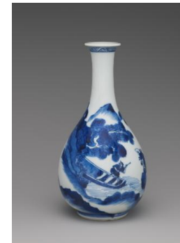
Title: Bottle-Shaped Vase Date: 1662–1722 Primary Maker: Chinese, Qing Dynasty (1644–1911), Kangxi Period (1662–1722) Medium: Hard-paste porcelain with underglaze blue Dimensions: 7 1/2 x 3 3/4 in. (19.1 x 9.5 cm)