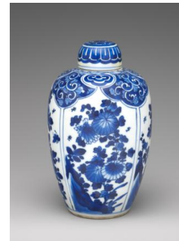
Title: Covered Jar (One of a Pair) Date: 1662–1722 Primary Maker: Chinese, Qing Dynasty (1644–1911), Kangxi Period (1662–1722) Medium: Hard-paste porcelain with underglaze blue Dimensions: 6 9/16 x 3 15/16 in. (16.7 x 10 cm)