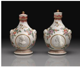
Title: Flasks with Relief Portraits of Emperor Charles VI and Empress Elizabeth Christine

Date: 1725–30 Primary Maker: Du Paquier Porcelain Manufactory Medium: Hard-paste porcelain Dimensions: 2016.9.14.1: 7 7/8 × 5 in. (20 × 12.7 cm); diam.: 4 1/2 in. (11.4 cm) 2016.9.14.2: 8 1/8 × 5 1/4 in. (20.6 × 13.3 cm); diam.: 4 1/2 in. (11.4 cm)