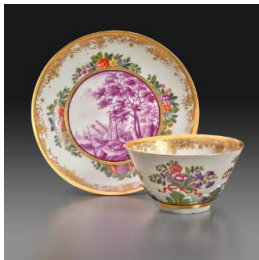
Title: Bowl and Saucer Date: ca. 1720 Primary Maker: Meissen Porcelain Manufactory Medium: Hard-paste porcelain Dimensions: Tea bowl H.: 1 3/4 in. (4.4 cm); Saucer diam.: 5 1/8 in. (13.0 cm)