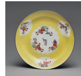
Title: Two Plates from the "Yellow Hunting" Service Date: ca. 1733–34 Primary Maker: Meissen Porcelain Manufactory Medium: Hard-paste porcelain Dimensions: 2016.15.171.1 diam.: 8 15/16 in. (22.7 cm) 2016.15.171.2 diam.: 9 in. (22.9 cm)