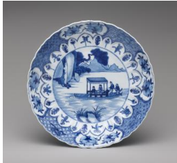
Title: Dish with Foliate Rim Date: 1662–1722 Primary Maker: Chinese, Qing Dynasty (1644–1911), Kangxi Period (1662–1722) Medium: Hard-paste porcelain with underglaze blue Dimensions: 2 1/8 x 10 3/8 in. (5.4 x 26.4 cm)