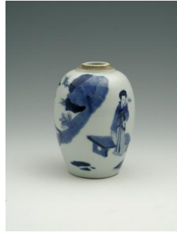
Title: Jar (One of a Pair) Date: 1662–1722 Primary Maker: Chinese, Qing Dynasty (1644–1911), Kangxi Period (1662–1722) Medium: Hard-paste porcelain with underglaze blue Dimensions: 4 x 2 15/16 in. (10.2 x 7.4 cm)