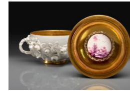
Title: Small Two-Handled Bowl with Cover Date: 1735 or 1738 Primary Maker: Meissen Porcelain Manufactory Medium: Hard-paste porcelain Dimensions: H., 3 3/4 in. (9.5 cm)