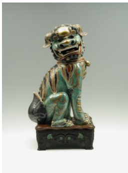
Title: Pair of Lions Date: 18th century Primary Maker: Chinese, Qing Dynasty (1644-1911) Medium: Famille verte porcelain Dimensions: H.: 19 in. (48.3 cm)