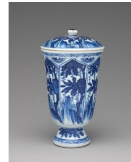
Title: Beaker and Cover (One of a Pair) Date: 17th century Primary Maker: Chinese, Transitional Period (1620–1683) Medium: Hard-paste porcelain with underglaze blue Dimensions: 5 15/16 x 3 5/16 in. (15.1 x 8.4 cm)