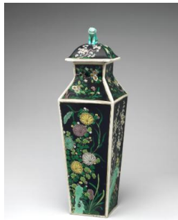
Title: Pair of Square Vases with Covers Date: probably 19th century Primary Maker: Chinese, Qing Dynasty (1644–1911) Medium: Famille noire porcelain Dimensions: H.: 19 1/4 in. (48.9 cm)