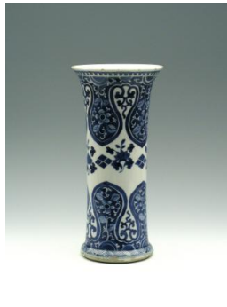
Title: Beaker Vase (One of a Pair) Date: 1662–1722 Primary Maker: Chinese, Qing Dynasty (1644–1911), Kangxi Period (1662–1722) Medium: Hard-paste porcelain with underglaze blue Dimensions: 9 1/4 x 4 3/8 in. (23.5 x 11.1 cm)