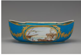
Title: Basin Date: 1781 Primary Maker: Sèvres Porcelain Manufactory Medium: Soft-paste porcelain with gilt metal Dimensions: 11 7/16 x 9 7/8 x 3 1/8 in. (29.1 x 25.1 x 7.9 cm)