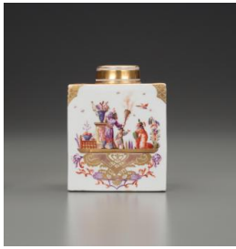
Title: Tea Caddy Date: 1730–35 Primary Maker: Meissen Porcelain Manufactory Medium: Hard-paste porcelain Dimensions: H.: 4 1/4 in. (10.8 cm)