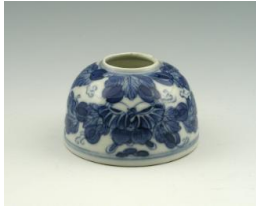
Title: Waterpot Date: 1662–1722 Primary Maker: Chinese, Qing Dynasty (1644–1911), Kangxi Period (1662–1722) Medium: Hard-paste porcelain with underglaze blue Dimensions: 1 5/16 x 2 3/16 in. (3.4 x 5.5 cm)