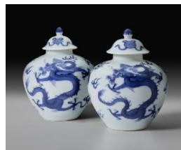
Title: Dragon Jar with Cover (One of a Pair) Date: 1662–1722 Primary Maker: Chinese, Qing Dynasty (1644–1911), Kangxi Period (1662–1722) Medium: Hard-paste porcelain with underglaze blue Dimensions: 3 3/8 x 3 9/16 in. (8.5 x 9 cm)