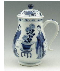
Title: Covered Mug with Handle (One of a Pair) Date: 1662–1722 Primary Maker: Chinese, Qing Dynasty (1644–1911), Kangxi Period (1662–1722) Medium: Hard-paste porcelain with underglaze blue Dimensions: 5 1/4 x 3 5/8 in. (13.3 x 9.2 cm)