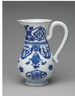
Title: Water Jug Date: 1662–1722 Primary Maker: Chinese, Qing Dynasty (1644–1911), Kangxi Period (1662–1722) Medium: Hard-paste porcelain with underglaze blue Dimensions: 7 1/8 x 4 5/16 in. (18.1 x 10.9 cm)