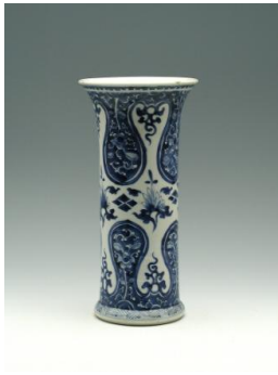
Title: Beaker Vase (One of a Pair) Date: 1662–1722 Primary Maker: Chinese, Qing Dynasty (1644–1911), Kangxi Period (1662–1722) Medium: Hard-paste porcelain with underglaze blue Dimensions: 9 5/16 x 11 13/16 in. (23.6 x 30 cm)