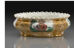
Title: Brush Handle from the Toilette Service Sent to the Queen of Naples Date: ca. 1745–47 Primary Maker: Meissen Porcelain Manufactory Medium: Hard-paste porcelain Dimensions: 1 3/4 × 4 1/8 × 5 1/4 in. (4.4 × 10.5 × 13.3 cm)