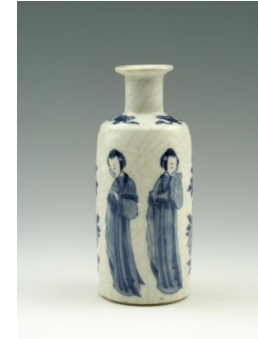
Title: Baluster Vase with Ladies Date: 1662–1722 Primary Maker: Chinese, Qing Dynasty (1644–1911), Kangxi Period (1662–1722) Medium: Hard-paste porcelain with underglaze blue Dimensions: 4 7/16 x 1 7/8 in. (11.3 x 4.8 cm)