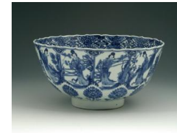
Title: Bowl Date: 1662–1722 Primary Maker: Chinese, Qing Dynasty (1644–1911), Kangxi Period (1662–1722) Medium: Hard-paste porcelain with underglaze blue Dimensions: 4 15/16 x 9 5/16 in. (12.5 x 23.7 cm)