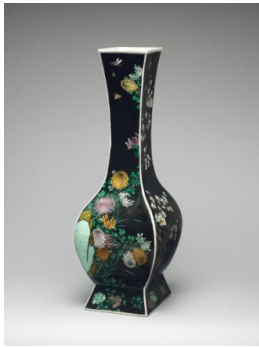
Title: Quadrilateral Vase Date: probably 19th century Primary Maker: Chinese, Qing Dynasty (1644–1911) Medium: Famille noire porcelain on carved wooden base with brass fittings Dimensions: H.: 20 3/4 in. (52.7 cm)