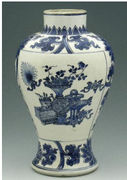
Title: Vase of Inverted Baluster Shape Date: 1662–1722 Primary Maker: Chinese, Qing Dynasty (1644–1911), Kangxi Period (1662–1722) Medium: Hard-paste porcelain with underglaze blue Dimensions: 8 x 5 in. (20.3 x 12.7 cm)