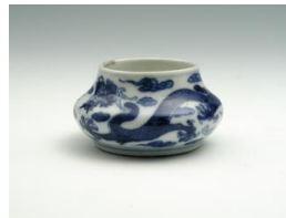
Title: Water Receptacle Date: 1522–66 Primary Maker: Chinese, Ming Dynasty (1368–1644), Jiajing Period (1522–1566) Medium: Hard-paste porcelain with underglaze blue Dimensions: 1 3/16 x 2 3/16 in. (3 x 5.6 cm)