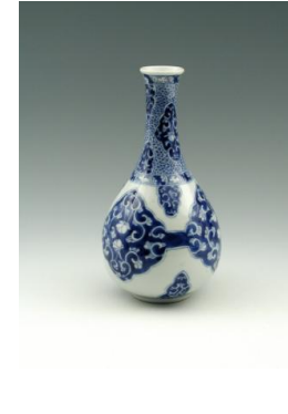
Title: Bottle-Shaped Vase Date: 1662–1722 Primary Maker: Chinese, Qing Dynasty (1644–1911), Kangxi Period (1662–1722) Medium: Hard-paste porcelain with underglaze blue Dimensions: 7 5/16 x 3 11/16 in. (18.5 x 9.3 cm)