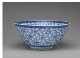
Title: Bowl with Everted Lip Date: 1662–1722 Primary Maker: Chinese, Qing Dynasty (1644–1911), Kangxi Period (1662–1722) Medium: Hard-paste porcelain with underglaze blue Dimensions: 3 3/4 x 8 1/2 in. (9.5 x 21.6 cm)