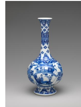
Title: Bottle-Shaped Vase with High Flaring Foot Date: 1662–1722 Primary Maker: Chinese, Qing Dynasty (1644–1911), Kangxi Period (1662–1722) Medium: Hard-paste porcelain with underglaze blue Dimensions: 9 3/4 x 4 1/2 in. (24.8 x 11.4 cm)