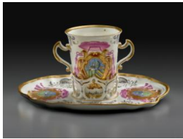
Title: Two Trembleuse Cups and a Slop Bowl with the Arms of Cardinal Fabio degli Abbati Olivieri

Date: ca. 1735 Primary Maker: Du Paquier Porcelain Manufactory Medium: Hard-paste porcelain Dimensions: Saucers: 1 5/8 × 7 7/8 × 6 in. (4.1 × 20 × 15.2 cm) (each) Beakers (with handles): 3 3/8 × 4 1 /8 in. (8.6 × 10.5 cm) (each) Bowl: H.: 3 3/8 in. (8.6 cm); diam.: 8 3/4 in. (22.2 cm)