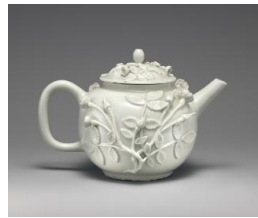
Title: Teapot Date: ca. 1713 Primary Maker: Meissen Porcelain Manufactory Medium: Hard-paste porcelain Dimensions: H.: 4 3/8 in. (11 cm)