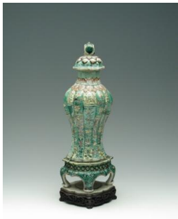
Title: Jar (One of a Five Piece Set with Famille Verte Decoration) Date: probably 18th century Primary Maker: Chinese, Qing Dynasty (1644–1911) Medium: Famille verte porcelain Dimensions: H.: 10 1/8 in. (25.7 cm)