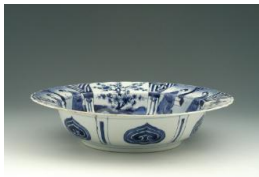
Title: Deep Plate (One of a Pair) Date: 1662–1722 Primary Maker: Chinese, Qing Dynasty (1644–1911), Kangxi Period (1662–1722) Medium: Hard-paste porcelain with underglaze blue Dimensions: 2 1/2 x 10 5/8 in. (6.4 x 27 cm)