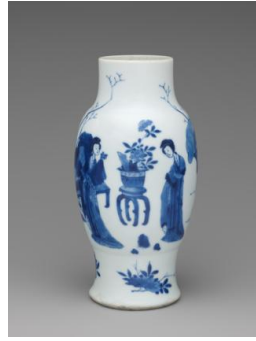
Title: Vase (One of a Pair) Date: 1662–1722 Primary Maker: Chinese, Qing Dynasty (1644–1911), Kangxi Period (1662–1722) Medium: Hard-paste porcelain with underglaze blue Dimensions: 8 1/4 x 4 1/8 in. (20.9 x 10.4 cm)