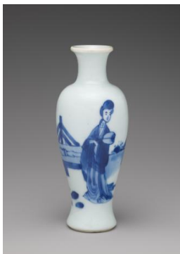
Title: Baluster Vase (One of a Pair) Date: 1662–1722 Primary Maker: Chinese, Qing Dynasty (1644–1911), Kangxi Period (1662–1722) Medium: Hard-paste porcelain with underglaze blue Dimensions: 5 3/8 x 2 1/16 in. (13.6 x 5.2 cm)