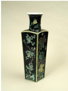
Title: Two Square Vases Date: probably 19th century Primary Maker: Chinese, Qing Dynasty (1644–1911) Medium: Famille noire porcelain Dimensions: H.: 19 1/4 in. (48.9 cm)