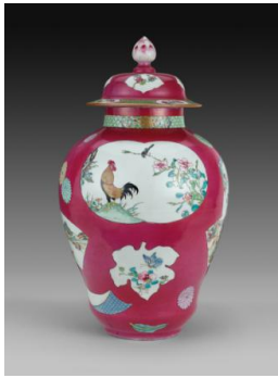
Title: Covered Jar with Famille Rose Decoration Date: 18th century Primary Maker: Chinese, Qing Dynasty (1644-1911) Medium: Hard-paste porcelain with polychrome overglaze Dimensions: 17 3/4 x 10 in. (45.1 x 25.4 cm)