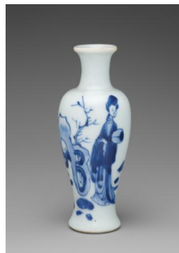
Title: Baluster Vase (One of a Pair) Date: 1662–1722 Primary Maker: Chinese, Qing Dynasty (1644–1911), Kangxi Period (1662–1722) Medium: Hard-paste porcelain with underglaze blue Dimensions: 5 3/16 x 2 in. (13.1 x 5.1 cm)