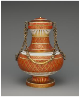
Title: Vase Japon Date: 1774 Primary Maker: Sèvres Porcelain Manufactory Medium: Hard-paste porcelain with gilt-silver mounts Dimensions: H.: 10 1/2 in. (26.7 cm), diam.: 8 in. (20.3 cm)