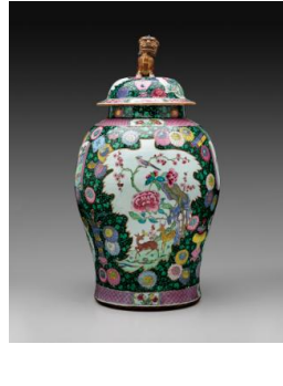
Title: Two Covered Jars with Famille Rose Decoration Date: 18th century Primary Maker: Chinese, Qing Dynasty (1644-1911) Medium: Hard-paste porcelain with polychrome overglaze Dimensions: 33 x 18 3/4 in. (83.8 x 47.6 cm)