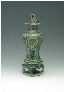
Title: Jar (One of a Five Piece Set with Famille Verte Decoration) Date: 1644-1911 Primary Maker: Chinese, Qing Dynasty (1644-1911) Medium: Famille verte porcelain Dimensions: H.: 10 1/8 in. (25.7 cm)