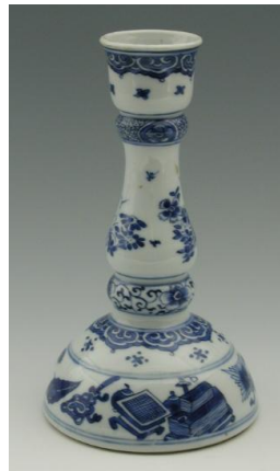
Title: Candlestick (One of a Pair) Date: 1662–1722 Primary Maker: Chinese, Qing Dynasty (1644–1911), Kangxi Period (1662–1722) Medium: Hard-paste porcelain with underglaze blue Dimensions: 7 x 4 in. (17.8 x 10.2 cm)