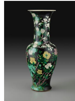
Title: Vase Date: probably 19th century Primary Maker: Chinese, Qing Dynasty (1644–1911) Medium: Hard-paste porcelain with polychrome overglaze Dimensions: H.: 27 in. (68.6 cm), diam.: 11 in. (27.9 cm)