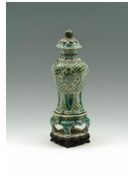
Title: Jar (One of a Five Piece Set with Famille Verte Decoration) Date: 1644-1911 Primary Maker: Chinese, Qing Dynasty (1644-1911) Medium: Famille verte porcelain Dimensions: H.: 10 1/8 in. (25.7 cm)