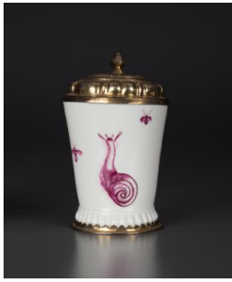
Title: Beaker with Silver Gilt Cover and Mounts Date: ca. 1725–35 Primary Maker: Meissen Porcelain Manufactory Medium: Hard-paste porcelain with silver-gilt mounts Dimensions: H.: 4 1/4 in. (10.8 cm)