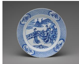
Title: Plate (One of a Set of Four) Date: 1662–1722 Primary Maker: Chinese, Qing Dynasty (1644–1911) Medium: Hard-paste porcelain with underglaze blue Dimensions: 1 5/8 x 10 1/4 in. (4.1 x 26.1 cm)