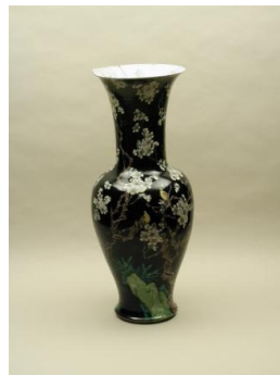
Title: Vase Date: probably 19th century Primary Maker: Chinese, Qing Dynasty (1644–1911) Medium: Famille noire porcelain Dimensions: 26 1/4 x 10 3/4 in. (66.7 x 27.3 cm)