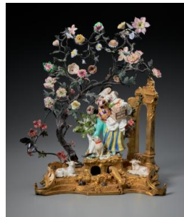
Title: Mounted Group: "La Cage" Date: ca. 1740–45 Primary Maker: Meissen Porcelain Manufactory Medium: Hard-paste porcelain with gilt-bronze mounts Dimensions: H.: 15 3/4 in. (40 cm)