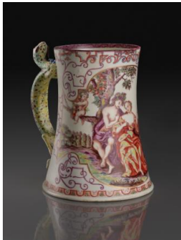
Title: Tankard Date: 1725–30 Primary Maker: Du Paquier Porcelain Manufactory Medium: Hard-paste porcelain Dimensions: 5 7/8 × 6 7/8 in. (14.9 × 17.5 cm); diam.: 5 1/8 in. (13 cm)