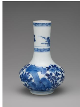
Title: Bottle-Shaped Vase (One of a Pair) Date: 1662–1722 Primary Maker: Chinese, Qing Dynasty (1644–1911), Kangxi Period (1662–1722) Medium: Hard-paste porcelain with underglaze blue Dimensions: 5 x 3 3/16 in. (12.7 x 8.1 cm)