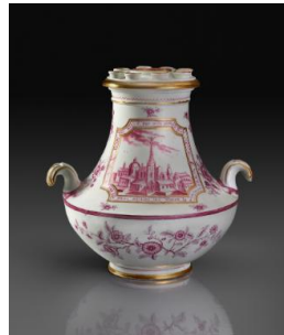
Title: Tulip Vase Date: 1725 Primary Maker: Du Paquier Porcelain Manufactory Medium: Hard-paste porcelain Dimensions: 8 3/8 × 8 1/2 in. (21.3 × 21.6 cm)