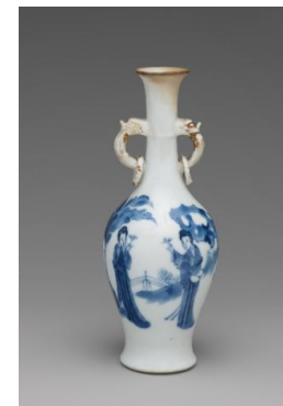
Title: Bottle-Shaped Vase with Handles (One of a Pair) Date: 1662–1722 Primary Maker: Chinese, Qing Dynasty (1644–1911), Kangxi Period (1662–1722) Medium: Hard-paste porcelain with underglaze blue Dimensions: H.: 7 in. (17.8 cm)