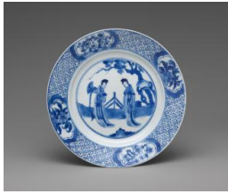
Title: Plate (One of an Eight-Piece Set) Date: 1662–1722 Primary Maker: Chinese, Qing Dynasty (1644–1911), Kangxi Period (1662–1722) Medium: Hard-paste porcelain with underglaze blue Dimensions: 1 7/16 x 8 1/4 in. (3.6 x 21 cm)