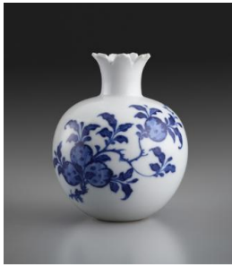
Title: Small Vase Date: 18th century Primary Maker: Chinese, Qing Dynasty (1644–1911) Medium: Porcelain with underglaze blue Dimensions: H.: 4 1/8 in. (10.5 cm), diam.: 3 3/8 in. (8.6 cm)