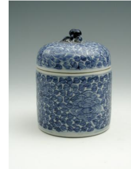
Title: Wine Cup Warmer (One of a Four-Piece Set) Date: late 17th–early 18th century Primary Maker: Chinese, Qing Dynasty (1644–1911) Medium: Hard-paste porcelain with underglaze blue Dimensions: 3 7/8 x 2 15/16 in. (9.8 x 7.5 cm)