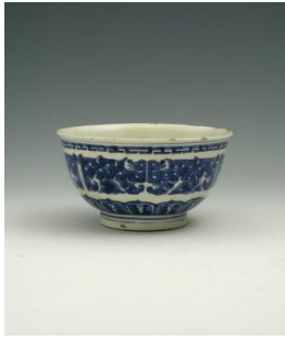
Title: Bowl Date: 1662–1722 Primary Maker: Chinese, Qing Dynasty (1644–1911), Kangxi Period (1662–1722) Medium: Hard-paste porcelain with underglaze blue Dimensions: 2 1/2 x 3 3/4 in. (6.4 x 9.6 cm)