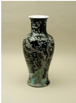
Title: Tall Vase with Black Ground Date: probably 19th century Primary Maker: Chinese, Qing Dynasty (1644–1911) Medium: Famille noire porcelain Dimensions: 17 1/2 x 8 1/8 in. (44.5 x 20.6 cm)