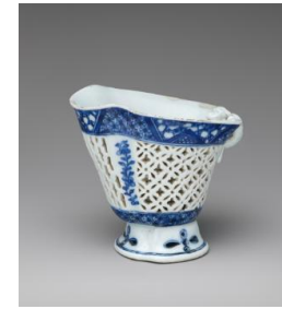
Title: Reticulated Cream Pot or Libation Cup (One of a Pair) Date: 17th century Primary Maker: Chinese, Transitional Period (1620–1683) Medium: Hard-paste porcelain with underglaze blue Dimensions: 3 15/16 x 11 1/2 in. (10 x 29.2 cm)