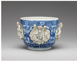
Title: Molded Biscuit Deep Bowl, "Eight Immortals" Date: 1573–1620 Primary Maker: Chinese, Ming Dynasty (1368–1644), Wanli Period (1573–1620) Medium: Hard-paste porcelain with underglaze blue Dimensions: 3 3/4 x 5 11/16 x 4 5/8 in. (9.5 x 14.5 x 11.7 cm)