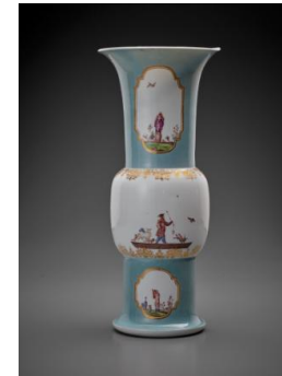
Title: Vase Date: ca. 1725-30 Primary Maker: Meissen Porcelain Manufactory Medium: Hard-paste porcelain Dimensions: H.: 15 in. (38.1 cm)