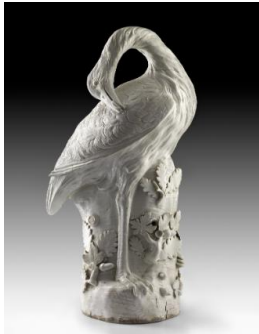
Title: Great Bustard

Date: ca. 1720–25 Primary Maker: Du Paquier Porcelain Manufactory Medium: Hard-paste porcelain Dimensions: H.: 1 1/4 in. (3.2 cm); diam.: 5 in. (12.7 cm)