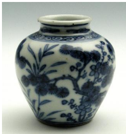
Title: Jar (One of a Pair) Date: 1723–35 Medium: Hard-paste porcelain with underglaze blue Dimensions: 2 1/8 x 1/4 in. (5.4 x 0.6 cm)