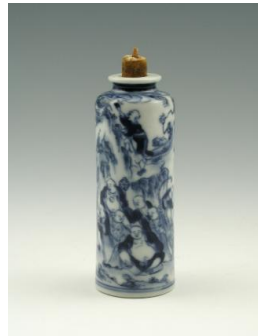
Title: Snuff Bottle Date: 18th century Primary Maker: Chinese, Qing Dynasty (1644–1911) Medium: Hard-paste porcelain with underglaze blue Dimensions: 3 1/4 x 1 1/8 in. (8.2 x 2.9 cm)