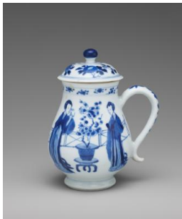
Title: Covered Mug with Handle (One of a Pair) Date: 1662–1722 Primary Maker: Chinese, Qing Dynasty (1644–1911), Kangxi Period (1662–1722) Medium: Hard-paste porcelain with underglaze blue Dimensions: 5 1/4 x 3 5/8 in. (13.3 x 9.2 cm)