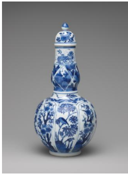
Title: Bottle-Shaped Vase (One of a Pair) Date: 17th century Primary Maker: Chinese, Transitional Period (1620–1683) Medium: Hard-paste porcelain with underglaze blue Dimensions: 9 13/16 x 4 3/4 in. (25 x 12 cm)