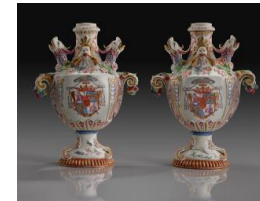
Title: Two Pot-pourri Vases with the Arms of Archbishop Imre Esterházy of Galántha Date: 1735 Primary Maker: Du Paquier Porcelain Manufactory Medium: Hard-paste porcelain Dimensions: Each: 9 5/8 × 7 1/8 × 3 7/8 in. (24.4 × 18.1 × 9.8 cm)