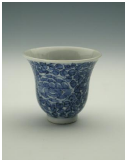
Title: Wine Cup (One of a Four-Piece Set) Date: 18th century Primary Maker: Chinese, Qing Dynasty (1644–1911) Medium: Hard-paste porcelain with underglaze blue Dimensions: 2 x 2 1/4 in. (5.1 x 5.7 cm)