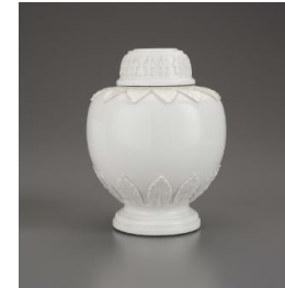
Title: Tea Caddy Date: ca. 1715 Primary Maker: Meissen Porcelain Manufactory Medium: Hard-paste porcelain Dimensions: H.: 6 1/16 in. (15.4 cm)