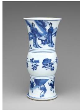
Title: Beaker Vase (One of a Pair) Date: 1662–1722 Primary Maker: Chinese, Qing Dynasty (1644–1911), Kangxi Period (1662–1722) Medium: Hard-paste porcelain with underglaze blue Dimensions: 10 3/16 x 4 13/16 in. (25.9 x 12.2 cm)