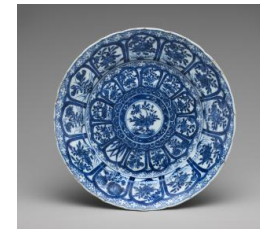
Title: Shallow Plate (One of a Pair) Date: 1662–1722 Primary Maker: Chinese, Qing Dynasty (1644–1911), Kangxi Period (1662–1722) Medium: Hard-paste porcelain with underglaze blue Dimensions: 1 3/8 x 8 9/16 in. (3.5 x 21.8 cm)