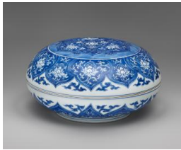
Title: Round Box with Dome Lid Date: 1662–1722 Primary Maker: Chinese, Qing Dynasty (1644–1911), Kangxi Period (1662–1722) Medium: Hard-paste porcelain with underglaze blue Dimensions: 4 1/4 x 8 7/16 in. (10.8 x 21.4 cm)