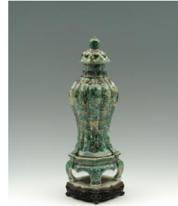
Title: Jar (One of Five Piece Set with Famille Verte Decoration) Date: probably 18th century Primary Maker: Chinese, Qing Dynasty (1644–1911) Medium: Famille verte porcelain Dimensions: H.: 10 1/8 in. (25.7 cm)