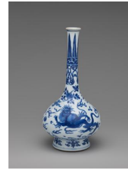
Title: Bottle-Shaped Vase Painted with Dragons (One of a Pair) Date: 1662–1722 Primary Maker: Chinese, Qing Dynasty (1644–1911), Kangxi Period (1662–1722) Medium: Hard-paste porcelain with underglaze blue Dimensions: 9 7/8 x 4 3/4 in. (25.1 x 12 cm)