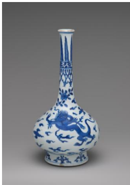
Title: Bottle-Shaped Vase Painted with Dragons (One of a Pair) Date: 1662–1722 Primary Maker: Chinese, Qing Dynasty (1644–1911), Kangxi Period (1662–1722) Medium: Hard-paste porcelain with underglaze blue Dimensions: 9 1/2 x 4 3/4 in. (24.2 x 12.1 cm)