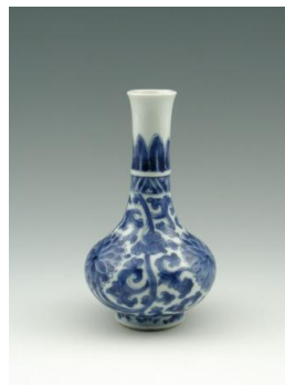
Title: Bottle-Shaped Vase Date: 1662–1722 Primary Maker: Chinese, Qing Dynasty (1644–1911), Kangxi Period (1662–1722) Medium: Hard-paste porcelain with underglaze blue Dimensions: 5 3/16 x 2 15/16 in. (13.2 x 7.5 cm)