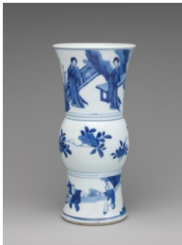
Title: Beaker Vase (One of a Pair) Date: 1662–1722 Primary Maker: Chinese, Qing Dynasty (1644–1911), Kangxi Period (1662–1722) Medium: Hard-paste porcelain with underglaze blue Dimensions: 10 3/16 x 4 13/16 in. (25.9 x 12.2 cm)