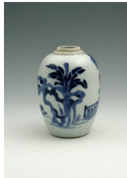
Title: Small Jar (One of a Pair) Date: 1662–1722 Primary Maker: Chinese, Qing Dynasty (1644–1911), Kangxi Period (1662–1722) Medium: Hard-paste porcelain with underglaze blue Dimensions: 5 x 2 13/16 in. (12.7 x 7.1 cm)