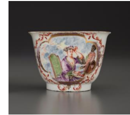
Title: Tea Bowl and Saucer

Date: ca. 1713–15 Primary Maker: Meissen Porcelain Manufactory Medium: Hard-paste porcelain Dimensions: H.: 6 in. (15.2 cm)