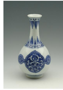
Title: Bottle-Shaped Vase Date: 1662–1722 Primary Maker: Chinese, Qing Dynasty (1644–1911), Kangxi Period (1662–1722) Medium: Hard-paste porcelain with underglaze blue Dimensions: 7 3/8 x 4 in. (18.7 x 10.1 cm)