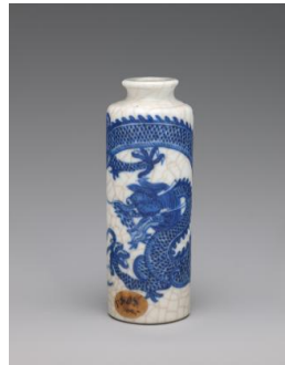
Title: Vase Date: 18th century Primary Maker: Chinese, Qing Dynasty (1644–1911) Medium: Hard-paste porcelain with underglaze blue Dimensions: 3 1/16 x 1 1/8 in. (7.7 x 2.8 cm)