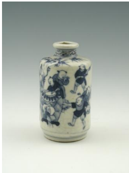
Title: Snuff Bottle Date: 1736–96 Primary Maker: Chinese, Qing Dynasty (1644–1911), Qianlong Period (1736–1796) Medium: Hard-paste porcelain with underglaze blue Dimensions: 2 5/8 x 1 3/8 in. (6.7 x 3.5 cm)