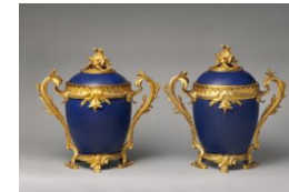
Title: Pair of Mounted Covered Jars Date: 1745–49 Primary Maker: Chinese, Qing Dynasty (1644–1911) Medium: Hard-paste porcelain and gilt bronze Dimensions: 17 7/8 x 18 5/8 x 10 11/16 in. (45.4 x 47.3 x 27.1 cm)