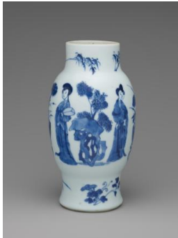
Title: Vase (One of a Pair) Date: 1662–1722 Primary Maker: Chinese, Qing Dynasty (1644–1911), Kangxi Period (1662–1722) Medium: Hard-paste porcelain with underglaze blue Dimensions: 8 1/8 x 4 5/16 in. (20.6 x 10.9 cm)