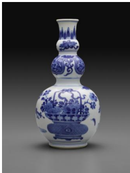
Title: Triple Gourd Vase (One of a Pair) Date: 1662–1722 Primary Maker: Chinese, Qing Dynasty (1644–1911), Kangxi Period (1662–1722) Medium: Hard-paste porcelain with underglaze blue Dimensions: 9 15/16 x 5 1/4 in. (25.3 x 13.3 cm)