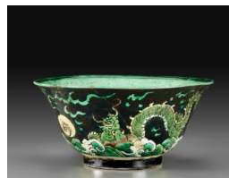
Title: Bowl with Flaring Rim and Black Ground Date: probably 18th century Primary Maker: Chinese, Qing Dynasty (1644-1911) Medium: Famille noire porcelain Dimensions: 3 1/2 x 7 1/2 in. (8.9 x 19.1 cm)