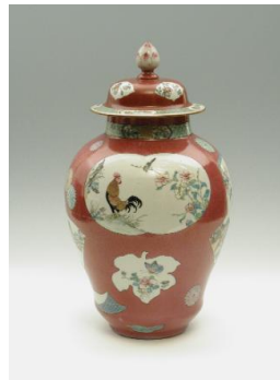
Title: Covered Jar with Famille Rose Decoration Date: 18th century Primary Maker: Chinese, Qing Dynasty (1644-1911) Medium: Hard-paste porcelain with polychrome overglaze Dimensions: 17 3/4 x 10 in. (45.1 x 25.4 cm)