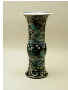
Title: Pair of Vases Date: 18th century Primary Maker: Chinese, Qing Dynasty (1644–1911) Medium: Famille noire porcelain Dimensions: 18 1/4 x 9 in. (46.4 x 22.9 cm)