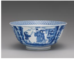
Title: Bowl Date: 1662–1722 Primary Maker: Chinese, Qing Dynasty (1644–1911), Kangxi Period (1662–1722) Medium: Hard-paste porcelain with underglaze blue Dimensions: 3 3/4 x 8 1/4 in. (9.5 x 20.9 cm)