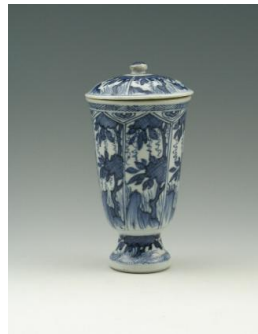
Title: Beaker and Cover (One of a Pair) Date: 17th century Primary Maker: Chinese, Transitional Period (1620–1683) Medium: Hard-paste porcelain with underglaze blue Dimensions: 6 5/16 x 3 1/4 in. (16 x 8.3 cm)