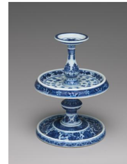
Title: Pricket Candlestick (One of a Pair) Date: 1736–96 Primary Maker: Chinese, Qing Dynasty (1644–1911), Qianlong Period (1736–1796) Medium: Hard-paste porcelain with underglaze blue Dimensions: 5 1/4 x 3 7/8 in. (13.3 x 9.8 cm)