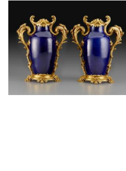
Title: Pair of Mounted Vases Date: ca. 1755-60 Primary Maker: Chinese, Qing Dynasty (1644-1911), First Half of the Eighteenth Century Medium: Hard-paste porcelain and gilt bronze Dimensions: 18 1/8 x 14 1/4 x 8 1/2 in. (46 x 36.2 x 21.6 cm)