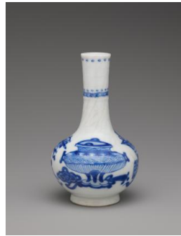
Title: Bottle Vase Date: 1662–1722 Primary Maker: Chinese, Qing Dynasty (1644–1911), Kangxi Period (1662–1722) Medium: Hard-paste porcelain with underglaze blue Dimensions: 4 x 2 1/4 in. (10.2 x 5.7 cm)