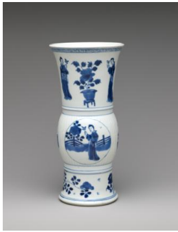
Title: Beaker Vase Date: 1662–1722 Primary Maker: Chinese, Qing Dynasty (1644–1911), Kangxi Period (1662–1722) Medium: Hard-paste porcelain with underglaze blue Dimensions: 9 9/16 x 4 1/2 in. (24.3 x 11.4 cm)