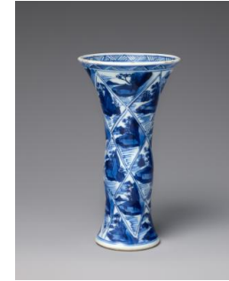
Title: Beaker on a Foot Ring (One of a Pair) Date: 17th century Primary Maker: Chinese, Transitional Period (1620–1683) Medium: Hard-paste porcelain with underglaze blue Dimensions: 5 3/4 x 3 in. (14.6 x 7.6 cm)