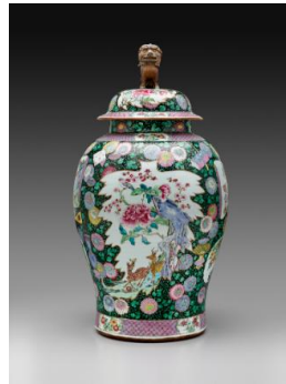
Title: Two Covered Jars with Famille Rose Decoration Date: 18th century Primary Maker: Chinese, Qing Dynasty (1644–1911) Medium: Hard-paste porcelain with polychrome overglaze Dimensions: 33 x 18 3/4 in. (83.8 x 47.6 cm)