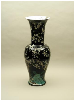
Title: Vase Date: probably 19th century Primary Maker: Chinese, Qing Dynasty (1644–1911) Medium: Famille noire porcelain Dimensions: 27 1/4 x 10 3/4 in. (69.2 x 27.3 cm)