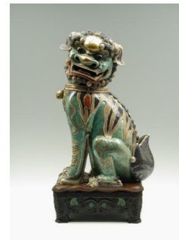
Title: Pair of Lions Date: 18th century Primary Maker: Chinese, Qing Dynasty (1644–1911) Medium: Famille verte porcelain Dimensions: H.: 19 in. (48.3 cm)