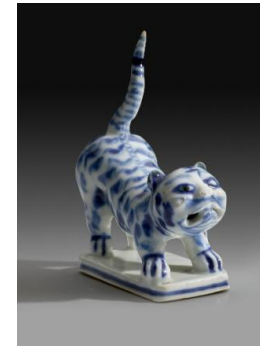
Title: Figure of a Tiger Date: 1662–1722 Primary Maker: Chinese, Qing Dynasty (1644–1911), Kangxi Period (1662–1722) Medium: Hard-paste porcelain with underglaze blue Dimensions: 3 9/16 x 1 5/16 x 2 3/8 in. (9.1 x 3.4 x 6.1 cm)