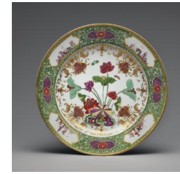
Title: Plate Date: ca. 1725-30 Primary Maker: Meissen Porcelain Manufactory Medium: Hard-paste porcelain Dimensions: Diam.: 10 1/8 in. (25.7 cm)