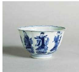
Title: Barbed and Lobed Bowl Showing the Eight Immortals Date: ca. 1650 Primary Maker: Chinese, Transitional Period (1620–1683) Medium: Hard-paste porcelain with underglaze blue Dimensions: 2 13/16 x 4 3/4 in. (7.1 x 12 cm)