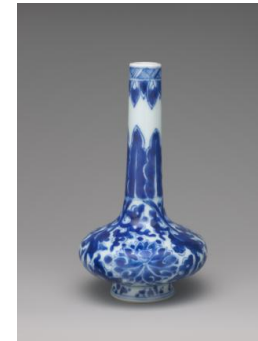
Title: Bottle-Shaped Vase (One of a Pair) Date: 1662–1722 Primary Maker: Chinese, Qing Dynasty (1644–1911), Kangxi Period (1662–1722) Medium: Hard-paste porcelain with underglaze blue Dimensions: 6 5/16 x 3 7/16 in. (16.1 x 8.8 cm)