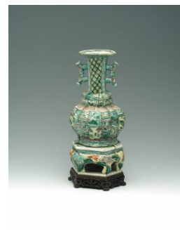
Title: Jar (One of a Five Piece Set with Famille Verte Decoration) Date: probably 18th century Primary Maker: Chinese, Qing Dynasty (1644-1911) Medium: Famille verte porcelain Dimensions: H.: 8 5/8 in. (21.9 cm)