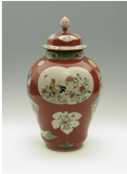
Title: Covered Jar with Famille Rose Decoration Date: 18th century Primary Maker: Chinese, Qing Dynasty (1644-1911) Medium: Hard-paste porcelain with polychrome overglaze Dimensions: 17 3/4 x 10 in. (45.1 x 25.4 cm)