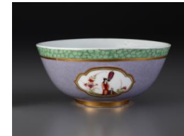
Title: Small Bowl Date: ca. 1726 Primary Maker: Meissen Porcelain Manufactory Medium: Hard-paste porcelain Dimensions: Diam.: 5 1/4 in. (13.3 cm)