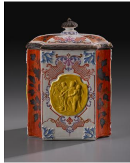
Title: Tobacco Box Date: ca. 1730 Primary Maker: Du Paquier Porcelain Manufactory Medium: Hard-paste porcelain Dimensions: 6 3/4 × 4 7/8 × 3 7/8 in. (17.1 × 12.4 × 9.8 cm)

Date: ca. 1735 Primary Maker: Du Paquier Porcelain Manufactory Medium: Hard-paste porcelain Dimensions: Saucers: 1 5/8 × 7 7/8 × 6 in. (4.1 × 20 × 15.2 cm) (each) Beakers (with handles): 3 3/8 × 4 1 /8 in. (8.6 × 10.5 cm) (each) Bowl: H.: 3 3/8 in. (8.6 cm); diam.: 8 3/4 in. (22.2 cm)