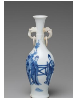
Title: Bottle-Shaped Vase with Handles (One of a Pair) Date: 1662–1722 Primary Maker: Chinese, Qing Dynasty (1644–1911), Kangxi Period (1662–1722) Medium: Hard-paste porcelain with underglaze blue Dimensions: 6 15/16 x 2 5/16 in. (17.7 x 5.9 cm)