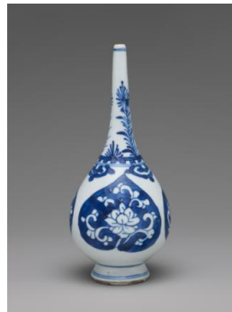
Title: Rosewater Sprinkler (One of a Pair) Date: 1662–1722 Primary Maker: Chinese, Qing Dynasty (1644–1911), Kangxi Period (1662–1722) Medium: Hard-paste porcelain with underglaze blue Dimensions: 6 13/16 x 2 7/8 in. (17.3 x 7.3 cm)