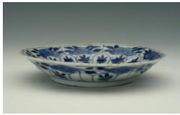
Title: Small Saucer Date: 17th century Primary Maker: Chinese, Transitional Period (1620–1683) Medium: Hard-paste porcelain with underglaze blue Dimensions: 13/16 x 4 5/16 in. (2 x 11 cm)