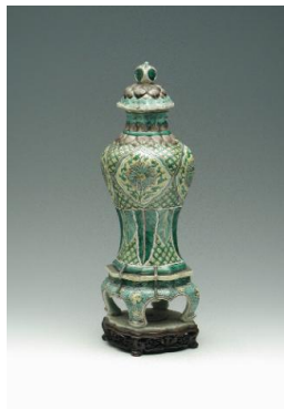
Title: Jar (One of a Five Piece Set with Famille Verte Decoration) Date: 1644-1911 Primary Maker: Chinese, Qing Dynasty (1644-1911) Medium: Famille verte porcelain Dimensions: H.: 10 1/8 in. (25.7 cm)