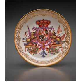
Title: Saucer Date: ca. 1724–25 Primary Maker: Meissen Porcelain Manufactory Medium: Hard-paste porcelain Dimensions: Diam.: 5 in. (12.7 cm)