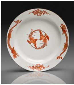
Title: Dish from the "Red Dragon" Service Date: ca. 1730–35 Primary Maker: Meissen Porcelain Manufactory Medium: Hard-paste porcelain Dimensions: Diam.: 13 3/8 in. (34.1 cm)