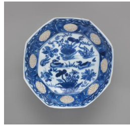
Title: Octagonal Saucer Date: 1522–66 Primary Maker: Chinese, Ming Dynasty (1368–1644), Jiajing Period (1522–1566) Medium: Hard-paste porcelain with underglaze blue Dimensions: 1 7/8 x 5 1/16 in. (4.8 x 12.9 cm)