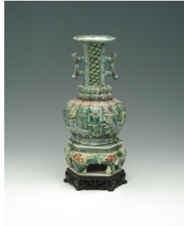
Title: Jar (One of a Five Piece Set with Famille Verte Decoration) Date: probably 18th century Primary Maker: Chinese, Qing Dynasty (1644–1911) Medium: Famille verte porcelain Dimensions: H.: 8 5/8 in. (21.9 cm)