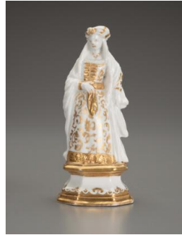
Title: Turkish Female Figure Date: ca. 1725 Primary Maker: Meissen Porcelain Manufactory Medium: Hard-paste porcelain Dimensions: H.: 4 in. (10.7 cm)