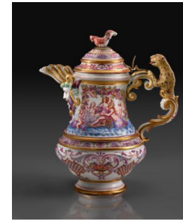
Title: Ewer Date: 1725–30 Primary Maker: Du Paquier Porcelain Manufactory Medium: Hard-paste porcelain Dimensions: H.: 8 5/8 in. (21.9 cm)