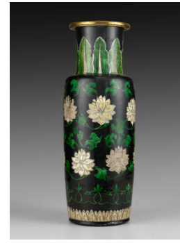
Title: Cylindrical Vase Date: probably 19th century Primary Maker: Chinese, Qing Dynasty (1644–1911) Medium: Famille noire porcelain Dimensions: 22 x 8 in. (55.9 x 20.3 cm)