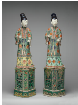
Title: Two Figures of Ladies on Stands Date: 1662–1722 Primary Maker: Chinese, Qing Dynasty (1644–1911), Kangxi Period (1662–1722) Medium: Hard-paste porcelain with polychrome overglaze Dimensions: 38 x 10 1/4 x 10 1/4 in. (96.5 x 26 x 26 cm)