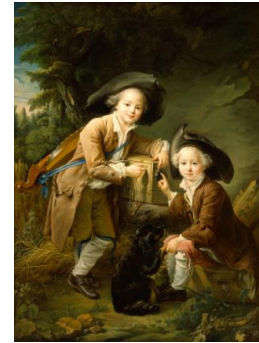
Title: The Comte and Chevalier de Choiseul as Savoyards Date: 1758 Primary Maker: François-Hubert Drouais Medium: Oil on canvas Dimensions: 54 7/8 x 42 in. (139.4 x 106.7 cm)