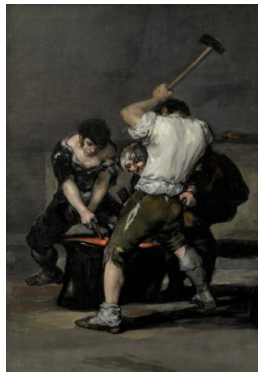
Title: The Forge

Dimensions: 31 1/2 x 23 in. (80 x 58.4 cm)