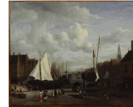
Title: Quay at Amsterdam Date: ca. 1670 Primary Maker: Jacob van Ruisdael Medium: Oil on canvas Dimensions: 20 3/8 x 25 7/8 in. (51.8 x 65.7 cm)