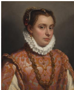
Title: Portrait of a Woman Date: ca. 1575 Primary Maker: Giovanni Battista Moroni Medium: Oil on canvas Dimensions: 20 3/8 × 16 5/16 in. (51.8 × 41.4 cm)