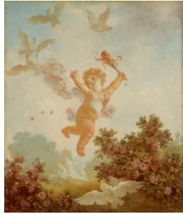
Title: The Progress of Love: Love the Jester Date: ca. 1790-91 Primary Maker: Jean-Honoré Fragonard Medium: Oil on canvas Dimensions: 59 3/8 x 50 3/8 in. (150.8 x 128 cm)