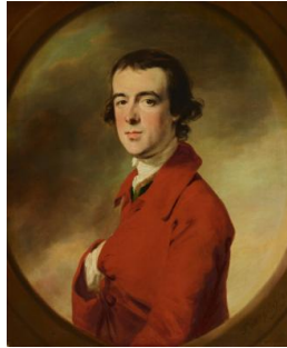
Title: The Hon. Booth Grey Date: 1764 Primary Maker: Francis Cotes Medium: Oil on canvas Dimensions: 29 1/2 × 24 in. (74.9 × 61 cm)