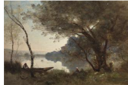
Title: The Boatman of Mortefontaine Date: ca. 1865–70 Primary Maker: Jean-Baptiste-Camille Corot Medium: Oil on canvas Dimensions: 24 × 35 3/8 in. (61 × 89.9 cm)