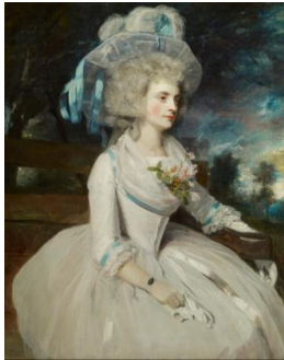
Title: Selina, Lady Skipwith Date: 1787 Primary Maker: Joshua Reynolds Medium: Oil on canvas Dimensions: 50 1/2 x 40 1/4 in. (128.3 x 102.2 cm)