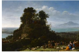
Title: The Sermon on the Mount Date: ca. 1656 Primary Maker: Claude Lorrain (Claude Gellée) Medium: Oil on canvas Dimensions: 67 1/2 x 102 1/4 in. (171.5 x 259.7 cm)