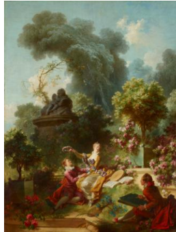
Title: The Progress of Love: The Lover Crowned Date: 1771-72 Primary Maker: Jean-Honoré Fragonard Medium: Oil on canvas Dimensions: 125 1/8 x 95 3/4 in. (317.8 x 243.2 cm)