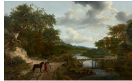
Title: Landscape with a Footbridge Date: 1652 Primary Maker: Jacob van Ruisdael Medium: Oil on canvas Dimensions: 38 3/4 x 62 5/8 in. (98.4 x 159.1 cm)