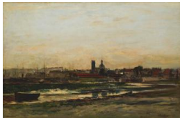
Title: Dieppe Date: 1877 Primary Maker: Charles-François Daubigny Medium: Oil on canvas Dimensions: 26 3/8 × 39 3/4 in. (67 × 101 cm)