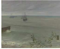
Title: Symphony in Grey and Green: The Ocean Date: 1866 Primary Maker: James McNeill Whistler Medium: Oil on canvas Dimensions: 31 3/4 × 40 1/8 in. (80.6 × 101.9 cm)