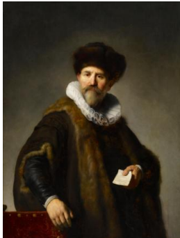
Title: Nicolaes Ruts Date: 1631 Primary Maker: Rembrandt Harmensz. van Rijn Medium: Oil on panel Dimensions: 46 x 34 3/8 in. (116.8 x 87.3 cm)