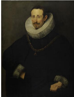
Title: A Knight of the Order of the Golden Fleece Date: early 17th century Primary Maker: Peter Paul Rubens Medium: Oil on canvas Dimensions: 39 3/4 x 30 1/2 in. (101 x 77.5 cm)