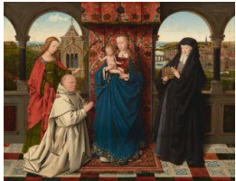
Title: The Virgin and Child with St. Barbara, St. Elizabeth, and Jan Vos Date: ca. 1441–43 Primary Maker: Jan van Eyck Medium: Oil on masonite, transferred from panel Dimensions: 18 5/8 x 24 1/8 in. (47.3 x 61.3 cm)