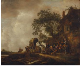
Title: Travelers Halting at an Inn Date: ca. 1635–49 Primary Maker: Isack van Ostade Medium: Oil on oak panel Dimensions: 20 1/8 x 24 1/2 in. (51.1 x 62.2 cm)