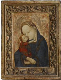
Title: Virgin and Child Date: ca. 1390–1400 Primary Maker: French, Probably Burgundian Medium: Oil and tempera on panel Dimensions: Image: 8 5/8 x 5 5/8 in. (21.9 x 14.3 cm)