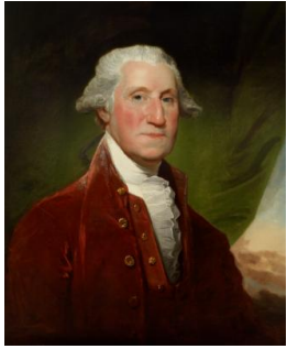
Title: George Washington Date: 1795 Primary Maker: Gilbert Stuart Medium: Oil on canvas Dimensions: 29 1/4 x 24 in. (74.3 x 61 cm)