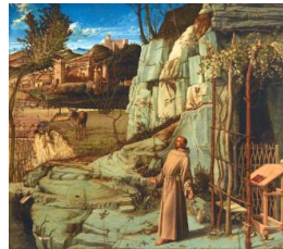
Title: St. Francis in the Desert Date: ca. 1475–80 Primary Maker: Giovanni Bellini Medium: Oil on panel Dimensions: Panel: 49 1/16 x 55 7/8 in. (124.6 x 142 cm) Image: 48 7/8 x 55 5/16 in. (124.1 x 140.5 cm)