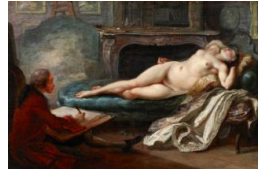
Title: The Private Academy Date: ca. 1755 Primary Maker: Gabriel de Saint-Aubin Medium: Oil on panel Dimensions: 13 1/2 x 15 x 3 1/4 in. (34.3 x 38.1 x 8.3 cm)