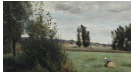
Title: Vallée de la Ferté-Milon. Laveuse auprès d'une Mare (Ferté-Milon Valley, Washer by a Pond) Date: ca. 1865 Primary Maker: Jean-Baptiste-Camille Corot Medium: Oil on canvas Dimensions: 12 1/4 × 22 1/16 in. (31.1 × 56 cm)