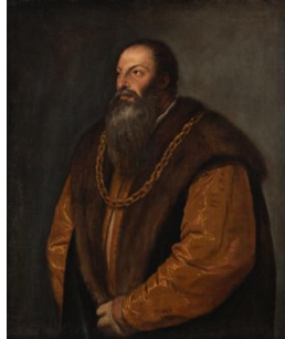
Title: Pietro Aretino Date: ca. 1537 Primary Maker: Titian (Tiziano Vecellio) Medium: Oil on canvas Dimensions: 40 1/8 x 33 3/4 in. (101.9 x 85.7 cm)