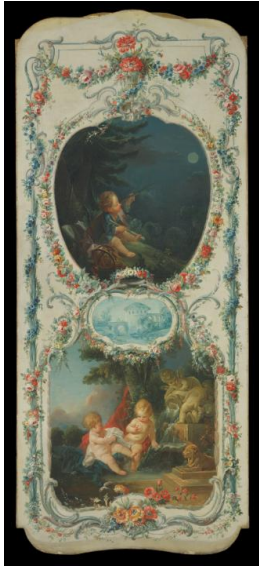
Title: The Arts and Sciences: Astronomy and Hydraulics Date: ca. 1760 Primary Maker: François Boucher Medium: Oil on canvas Dimensions: 85 1/2 x 38 in. (217.2 x 96.5 cm)