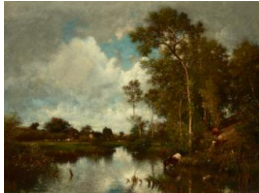
Title: The River Date: 19th century Primary Maker: Jules Dupré Medium: Oil on canvas Dimensions: 17 x 23 in. (43.2 x 58.4 cm)