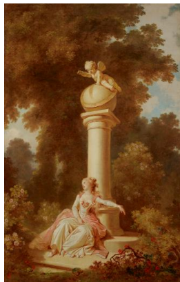
Title: The Progress of Love: Reverie Date: ca. 1790-91 Primary Maker: Jean-Honoré Fragonard Medium: Oil on canvas Dimensions: 125 1/8 x 77 5/8 in. (317.8 x 197.2 cm)