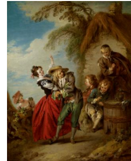
Title: The Village Orchestra Date: 1713–36 Primary Maker: Jean-Baptiste Joseph Pater Medium: Oil on canvas Dimensions: 29 3/8 x 23 1/2 in. (74.6 x 59.7 cm)