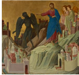
Title: The Temptation of Christ on the Mountain Date: 1308–11 Primary Maker: Duccio di Buoninsegna Medium: Tempera on poplar panel Dimensions: 17 x 18 1/8 in. (43.2 x 46 cm)