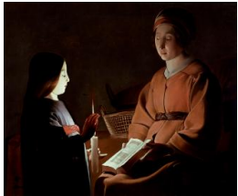
Title: The Education of the Virgin Date: ca. 1650 Primary Maker: Georges de La Tour Medium: Oil on canvas Dimensions: 33 x 39 1/2 in. (83.8 x 100.3 cm)