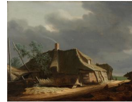
Title: Landscape with Farmhouse Date: 1628 Primary Maker: Salomon van Ruysdael Medium: Oil on panel Dimensions: 12 15/16 × 16 3/4 × 1 1/2 in. (32.9 × 42.5 × 1.3 cm)