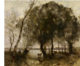
Title: The Lake Date: 1861 Primary Maker: Jean-Baptiste-Camille Corot Medium: Oil on canvas Dimensions: 52 3/8 × 62 in. (133 × 157.5 cm)