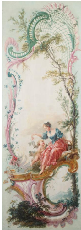
Title: Decorative Panel: Girl with Cupid Date: ca. 1730-40 Primary Maker: Jacques de Lajoue Medium: Oil on canvas Dimensions: 58 5/8 x 21 1/2 in. (148.9 x 54.6 cm)