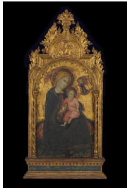
Title: Madonna and Child Date: late 14th century–early 15th century Primary Maker: Andrea di Bartolo Medium: Tempera on panel Dimensions: 21 x 13 in. (53.3 x 33 cm)