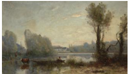
Title: Ville-d'Avray Date: ca. 1860 Primary Maker: Jean-Baptiste-Camille Corot Medium: Oil on canvas Dimensions: 17 1/4 × 29 1/4 in. (43.8 × 74.3 cm)