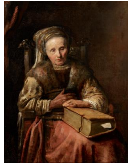
Title: Old Woman with a Book Date: mid-1650s Primary Maker: Carel van der Pluym Medium: Oil on canvas Dimensions: 38 5/8 x 30 3/4 in. (98.1 x 78.1 cm)