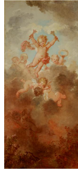
Title: The Progress of Love: Love Triumphant Date: ca. 1790-91 Primary Maker: Jean-Honoré Fragonard Medium: Oil on canvas Dimensions: 125 x 56 1/2 in. (317.5 x 143.5 cm)