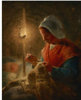
Title: Woman Sewing by Lamplight Date: 1870–72 Primary Maker: Jean-François Millet Medium: Oil on canvas Dimensions: 39 5/8 x 32 1/4 in. (100.6 x 81.9 cm)