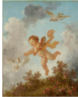
Title: The Progress of Love: Love Pursuing a Dove Date: ca. 1790–91 Primary Maker: Jean-Honoré Fragonard Medium: Oil on canvas Dimensions: 59 5/8 x 47 3/4 in. (151.4 x 121.3 cm)