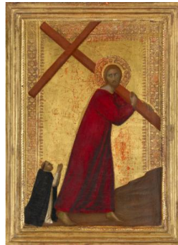
Title: Christ Bearing the Cross, with a Dominican Friar Date: ca. 1350 Primary Maker: Simone Martini Medium: Tempera on panel Dimensions: 12 x 8 1/2 in. (30.5 x 21.6 cm)