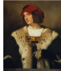
Title: Portrait of a Man in a Red Hat Date: ca. 1520 Primary Maker: Titian (Tiziano Vecellio) Medium: Oil on canvas Dimensions: 32 1/4 x 28 x 3/4 in. (81.9 x 71.1 x 1.9 cm)