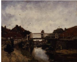
Title: The Bridge Date: 1885 Primary Maker: Jacobus Hendrikus Maris Medium: Oil on canvas Dimensions: 44 3/8 x 54 3/8 in. (112.7 x 138.1 cm)