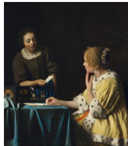
Title: Mistress and Maid Date: ca. 1664–67 Primary Maker: Johannes Vermeer Medium: Oil on canvas Dimensions: 35 1/2 x 31 in. (90.2 x 78.7 cm)