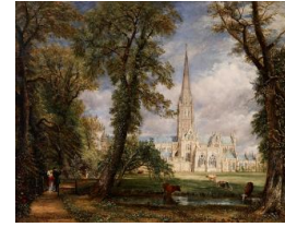
Title: Salisbury Cathedral from the Bishop's Grounds Date: 1826 Primary Maker: John Constable Medium: Oil on canvas Dimensions: 35 × 44 1/4 in. (88.9 × 112.4 cm)