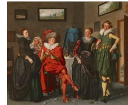
Title: The Jovial Company Date: ca. 1622–24 Primary Maker: Willem Pietersz Buytewech Medium: Oil on canvas Dimensions: 32 x 39 1/2 in. (81.3 x 100.3 cm)