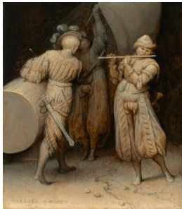
Title: Three Soldiers Date: 1568 Primary Maker: Pieter Bruegel the Elder Medium: Oil on oak panel Dimensions: 8 x 7 in. (20.3 x 17.8 cm)