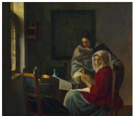
Title: Girl Interrupted at Her Music Date: ca. 1658–59 Primary Maker: Johannes Vermeer Medium: Oil on canvas Dimensions: 15 1/2 x 17 1/2 in. (39.4 x 44.5 cm)