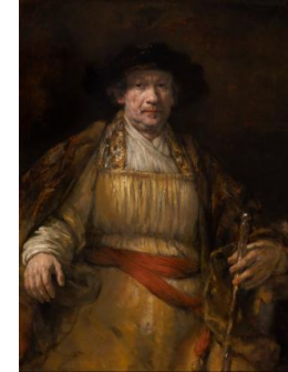
Title: Self-Portrait Date: 1658 Primary Maker: Rembrandt Harmensz. van Rijn Medium: Oil on canvas Dimensions: 52 5/8 x 40 7/8 in. (133.7 x 103.8 cm)