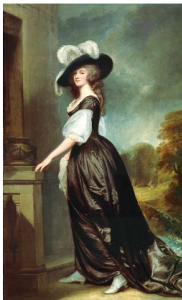
Title: Charlotte, Lady Milnes Date: 1788–92 Primary Maker: George Romney Medium: Oil on canvas Dimensions: 95 1/8 x 58 3/4 in. (241.6 x 149.2 cm)