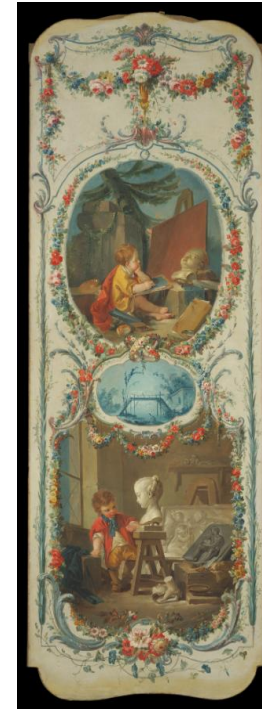
Title: The Arts and Sciences: Painting and Sculpture Date: ca. 1760 Primary Maker: François Boucher Medium: Oil on canvas Dimensions: 85 1/2 x 30 1/2 in. (217.2 x 77.5 cm)