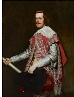
Title: King Philip IV of Spain Date: 1644 Primary Maker: Diego Rodríguez de Silva y Velázquez Medium: Oil on canvas Dimensions: 51 1/8 x 39 1/8 in. (129.9 x 99.4 cm)