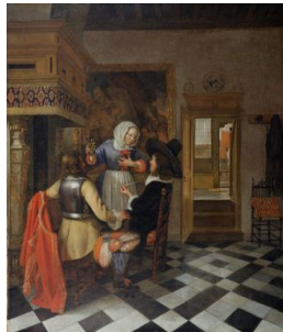
Title: Drinkers before the Fireplace Date: ca. 1660 Primary Maker: Hendrik van der Burgh Medium: Oil on canvas Dimensions: 30 1/2 x 26 1/8 in. (77.5 x 66.4 cm)