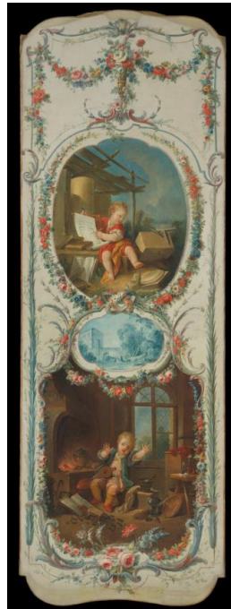
Title: The Arts and Sciences: Architecture and Chemistry Date: ca. 1760 Primary Maker: François Boucher Medium: Oil on canvas Dimensions: 85 1/2 x 30 1/2 in. (217.2 x 77.5 cm)