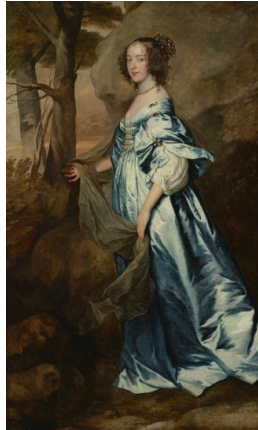
Title: Lady Anne Carey, Later Viscountess Claneboye and Countess of Clanbrassil Date: ca. 1636 Primary Maker: Anthony van Dyck Medium: Oil on canvas Dimensions: 83 1/2 x 50 1/4 in. (212.1 x 127.6 cm)