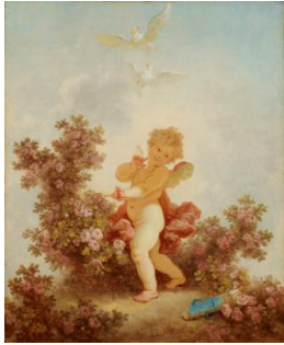
Title: The Progress of Love: Love the Sentinel Date: ca. 1790–91 Primary Maker: Jean-Honoré Fragonard Medium: Oil on canvas Dimensions: 57 5/8 x 47 1/2 in. (146.4 x 120.7 cm)