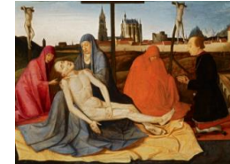
Title: Pietà with Donor Date: mid-15th century Primary Maker: French, Probably South of France Medium: Tempera or mixed technique on panel Dimensions: 15 5/8 x 22 in. (39.7 x 55.9 cm)