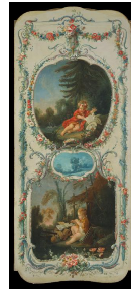
Title: The Arts and Sciences: Poetry and Music Date: ca. 1760 Primary Maker: François Boucher Medium: Oil on canvas Dimensions: 85 1/2 x 38 in. (217.2 x 96.5 cm)