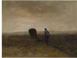
Title: Early Morning Plowing Date: ca. 1875 Primary Maker: Anton Mauve Medium: Oil on canvas Dimensions: 16 7/8 x 22 7/8 in. (42.9 x 58.1 cm)