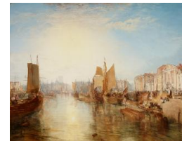
Title: Harbor of Dieppe: Changement de Domicile Date: exhibited 1825, but subsequently dated 1826 Primary Maker: Joseph Mallord William Turner Medium: Oil on canvas Dimensions: 68 3/8 x 88 3/4 in. (173.7 x 225.4 cm)