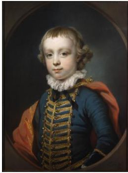
Title: Francis Vernon Date: 1757 Primary Maker: Francis Cotes Medium: Pastel on paper affixed to canvas Dimensions: 24 × 17 7/8 in. (61 × 45.4 cm)