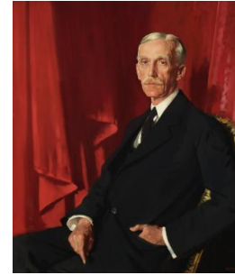
Title: Portrait of Andrew W. Mellon Date: 1924 Primary Maker: William Orpen Medium: Oil on canvas Dimensions: 39 3/4 x 33 in. (101 x 83.8 cm)