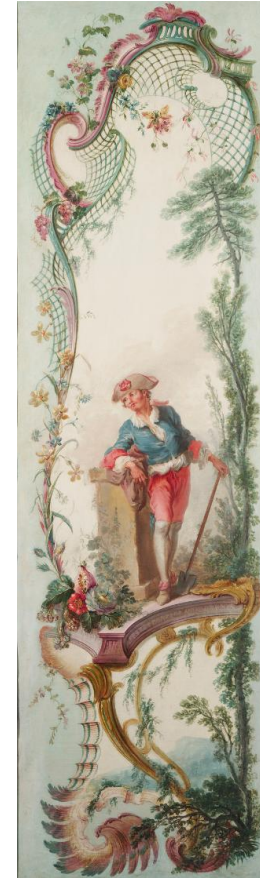
Title: Decorative Panel: Youth with a Spade

Dimensions: 58 5/8 x 21 1/2 in. (148.9 x 54.6 cm)