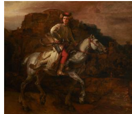
Title: The Polish Rider Date: ca. 1655 Primary Maker: Rembrandt Harmensz. van Rijn Medium: Oil on canvas Dimensions: 46 x 53 1/8 in. (116.8 x 134.9 cm)