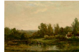
Title: The Washerwomen Date: 1870–74 Primary Maker: Charles-François Daubigny Medium: Oil on canvas Dimensions: 20 7/8 × 31 1/2 in. (53 × 80 cm)