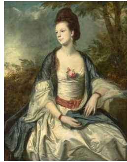
Title: Lady Cecil Rice Date: 1762 Primary Maker: Joshua Reynolds Medium: Oil on canvas Dimensions: 49 3/4 x 39 5/8 in. (126.4 x 100.6 cm)