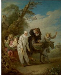
Title: Procession of Italian Comedians Date: 1713–36 Primary Maker: Jean-Baptiste Joseph Pater Medium: Oil on canvas Dimensions: 29 1/4 x 23 3/8 in. (74.3 x 59.4 cm)