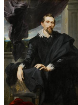
Title: Frans Snyders Date: ca. 1620 Primary Maker: Anthony van Dyck Medium: Oil on canvas Dimensions: 56 1/8 x 41 1/2 in. (142.6 x 105.4 cm)