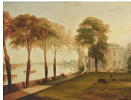
Title: Mortlake Terrace: Early Summer Morning Date: 1826 Primary Maker: Joseph Mallord William Turner Medium: Oil on canvas Dimensions: 36 5/8 x 48 1/2 in. (93 x 123.2 cm)