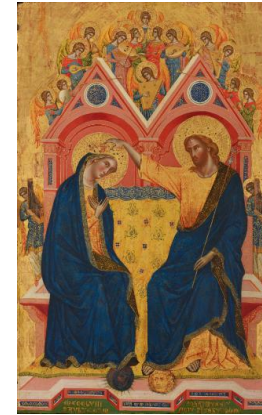
Title: The Coronation of the Virgin Date: 1358 Primary Maker: Paolo Veneziano Medium: Tempera on panel Dimensions: 43 1/4 x 27 in. (109.9 x 68.6 cm)