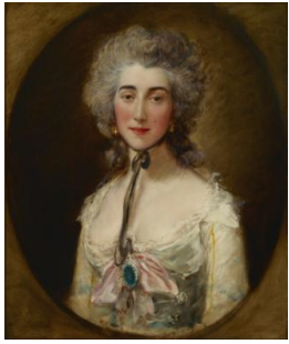
Title: Grace Dalrymple Elliott