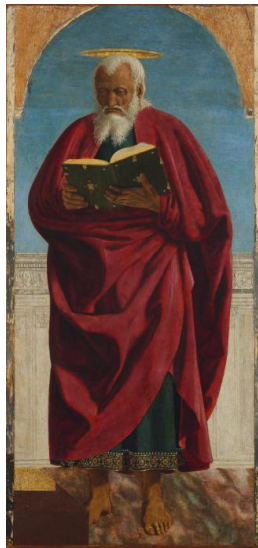
Title: St. John the Evangelist Date: 1454–69 Primary Maker: Piero della Francesca Medium: Tempera on panel Dimensions: 52 3/4 x 24 1/2 in. (134 x 62.2 cm)