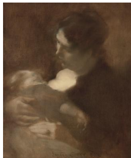
Title: Motherhood Date: 1880s Primary Maker: Eugène Carrière Medium: Oil on canvas Dimensions: 22 x 18 1/4 in. (55.9 x 46.4 cm)