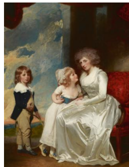
Title: Henrietta, Countess of Warwick, and Her Children Date: 1787–89 Primary Maker: George Romney Medium: Oil on canvas Dimensions: 79 3/4 x 61 1/2 in. (202.6 x 156.2 cm)