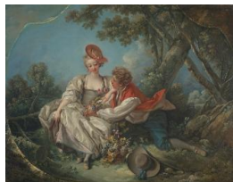
Title: The Four Seasons: Autumn Date: 1755 Primary Maker: François Boucher Medium: Oil on canvas Dimensions: 22 1/4 x 28 3/4 in. (56.5 x 73 cm)