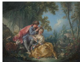
Title: The Four Seasons: Spring Date: 1755 Primary Maker: François Boucher Medium: Oil on canvas Dimensions: 21 3/8 x 28 5/8 in. (54.3 x 72.7 cm)