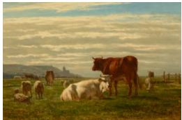
Title: A Pasture in Normandy Date: 1850s Primary Maker: Constant Troyon Medium: Oil on wood panel Dimensions: 17 x 25 5/8 in. (43.2 x 65.1 cm)