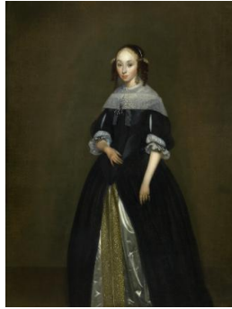
Title: Portrait of a Young Lady Date: ca. 1665–70 Primary Maker: Gerard ter Borch Medium: Oil on canvas Dimensions: 21 1/8 x 16 in. (53.7 x 40.6 cm)