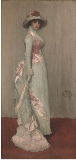
Title: Harmony in Pink and Grey: Portrait of Lady Meux Date: 1881–82 Primary Maker: James McNeill Whistler Medium: Oil on canvas Dimensions: 76 1/4 × 36 5/8 in. (193.7 × 93 cm)