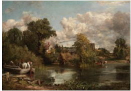
Title: The White Horse Date: 1819 Primary Maker: John Constable Medium: Oil on canvas Dimensions: 51 3/4 × 74 1/8 in. (131.4 × 188.3 cm)