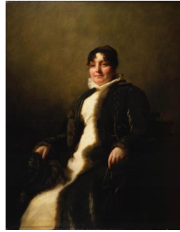
Title: Mrs. James Cruikshank Date: ca. 1805-08 Primary Maker: Sir Henry Raeburn Medium: Oil on canvas Dimensions: 50 3/4 x 40 in. (128.9 x 101.6 cm)