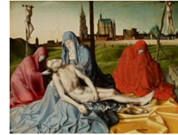
Title: Pietà Date: ca. 1440 Primary Maker: Konrad Witz Medium: Tempera and oil on panel Dimensions: 13 1/8 × 17 1/2 in. (33.3 × 44.5 cm)