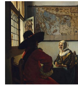
Title: Officer and Laughing Girl Date: ca. 1657 Primary Maker: Johannes Vermeer Medium: Oil on canvas Dimensions: 19 7/8 x 18 1/8 in. (50.5 x 46 cm)