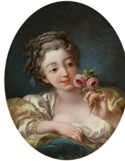
Title: Girl with Roses Date: 1760s Primary Maker: François Boucher Medium: Oil on canvas Dimensions: 21 1/2 x 16 3/4 in. (54.6 x 42.5 cm)