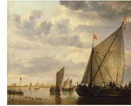
Title: River Scene Date: 17th century Primary Maker: Aelbert Cuyp Medium: Oil on oak panel Dimensions: 23 1/8 × 29 1/8 in. (58.7 × 74 cm)