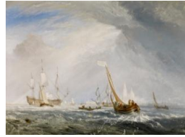
Title: Antwerp: Van Goyen Looking Out for a Subject Date: 1833 Primary Maker: Joseph Mallord William Turner Medium: Oil on canvas Dimensions: 36 1/8 x 48 3/8 in. (91.8 x 122.9 cm)