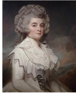
Title: Miss Mary Finch-Hatton Date: 1788 Primary Maker: George Romney Medium: Oil on canvas Dimensions: 29 7/8 x 25 1/8 in. (75.9 x 63.8 cm)