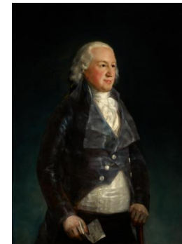
Title: Don Pedro, Duque de Osuna

Dimensions: 71 1/2 x 49 1/4 in. (181.6 x 125.1 cm)