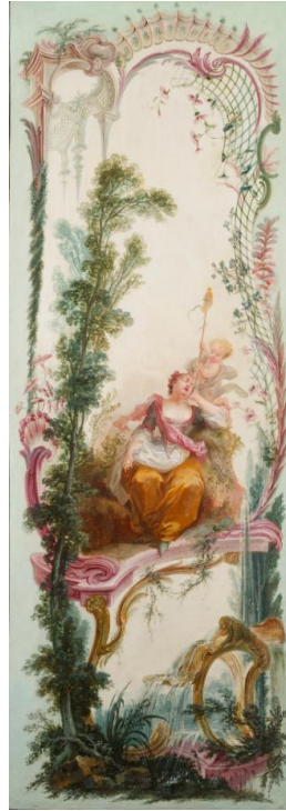
Title: Decorative Panel: Shepherdess Asleep

Dimensions: 58 5/8 x 21 1/2 in. (148.9 x 54.6 cm)