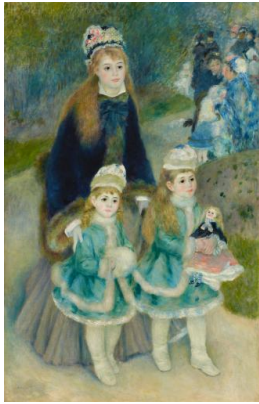
Title: La Promenade Date: 1875–76 Primary Maker: Pierre-Auguste Renoir Medium: Oil on canvas Dimensions: 67 x 42 5/8 in. (170.2 x 108.3 cm)