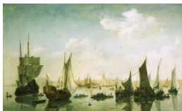
Title: A View of the River Maas Before Rotterdam Date: ca. 1645–65 Primary Maker: Jan van de Cappelle Medium: Oil on oak panel Dimensions: 34 3/4 x 64 x 2 1/4 in. (88.3 x 162.6 x 5.7 cm)