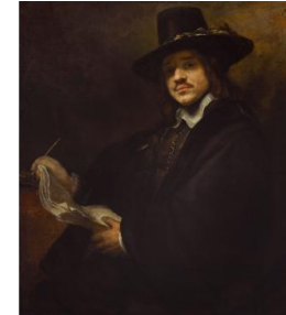
Title: Portrait of a Young Artist Date: 1650s Primary Maker: Rembrandt Harmensz. van Rijn Medium: Oil on canvas Dimensions: 39 1/8 x 35 in. (99.4 x 88.9 cm)