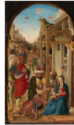
Title: Adoration of the Magi Date: 1470s Primary Maker: Lazzaro Bastiani Medium: Tempera on poplar panel Dimensions: 20 1/2 x 11 in. (52.1 x 27.9 cm)