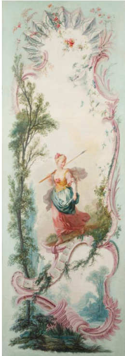
Title: Decorative Panel: Girl with a Spear