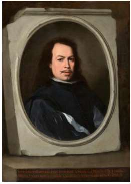
Title: Self-Portrait Date: ca. 1650–55 Primary Maker: Bartolomé Esteban Murillo Medium: Oil on canvas Dimensions: 42 1/8 x 30 1/2 in. (107 x 77.5 cm)