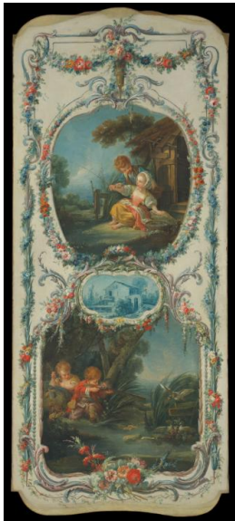
Title: The Arts and Sciences: Fishing and Hunting Date: ca. 1760 Primary Maker: François Boucher Medium: Oil on canvas Dimensions: 85 1/2 x 38 in. (217.2 x 96.5 cm)