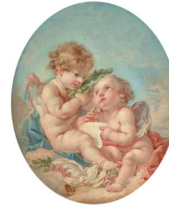
Title: Poetry Date: 18th century Primary Maker: François Boucher Medium: Oil on canvas Dimensions: 15 3/4 x 12 7/8 in. (40 x 32.7 cm)