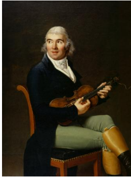
Title: Antonio Bartolomeo Bruni Date: before 1804 Primary Maker: Césarine-Henriette-Flore Davin-Mirvault Medium: Oil on canvas Dimensions: 50 7/8 x 37 3/4 in. (129.2 x 95.9 cm)