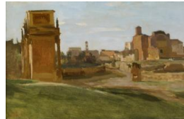
Title: The Arch of Constantine and the Forum, Rome Date: 1843 Primary Maker: Jean-Baptiste-Camille Corot Medium: Oil on paper mounted on canvas Dimensions: 10 5/8 × 16 1/2 in. (27 × 41.9 cm)