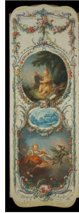
Title: The Arts and Sciences: Comedy and Tragedy Date: ca. 1760 Primary Maker: François Boucher Medium: Oil on canvas Dimensions: 85 1/2 x 30 1/2 in. (217.2 x 77.5 cm)