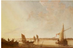
Title: Dordrecht: Sunrise Date: ca. 1650 Primary Maker: Aelbert Cuyp Medium: Oil on canvas Dimensions: 41 3/8 × 63 3/8 in. (105.1 × 161 cm)