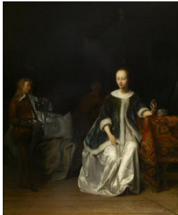
Title: A Lady at Her Toilet Date: 1648–67 Primary Maker: Gabriel Metsu Medium: Oil on canvas Dimensions: 20 3/8 x 16 5/8 in. (51.8 x 42.2 cm)