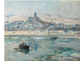
Title: Vétheuil in Winter Date: 1878–79 Primary Maker: Claude Monet Medium: Oil on canvas Dimensions: 27 x 35 3/8 in. (68.6 x 89.9 cm)