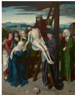
Title: The Deposition Date: ca. 1495–1500 Primary Maker: Gerard David Medium: Oil on canvas Dimensions: 56 1/8 × 44 1/4 in. (142.6 × 112.4 cm)