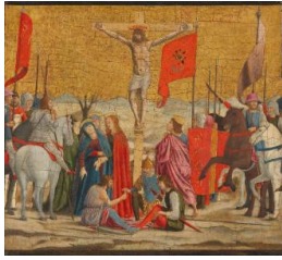
Title: The Crucifixion Date: 1454-69 Primary Maker: Piero della Francesca Medium: Tempera on panel Dimensions: 14 3/4 x 16 3/16 in. (37.5 x 41.1 cm)