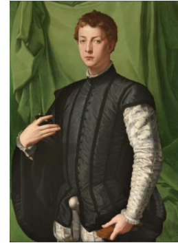
Title: Lodovico Capponi Date: ca. 1550–55 Primary Maker: Agnolo di Cosimo (Bronzino) Medium: Oil on panel Dimensions: 45 7/8 x 33 3/4 in. (116.5 x 85.7 cm)