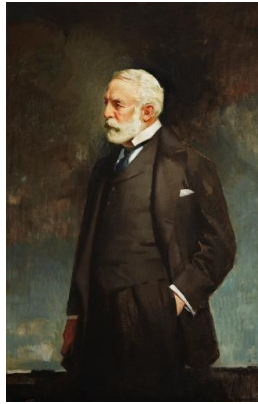
Title: Henry Clay Frick Date: 1943 Primary Maker: John C. Johansen Medium: Oil on canvas Dimensions: 56 1/8 x 35 15/16 in. (142.6 x 91.3 cm)