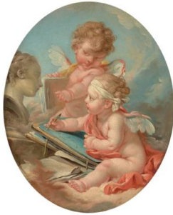
Title: Drawing Date: 18th century Primary Maker: François Boucher Medium: Oil on canvas Dimensions: 15 3/4 x 12 7/8 in. (40 x 32.7 cm)