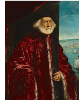
Title: Portrait of a Venetian Procurator Date: 16th century Primary Maker: Jacopo Tintoretto Medium: Oil on canvas Dimensions: 44 5/8 x 35 in. (113.3 x 88.9 cm)