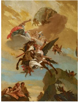
Title: Perseus and Andromeda Date: ca. 1730–31 Primary Maker: Giambattista Tiepolo Medium: Oil on canvas Dimensions: 20 3/8 x 16 in. (51.8 x 40.6 cm)