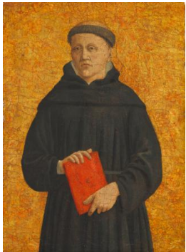
Title: An Augustinian Monk (St. Leonard?) Date: 1454–69 Primary Maker: Piero della Francesca Medium: Tempera on panel Dimensions: 15 3/4 x 11 1/8 in. (40 x 28.3 cm)