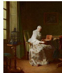
Title: Lady with a Bird-Organ Date: 1753 (?) Primary Maker: Jean-Siméon Chardin Medium: Oil on canvas Dimensions: 20 x 17 in. (50.8 x 43.2 cm)