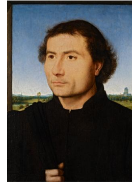
Title: Portrait of a Man Date: ca. 1470–75 Primary Maker: Hans Memling Medium: Oil on panel Dimensions: 13 1/8 x 9 1/8 in. (33.3 x 23.2 cm)