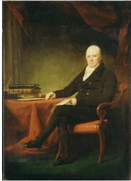
Title: Alexander Allan Date: ca. 1815 Primary Maker: Sir Henry Raeburn Medium: Oil on canvas Dimensions: 81 x 57 1/2 in. (205.7 x 146.1 cm)