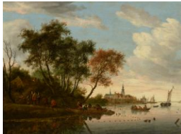
Title: River Scene: Men Dragging a Net Date: ca. 1667 Primary Maker: Salomon van Ruysdael Medium: Oil on canvas Dimensions: 26 1/4 x 35 1/8 in. (66.7 x 89.2 cm)