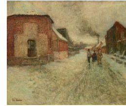
Title: Winter in Norway Date: ca. 1895 Primary Maker: Frits Thaulow Medium: Oil on canvas Dimensions: 21 1/2 x 25 3/4 in. (54.6 x 65.4 cm)