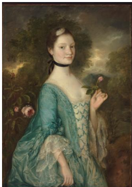
Title: Sarah, Lady Innes Date: ca. 1757 Primary Maker: Thomas Gainsborough Medium: Oil on canvas Dimensions: 40 x 28 5/8 in. (101.6 x 72.7 cm)