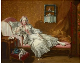
Title: A Lady on Her Day Bed Date: 1743 Primary Maker: François Boucher Medium: Oil on canvas Dimensions: 22 1/2 x 26 7/8 in. (57.2 x 68.3 cm)