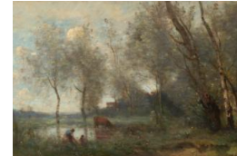
Title: The Pond Date: ca. 1868–70 Primary Maker: Jean-Baptiste-Camille Corot Medium: Oil on canvas Dimensions: 19 1/4 × 29 in. (48.9 × 73.7 cm)