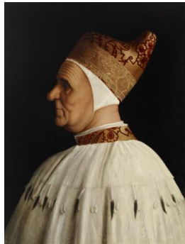
Title: Doge Giovanni Mocenigo Date: 1478–85 Primary Maker: Gentile Bellini Medium: Tempera on poplar panel Dimensions: 25 1/2 x 18 3/4 in. (64.8 x 47.6 cm)