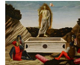
Title: The Resurrection Date: ca. 1465–70 Primary Maker: Francesco Botticini Medium: Tempera on poplar panel Dimensions: 11 1/4 x 13 1/4 in. (28.6 x 33.7 cm)