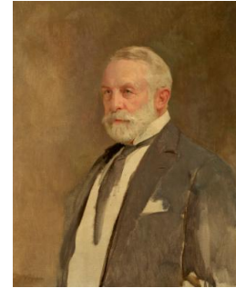
Title: Portrait of Henry Clay Frick Date: 1924 Primary Maker: Gerald Kelly Medium: Oil on canvas Dimensions: 29 1/4 x 24 1/4 in. (74.3 x 61.6 cm)