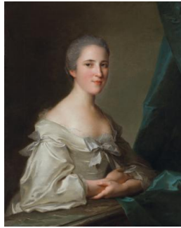
Title: Elizabeth, Countess of Warwick Date: 1754 Primary Maker: Jean-Marc Nattier Medium: Oil on canvas Dimensions: 32 1/8 x 25 3/4 in. (81.6 x 65.4 cm)