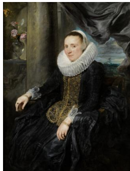
Title: Margareta de Vos Date: ca. 1620 Primary Maker: Anthony van Dyck Medium: Oil on canvas Dimensions: 51 1/2 x 39 1/8 in. (130.8 x 99.4 cm)