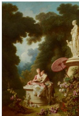
Title: The Progress of Love: Love Letters Date: 1771-72 Primary Maker: Jean-Honoré Fragonard Medium: Oil on canvas Dimensions: 124 7/8 x 85 3/8 in. (317.2 x 216.9 cm)