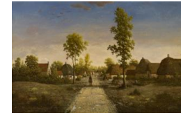
Title: The Village of Becquigny Date: ca. 1857 Primary Maker: Théodore Rousseau Medium: Oil on mahogany panel Dimensions: 25 x 39 3/8 in. (63.5 x 100 cm)