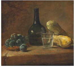
Title: Still Life with Plums Date: ca. 1730 Primary Maker: Jean-Siméon Chardin Medium: Oil on canvas Dimensions: 17 3/4 × 19 3/4 in. (45.1 × 50.2 cm)