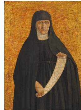
Title: An Augustinian Nun (St. Monica) Date: 1454–69 Primary Maker: Piero della Francesca Medium: Tempera on panel Dimensions: 15 1/4 x 11 in. (38.7 x 27.9 cm)