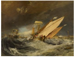
Title: Fishing Boats Entering Calais Harbor Date: ca. 1803 Primary Maker: Joseph Mallord William Turner Medium: Oil on canvas Dimensions: 29 x 38 3/4 in. (73.7 x 98.4 cm)