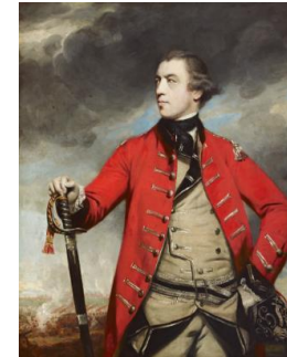
Title: General John Burgoyne Date: ca. 1766 Primary Maker: Joshua Reynolds Medium: Oil on canvas Dimensions: 50 x 39 7/8 in. (127 x 101.3 cm)