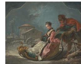
Title: The Four Seasons: Winter Date: 1755 Primary Maker: François Boucher Medium: Oil on canvas Dimensions: 22 3/8 x 28 3/4 in. (56.8 x 73 cm)