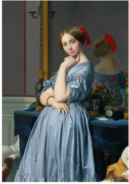
Title: Louise, Princesse de Broglie, Later the Comtesse d'Haussonville Date: 1845 Primary Maker: Jean-Auguste-Dominique Ingres Medium: Oil on canvas Dimensions: 51 7/8 x 36 1/4 in. (131.8 x 92.1 cm)