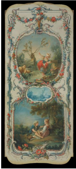
Title: The Arts and Sciences: Fowling and Horticulture Date: ca. 1760 Primary Maker: François Boucher Medium: Oil on canvas Dimensions: 85 1/2 x 38 in. (217.2 x 96.5 cm)