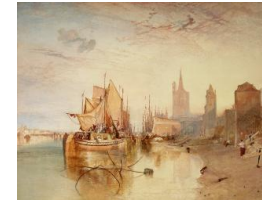
Title: Cologne, the Arrival of a Packet-Boat: Evening Date: 1826 Primary Maker: Joseph Mallord William Turner Medium: Oil on canvas Dimensions: 66 3/8 x 88 1/4 in. (168.6 x 224.2 cm)