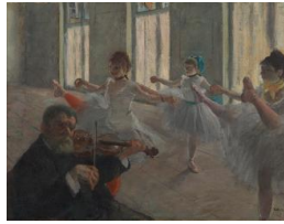
Title: The Rehearsal Date: 1878-79 Primary Maker: Edgar Degas Medium: Oil on canvas Dimensions: 18 3/4 x 24 in. (47.6 x 61 cm)