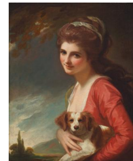
Title: Emma Hart, Later Lady Hamilton, as "Nature" Date: 1782 Primary Maker: George Romney Medium: Oil on canvas Dimensions: 29 7/8 x 24 3/4 in. (75.9 x 62.9 cm)