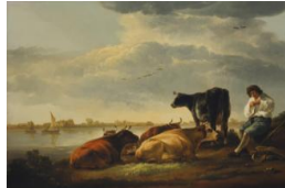
Title: Cows and Herdsman by a River Date: after 1650 Primary Maker: Aelbert Cuyp Medium: Oil on oak panel Dimensions: 19 3/4 × 29 1/4 in. (50.2 × 74.3 cm)