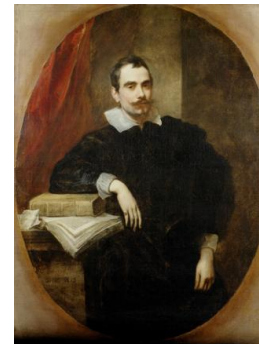
Title: Ottaviano Canevari Date: ca. 1627 Primary Maker: Anthony van Dyck Medium: Oil on canvas Dimensions: 51 1/4 x 39 in. (130.2 x 99.1 cm)