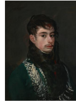
Title: An Officer (Conde de Teba?)

Dimensions: 35 3/4 x 18 1/2 in. (90.8 x 47 cm)