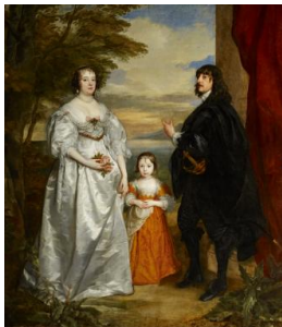
Title: James Stanley, Lord Strange, Later Seventh Earl of Derby, with His Wife, Charlotte, and Their Daughter Date: ca. 1636 Primary Maker: Anthony van Dyck Medium: Oil on canvas Dimensions: 97 x 84 1/8 in. (246.4 x 213.7 cm)