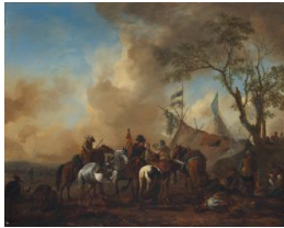
Title: The Cavalry Camp Date: 1638–68 Primary Maker: Philips Wouwerman Medium: Oil on oak panel Dimensions: 16 3/4 × 20 3/4 in. (42.5 × 52.7 cm)