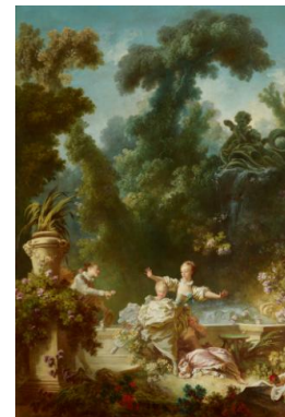
Title: The Progress of Love: The Pursuit Date: 1771-72 Primary Maker: Jean-Honoré Fragonard Medium: Oil on canvas Dimensions: 125 1/8 x 84 7/8 in. (317.8 x 215.6 cm)