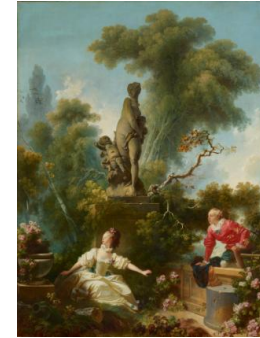
Title: The Progress of Love: The Meeting Date: 1771–72 Primary Maker: Jean-Honoré Fragonard Medium: Oil on canvas Dimensions: 125 x 96 in. (317.5 x 243.8 cm)