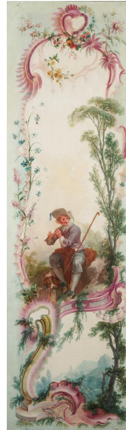
Title: Decorative Panel: The Shepherd's Song Date: ca. 1730-40 Primary Maker: Jacques de Lajoue Medium: Oil on canvas Dimensions: 58 5/8 x 17 7/8 in. (148.9 x 45.4 cm)