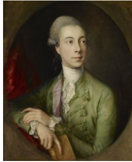
Title: Richard Paul Jodrell

Dimensions: 30 1/8 x 25 in. (76.5 x 63.5 cm)