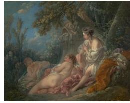
Title: The Four Seasons: Summer Date: 1755 Primary Maker: François Boucher Medium: Oil on canvas Dimensions: 22 1/2 x 28 5/8 in. (57.2 x 72.7 cm)