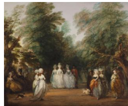
Title: The Mall in St. James's Park Date: ca. 1783 Primary Maker: Thomas Gainsborough Medium: Oil on canvas Dimensions: 47 1/2 x 57 7/8 in. (120.7 x 147 cm)