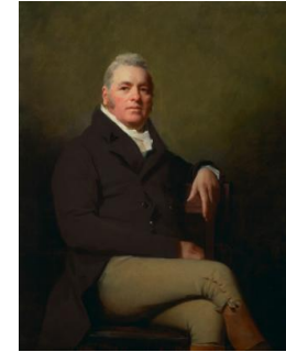
Title: James Cruikshank Date: 1805-08 Primary Maker: Sir Henry Raeburn Medium: Oil on canvas Dimensions: 50 x 40 in. (127 x 101.6 cm)