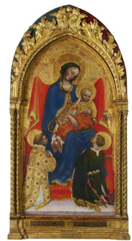
Title: Virgin and Child, with Saints Lawrence and Julian

Dimensions: 29 3/4 x 24 5/8 in. (75.6 x 62.5 cm)