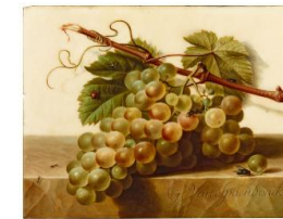
Title: Grapes with Insects on a Marble Top Date: ca. 1791–95 Primary Maker: Gerard van Spaendonck Medium: Oil on marble Dimensions: 7 3/8 x 9 1/4 x 1/8 in. (18.7 x 23.5 x 0.3 cm)