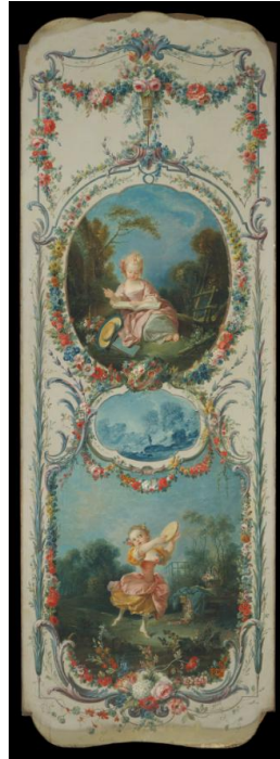
Title: The Arts and Sciences: Singing and Dancing Date: ca. 1760 Primary Maker: François Boucher Medium: Oil on canvas Dimensions: 85 1/2 x 30 1/2 in. (217.2 x 77.5 cm)