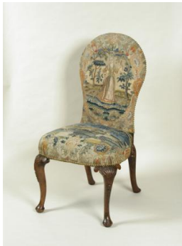
Title: Queen Anne Chair with Needlepoint Upholstery Date: 1702–14 Primary Maker: English, Eighteenth Century Medium: Walnut frame Dimensions: 40 x 22 x 20 in. (101.6 x 55.9 x 50.8 cm)