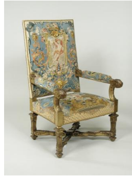
Title: Armchair Showing Grotesque Compositions on Beige or Blue Grounds (Part of a Set of One Canapé and Four Armchairs) Date: between 1675 and 1725 and 19th century Primary Maker: French Medium: Dyed wool and silk yarns on gilt beechwood Dimensions: 52 x 33 3/8 x 30 1/4 in. (132.1 x 84.8 x 76.8 cm)