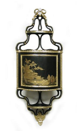
Title: Hanging Corner Cabinet with Panels of Black-and Gold Tôle (One of a Pair) Date: 1775–80 Primary Maker: Unknown artist Medium: Ebony, tulipwood veneer, tôle, gilt bronze, and laquered brass on oak Dimensions: 33 1/4 x 12 3/4 in. (84.5 x 32.4 cm)