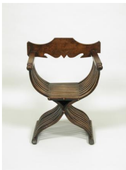
Title: Chair with Shield and Crests Date: 16th or 19th century Primary Maker: Italian, Sixteenth Century Medium: Walnut Dimensions: 38 x 27 1/2 x 22 in. (96.5 x 69.9 x 55.9 cm)