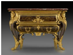
Title: Commode (One of a Pair) Date: ca. 1820–50 Primary Maker: André-Charles Boulle Medium: Oak and walnut veneered with turtle shell, brass, and ebony; gilt bronze, marble Dimensions: 34 3/4 x 48 3/4 x 25 1/4 in. (88.3 x 123.8 x 64.1 cm)