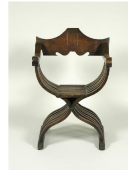
Title: Chair with Shield and Crests Date: 16th or 19th century Primary Maker: Italian, Sixteenth Century Medium: Walnut Dimensions: 39 1/2 x 25 7/16 x 21 3/8 in. (100.3 x 64.6 x 54.3 cm)