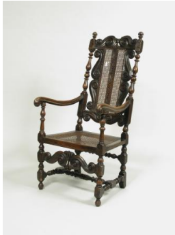
Title: Armchair Date: 19th century Medium: Walnut Dimensions: 49 x 23 1/2 x 28 in. (124.5 x 59.7 x 71.1 cm)