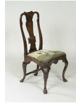
Title: Queen Anne Chair Date: 1702–14 Primary Maker: English, Eighteenth Century Medium: Walnut frame Dimensions: 41 1/8 x 22 1/4 x 19 3/4 in. (104.5 x 56.5 x 50.2 cm)