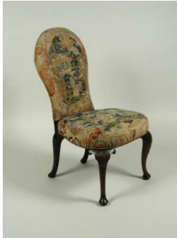
Title: Queen Anne Chair with Needlepoint Upholstery Date: 1702–14 Primary Maker: English, Eighteenth Century Medium: Walnut frame Dimensions: 40 x 22 x 20 in. (101.6 x 55.9 x 50.8 cm)