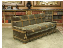
Title: Green Velvet Sofa with Braid Tassel Fringe Primary Maker: White Allom Ltd., London Medium: Walnut frame Dimensions: 30 1/2 x 99 x 34 1/2 in. (77.5 x 251.5 x 87.6 cm)