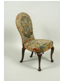
Title: Queen Anne Chair with Needlepoint Upholstery Date: 1702–14 Primary Maker: English, Eighteenth Century Medium: Walnut frame Dimensions: 40 x 22 x 20 in. (101.6 x 55.9 x 50.8 cm)