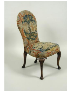
Title: Queen Anne Chair with Needlepoint Upholstery Date: 1702–14 Primary Maker: English, Eighteenth Century Medium: Walnut frame Dimensions: 40 x 22 x 20 in. (101.6 x 55.9 x 50.8 cm)