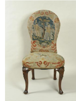
Title: Queen Anne Chair with Needlepoint Upholstery Date: 1702–14 Primary Maker: English, Eighteenth Century Medium: Walnut frame Dimensions: 40 x 22 x 20 in. (101.6 x 55.9 x 50.8 cm)