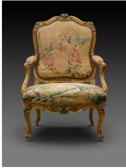
Title: Armchair with Gilt and Polychrome Frame and Beauvais Tapestry Cover Showing Pastoral Scenes (Part of a Set with Three Canapés and Four Armchairs) Date: ca. 1760–65 Primary Maker: Beauvais Tapestry Manufactory Medium: Dyed wool and silk yarns on wool and gilt walnut Dimensions: 36 1/4 x 26 1/4 in. (92.1 x 66.7 cm) Frames (average): 36 1/4 x 26 1/4 x 27 in. (92.1 x 66.7 x 68.6 cm) Covers (average): backs: 20 3/4 x 18 3/4 in. (52.7 x 47.6 cm) Covers (average): seats: 26 1/2 x 30 in. (67.3 x 76.2 cm)