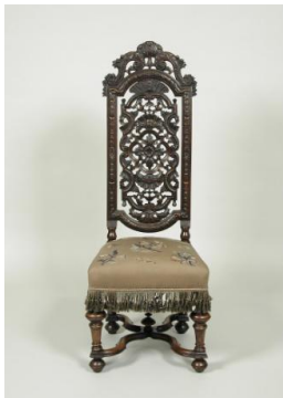
Title: Tallback Side-Chair with Appliquéd Seat Medium: Walnut frame Dimensions: 54 x 21 x 19 1/2 in. (137.2 x 53.3 x 49.5 cm)