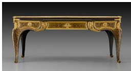
Title: Bureau Plat (Writing Table) Date: ca. 1710, with later alterations Primary Maker: André-Charles Boulle Medium: Oak and walnut veneered with brass, tortoiseshell marquetry, ebony, and pewter; gilt bronze, leather Dimensions: 31 3/4 x 74 1/4 x 36 7/8 in. (80.6 x 188.6 x 93.7 cm)