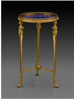
Title: Tripod Table Date: ca. 1785 Primary Maker: French, Paris Medium: Gilt bronze, lapis lazuli, iron, and oak Dimensions: H.: 28 1/4 in. (71.8 cm), diam.: 16 1/4 in. (41.3 cm)