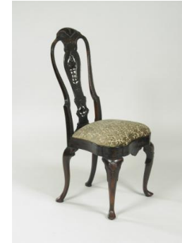
Title: Queen Anne Chair with Reliefs Date: 1702–14 Primary Maker: English, Eighteenth Century Medium: Walnut frame Dimensions: 44 5/16 x 20 1/2 x 17 1/4 in. (112.6 x 52.1 x 43.8 cm)