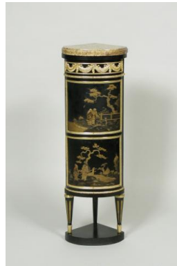
Title: Small Encoignures (Corner Cupboard) with Panels of Black-and Gold Tôle (One of a Pair) Date: 1775–80 Primary Maker: Unknown artist Medium: Ebony veneer, tôle vernie, gilt-bronze mounts, and marble on oak Dimensions: 34 3/8 x 11 3/8 in. (87.3 x 28.9 cm)