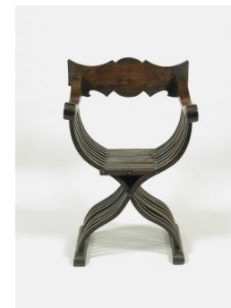
Title: Chair with Shield and Crests Date: 16th or 19th century Primary Maker: Italian, Sixteenth Century Medium: Walnut Dimensions: 40 x 27 1/4 x 22 1/4 in. (101.6 x 69.2 x 56.5 cm)