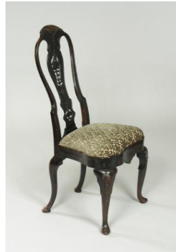
Title: Queen Anne Chair with Reliefs Date: 1702–14 Primary Maker: English, Eighteenth Century Medium: Walnut frame Dimensions: 44 5/16 x 20 1/2 x 17 1/4 in. (112.6 x 52.1 x 43.8 cm)