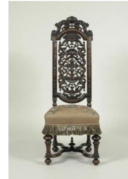
Title: Tallback Side-Chair with Appliquéd Seat Medium: Walnut frame Dimensions: 54 x 21 x 19 1/2 in. (137.2 x 53.3 x 49.5 cm)