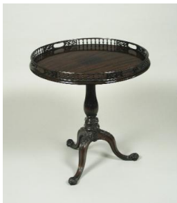
Title: Round Tripod Table Date: 18th century Primary Maker: Thomas Chippendale Medium: Mahogany Dimensions: H.: 32 in. (81.3 cm); diam.: 30 in. (76.2 cm)