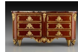
Title: Commode (Chest of Drawers) Date: ca. 1710, with later alterations Primary Maker: André-Charles Boulle Medium: Oak and walnut veneered with kingwood and tulipwood; gilt bronze, Campan Grand Mélange marble Dimensions: 34 1/2 x 66 3/4 x 24 in. (87.6 x 169.5 x 61 cm)