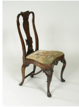
Title: Queen Anne Chair Date: 1702–14 Primary Maker: English, Eighteenth Century Medium: Walnut frame Dimensions: 41 1/8 x 22 1/4 x 19 3/4 in. (104.5 x 56.5 x 50.2 cm)