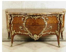
Title: Commode (Chest of Drawers) Date: 1750–55 Primary Maker: Hubert Hansen Medium: Mahogany, kingwood marquetry, amaranth, gilt-bronze mounts, Brèche d'Alep marble on oak Dimensions: 34 3/4 x 64 x 26 in. (88.3 x 162.6 x 66 cm)