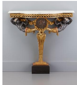
Title: Console Table (one of a pair) Date: ca. 1780 Primary Maker: French, Paris Medium: Beech, walnut, and marble Dimensions: 34 1/8 x 34 3/4 x 9 1/2 in. (86.7 x 88.3 x 24.1 cm)