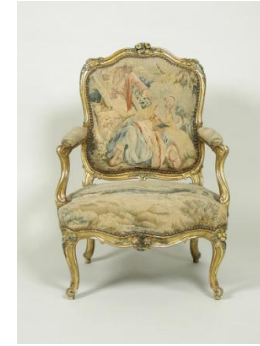
Title: Armchair with Gilt and Polychrome Frame and Beauvais Tapestry Cover Showing Pastoral Scenes (Part of a Set with Three Canapés and Four Armchairs) Date: ca. 1760–65 Primary Maker: Beauvais Tapestry Manufactory Medium: Dyed wool and silk yarns on wool and gilt walnut Dimensions: 36 x 26 x 21 1/2 in. (91.4 x 66 x 54.6 cm) Frames (average): 36 1/4 x 26 1/4 x 27 in. (92.1 x 66.7 x 68.6 cm) Covers (average): backs: 20 3/4 x 18 3/4 in. (52.7 x 47.6 cm) Covers (average): seats: 26 1/2 x 30 in. (67.3 x 76.2 cm)