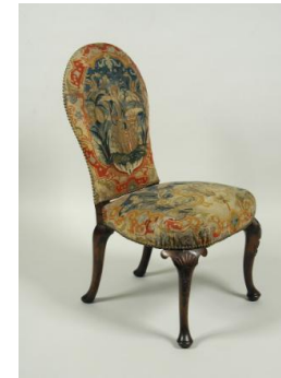
Title: Queen Anne Chair with Needlepoint Upholstery Date: 1702–14 Primary Maker: English, Eighteenth Century Medium: Walnut frame Dimensions: 40 x 21 in. (101.6 x 53.3 cm)