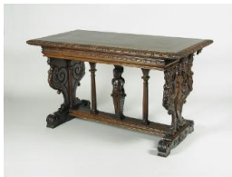
Title: Center Table with Figural and Columnar Supports Date: 16th and 19th century Primary Maker: French, Sixteenth Century Medium: Walnut Dimensions: 35 x 59 5/8 x 33 3/4 in. (88.9 x 151.4 x 85.7 cm)