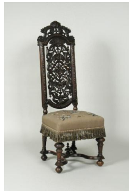
Title: Tallback Side-Chair with Appliquéd Seat Medium: Walnut frame Dimensions: 54 x 21 x 19 1/2 in. (137.2 x 53.3 x 49.5 cm)