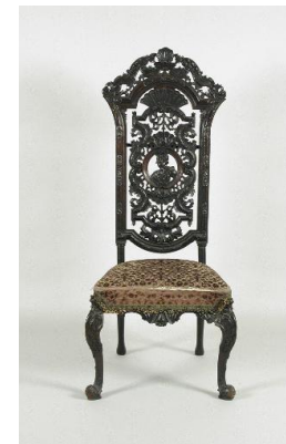
Title: Tallback Side-Chair Date: early 20th century Primary Maker: White Allom Ltd., London Medium: Walnut Dimensions: 54 x 24 x 20 1/2 in. (137.2 x 61 x 52.1 cm)