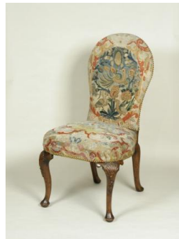
Title: Queen Anne Chair with Needlepoint Upholstery Date: 1702–14 Primary Maker: English, Eighteenth Century Medium: Walnut frame Dimensions: 40 x 22 x 20 in. (101.6 x 55.9 x 50.8 cm)