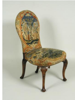
Title: Queen Anne Chair with Needlepoint Upholstery Date: 1702–14 Primary Maker: English, Eighteenth Century Medium: Walnut frame Dimensions: 40 x 22 x 20 in. (101.6 x 55.9 x 50.8 cm)