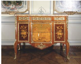
Title: Commode (Chest of Drawers) Date: ca. 1775 Primary Maker: André-Louis Gilbert Medium: Marquetry, ivory, tulipwood border, mounts of gilt bronze and marble on oak Dimensions: 33 7/8 x 45 5/8 x 20 1/2 in. (86 x 115.9 x 52.1 cm)