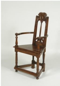
Title: Armchair with Scrollwork Cartouche and Open Back Date: late 16th century and 19th century Primary Maker: French, Late Sixteenth Century Medium: Walnut Dimensions: 44 5/8 x 24 1/4 x 20 1/8 in. (113.3 x 61.6 x 51.1 cm)