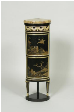
Title: Small Encoignures (Corner Cupboard) with Panels of Black-and Gold Tôle (One of a Pair) Date: 1775–80 Primary Maker: Unknown artist Medium: Ebony veneer, tôle vernie, gilt-bronze mounts, and marble on oak Dimensions: 34 3/8 x 11 3/8 in. (87.3 x 28.9 cm)