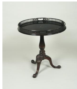
Title: Round Tripod Table Date: 18th century Primary Maker: Thomas Chippendale Medium: Mahogany Dimensions: H.: 32 1/2; diam.: 30 in. (82.6 x 76.2 cm)