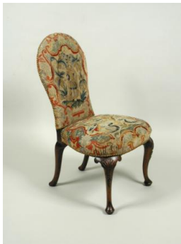
Title: Queen Anne Chair with Needlepoint Upholstery Date: 1702–14 Primary Maker: English, Eighteenth Century Medium: Walnut frame Dimensions: 40 x 22 x 20 in. (101.6 x 55.9 x 50.8 cm)