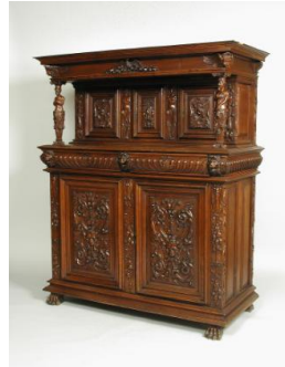
Title: Cabinet with Terms, Masks, and Foliage in Relief Date: 16th and 19th century Primary Maker: French, Sixteenth Century Medium: Walnut, pine and oak Dimensions: 67 1/2 x 56 7/8 x 26 in. (171.5 x 144.5 x 66 cm)