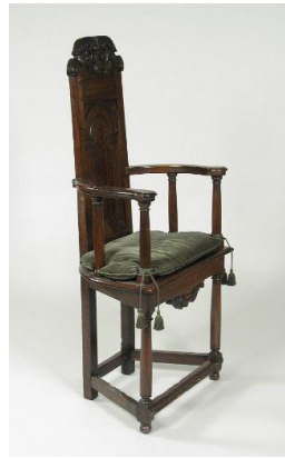
Title: Armchair with Archway in Relief Date: 16th and 19th century Primary Maker: French, Sixteenth Century Medium: Walnut Dimensions: 51 1/2 x 24 1/4 in. (130.8 x 61.6 cm)