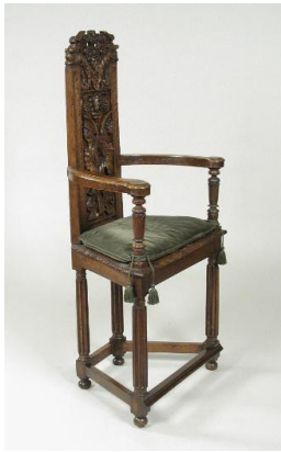
Title: Armchair with Grotesque Reliefs Date: 16th and 19th century Primary Maker: French, Sixteenth Century Medium: Walnut Dimensions: 50 1/2 x 24 7/8 in. (128.3 x 63.2 cm)