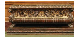
Title: Cassoni with Rinceaux in Relief and Parcel Gilding (One of a Pair) Date: 16th century Primary Maker: Italian, Sixteenth Century Medium: Walnut and gilding Dimensions: 25 x 73 3/8 x 2 7/16 in. (63.5 x 186.4 x 6.2 cm)