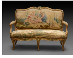
Title: Small Canapé with Gilt and Polychrome Frame and Beauvais Tapestry Cover Showing Pastoral Scenes (Part of a Set with Three Canapés and Four Armchairs) Date: ca. 1760–65 Primary Maker: Beauvais Tapestry Manufactory Medium: Dyed wool and silk yarns on wool and gilt walnut Dimensions: 37 1/8 x 52 5/8 x 29 3/8 in. (94.3 x 133.7 x 74.6 cm) Frame: 37 1/8 x 52 5/8 x 29 3/8 in. (94.3 x 133.7 x 74.6 cm) Covers: back: 21 3/4 x 45 1/4 in. (55.2 x 114.9 cm) Covers: seat: 27 1/2 x 57 in. (69.9 x 144.8 cm)