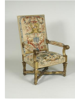
Title: Armchair Showing Grotesque Compositions on Beige or Blue Grounds (Part of a Set of One Canapé and Four Armchairs) Date: between 1675 and 1725 and 19th century Primary Maker: French Medium: Dyed wool and silk yarns on undyed linen canvas and carved gilt-wood frame Dimensions: 52 x 33 3/8 x 30 1/4 in. (132.1 x 84.8 x 76.8 cm)