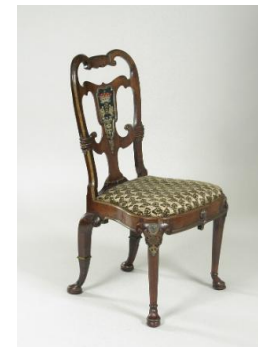
Title: Queen Anne Chair Date: 1702–14 Primary Maker: English, Eighteenth Century Medium: Walnut frame Dimensions: 41 x 22 3/4 x 21 1/4 in. (104.1 x 57.8 x 54 cm)