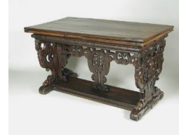
Title: Draw-Top Center Table with Figural and Openwork Supports Date: 16th century (late century) Primary Maker: French, Sixteenth Century Medium: Walnut Dimensions: 34 1/4 x 63 1/2 x 34 3/4 in. (87 x 161.3 x 88.3 cm)