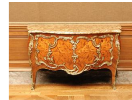
Title: Commode (Chest of Drawers) Date: ca. 1755 Primary Maker: Jacques-Philippe Carel Medium: Mixed woods Dimensions: 34 1/4 x 57 3/4 x 26 in. (87 x 146.7 x 66 cm)