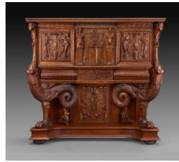
Title: Dressoir Date: ca. 1575, with 19th-century alterations, additions, and restorations Primary Maker: French, probably Lyon Medium: Walnut and beech Dimensions: 63 x 69 5/8 x 22 1/2 in. (160 x 176.8 x 57.2 cm)