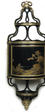
Title: Hanging Corner Cabinet with Panels of Black-and Gold Tôle (One of a Pair) Date: 1775–80 Primary Maker: Unknown artist Medium: Ebony, tulipwood veneer, tôle, gilt bronze, and laquered brass on walnut Dimensions: 33 1/4 x 12 3/4 in. (84.5 x 32.4 cm)