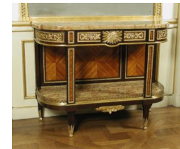
Title: Side Table with Quartered Veneer Date: 19th or early 20th century Primary Maker: Jean-Henri Riesener Medium: Tulipwood, fruitwood, amaranth, gilt-bronze mounts, and Brèche d'Alep marble on oak Dimensions: 34 3/4 x 45 3/8 in. (88.3 x 115.3 cm)