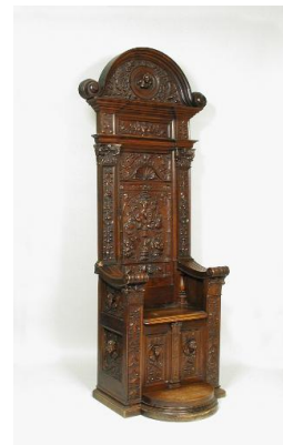
Title: High-Backed Armchair with Grotesque Reliefs and Salient Heads Date: 16th and 19th century Primary Maker: French, Sixteenth Century Medium: Walnut Dimensions: 116 3/4 x 35 3/4 x 20 in. (296.5 x 90.8 x 50.8 cm)