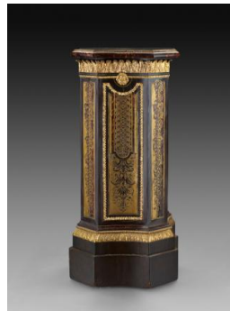
Title: Octagonal Pedestal (One of a Pair) Date: after 1686–1715, with possible late 18th century modifications Primary Maker: André-Charles Boulle Medium: Fir veneered with tortoiseshell and brass marquetry, ebony, and ebonized fruitwood; gilt bronze Dimensions: 45 x 22 1/2 x 22 1/2 in. (114.3 x 57.2 x 57.2 cm)