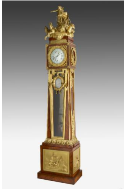
Title: Longcase Regulator Clock Date: 1767 Primary Maker: Balthazar Lieutaud Medium: Oak veneered with various woods including tulipwood, kingwood, and amaranth; gilt bronze, enamel, and marble Dimensions: 100 x 21 3/4 x 13 5/8 in. (254 x 55.2 x 34.6 cm)