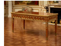
Title: Center Table with Marquetry of Trelliswork and Quatrefoils Date: ca. 1825–35 Primary Maker: French or English Medium: Tulipwood veneer, holly marquetry, plain tulipwood, gilt-bronze mounts on oak Dimensions: 33 1/2 x 70 1/4 x 32 1/2 in. (85.1 x 178.4 x 82.6 cm)