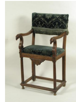
Title: Upholstered Armchair with Ram's-Head Terminals Date: 16th and 19th century Primary Maker: French, Sixteenth Century Dimensions: 41 1/2 x 20 5/8 x 23 1/4 in. (105.4 x 52.4 x 59.1 cm)