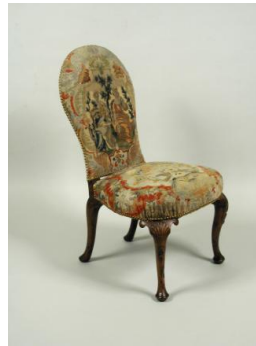
Title: Queen Anne Chair with Needlepoint Upholstery Date: 1702–14 Primary Maker: English, Eighteenth Century Medium: Walnut frame Dimensions: 40 x 22 x 20 in. (101.6 x 55.9 x 50.8 cm)