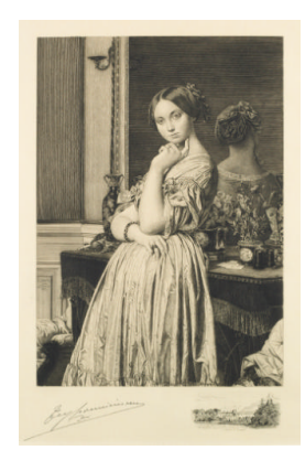
Title: Comtesse d'Haussonville Date: 1889