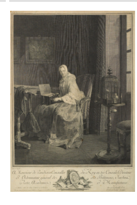
Title: La Serinette (Lady with a Bird-Organ)