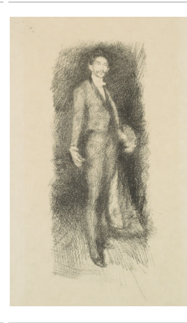
Title: Robert, Comte de Montesquiou-Fezensac

Montesquiou-Fezensac Date: 1891–92 Primary Maker: James McNeill Whistler Medium: Lithograph, printed in black ink on cream color wove paper Dimensions: 8 15/16 x 3 3 /4 in. (22.7 x 9.5 cm)