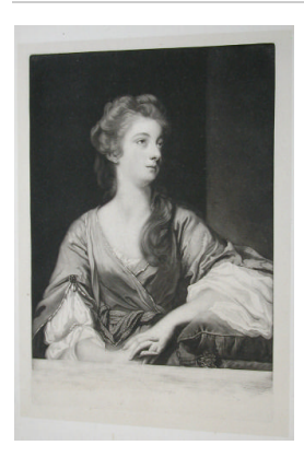
Title: Miss Greenaway, after Sir Joshua Reynolds

Montesquiou-Fezensac Date: 1891–92 Primary Maker: James McNeill Whistler Medium: Lithograph, printed in black ink on cream color wove paper Dimensions: 8 15/16 x 3 3 /4 in. (22.7 x 9.5 cm)