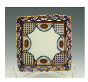
Title: Square Tray with Polychrome Decoration and Openwork Rim Date: 19th century