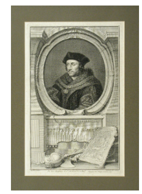
Title: Sir Thomas More

Medium: Oil on canvas Dimensions: 19 1/8 x 30 7 /8 in. (48.6 x 78.4 cm)