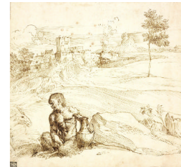
Title: Landscape with a Satyr Date: 16th century Primary Maker: Titian (Tiziano Vecellio) Medium: Pen and brown ink on paper Dimensions: 7 7/16 x 8 1/8 in. (18.9 x 20.6 cm)