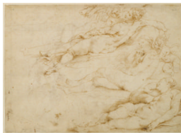
Title: Studies of Venus (?) (recto) ; Studies for a Last Judgment (verso) Date: ca. 1618–20 Primary Maker: Peter Paul Rubens Medium: Pen and brown ink on paper Dimensions: 8 x 11 1/16 in. (20.3 x 28.1 cm)