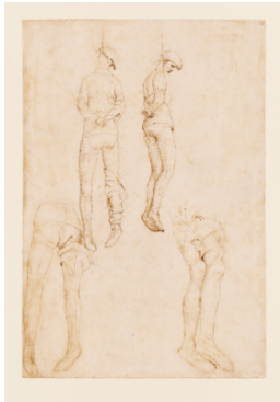
Title: Studies of Men Hanging Date: ca. 1435 Primary Maker: Pisanello (Antonio di Puccio Pisano) Medium: Pen and brown ink, over traces of black chalk Dimensions: 10 5/16 x 7 in. (26.2 x 17.8 cm) Backing Paper: 12 x 7 1/2 in. (30.5 x 19.1 cm)