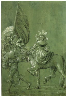
Title: A Lady on Horseback and a Foot Soldier Date: 1522 Primary Maker: Niklaus Manuel Deutsch Medium: Pen with black ink, white gouache, black ink border on gray-green prepared paper Dimensions: 12 5/8 x 8 5/8 in. (32.1 x 21.9 cm)