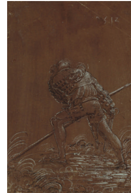
Title: Mercenary Foot Soldier Date: 1512 Primary Maker: Albrecht Altdorfer Medium: Pen and black ink heightened with white gouache on paper prepared with brown wash Dimensions: 5 13/16 x 4 1/16 in. (14.8 x 10.3 cm)