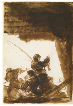
Title: The Anglers Date: 1812–20 Primary Maker: Francisco de Goya y Lucientes Medium: Brush and brown wash on paper Dimensions: 7 3/4 x 5 5/16 in. (19.7 x 13.5 cm)