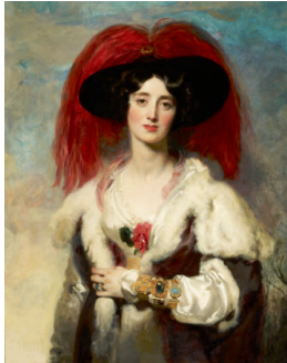
Title: Julia, Lady Peel Date: 1827 Primary Maker: Thomas Lawrence Medium: Oil on canvas Dimensions: 35 3/4 x 27 7/8 in. (90.8 x 70.8 cm)