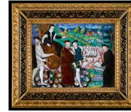
Title: The Triumph of the Eucharist and the Catholic Faith Date: 1561-62 Primary Maker: Léonard Limosin (or Limousin) Medium: Painted enamel on copper, partly gilt Dimensions: 7 3/4 x 10 in. (19.7 x 25.4 cm)