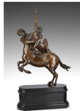
Title: Nessus and Deianira Date: late 16th to early 17th century Primary Maker: Pietro Tacca Medium: Bronze Dimensions: H.: 34 3/4 in. (88.3 cm)