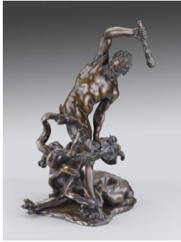
Title: Hercules and the Hydra Date: mid-17th century Primary Maker: French Medium: Bronze Dimensions: H.: 22 3/8 in. (56.8 cm)