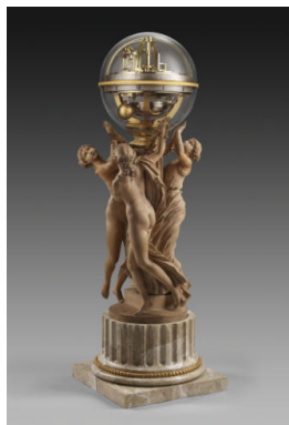
Title: The Dance of Time: Three Nymphs Supporting a Clock Date: 1788 Primary Maker: Clodion (Claude Michel) Medium: Terracotta, brass, gilt brass, silvered brass, steel and glass Dimensions: H. (overall): 40 3/4 in. (103.5 cm) Sculpture: 21 3/8 x 12 3/4 x 8 1/4 in. (54.3 x 32.4 x 21 cm) Globe: diam.: 10 13/16 in. (27.5 cm)