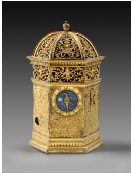
Title: Table Clock Date: ca. 1530 Primary Maker: Pierre de Fobis Medium: Gilt brass and enamel Dimensions: 5 x 2 3/4 x 2 3/4 in. (12.8 x 7 x 7 cm)