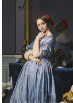
Title: Louise, Princesse de Broglie, Later the Comtesse d'Haussonville Date: 1845 Primary Maker: Jean-Auguste-Dominique Ingres Medium: Oil on canvas Dimensions: 51 7/8 x 36 1/4 in. (131.8 x 92.1 cm)