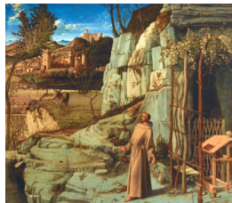
Title: St. Francis in the Desert Date: ca. 1475–80 Primary Maker: Giovanni Bellini Medium: Oil on panel Dimensions: Panel: 49 1/16 x 55 7/8 in. (124.6 x 142 cm) Image: 48 7/8 x 55 5/16 in. (124.1 x 140.5 cm)