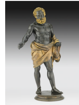
Title: Hercules Date: probably 1499 Primary Maker: Antico (Pier Jacopo Alari Bonacolsi) Medium: Bronze, partial gilding and silvering Dimensions: 15 1/8 x 8 3/8 x 4 3/4 in. (38.4 x 21.3 x 12.1 cm)