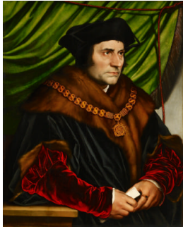
Title: Sir Thomas More Date: 1527 Primary Maker: Hans Holbein the Younger Medium: Oil on oak panel Dimensions: 29 1/2 x 23 3/4 in. (74.9 x 60.3 cm)