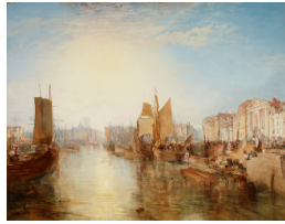
Title: Harbor of Dieppe: Changement de Domicile Date: exhibited 1825, but subsequently dated 1826 Primary Maker: Joseph Mallord William Turner Medium: Oil on canvas Dimensions: 68 3/8 x 88 3/4 in. (173.7 x 225.4 cm)