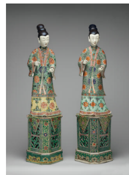
Title: Two Figures of Ladies on Stands Date: 1662-1722 Primary Maker: Chinese, Qing Dynasty (1644-1911), Kangxi Period (1662-1722) Medium: Hard-paste porcelain with polychrome overglaze Dimensions: 38 x 10 1/4 x 10 1/4 in. (96.5 x 26 x 26 cm)