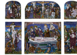
Title: Double-Tiered Triptych: Scenes from the Passion of Christ Date: mid-16th century Primary Maker: Nardon Pénicaud Medium: Painted enamel on copper, partly gilded Dimensions: 14 x 16 in. (35.6 x 40.6 cm) Upper central plaque: 5 1/2 x 11 in. (14 x 27.9 cm) Upper wings: 5 3/4 x 4 3/4 in. (14.6 x 12.1 cm) Lower central plaque: 9 7/8 x 11 3/8 in. (25.1 x 28.9 cm) Lower wings: 9 3/4 x 5 in. (24.8 x 12.7 cm)