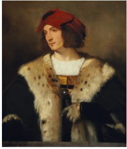
Title: Portrait of a Man in a Red Hat Date: ca. 1520 Primary Maker: Titian (Tiziano Vecellio) Medium: Oil on canvas Dimensions: 32 1/4 x 28 x 3/4 in. (81.9 x 71.1 x 1.9 cm)