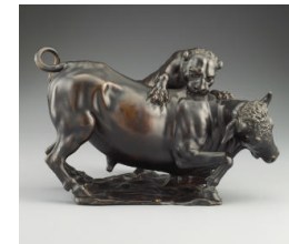
Title: A Leopard Attacking a Bull Date: ca. 1630–40 Primary Maker: Giovanfrancesco Susini Medium: Bronze Dimensions: 11 1/16 x 11 x 9 3/8 in. (28.1 x 27.9 x 23.8 cm)