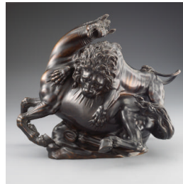
Title: A Lion Attacking a Horse Date: ca. 1630–40 Primary Maker: Giovanfrancesco Susini Medium: Bronze Dimensions: 9 1/2 x 9 13/16 x 11 13/16 in. (24.2 x 25 x 30 cm)