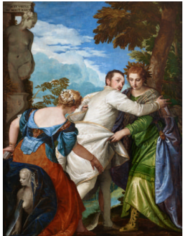
Title: The Choice Between Virtue and Vice Date: ca. 1565 Primary Maker: Paolo Veronese (Paolo Caliari) Medium: Oil on canvas Dimensions: 86 1/4 x 66 3/4 in. (219.1 x 169.5 cm)