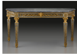
Title: Side Table Date: 1781 Primary Maker: Pierre Gouthière Medium: Blue Turquin marble and gilt-bronze mounts Dimensions: 37 1/2 x 81 1/8 x 27 in. (95.3 x 206.1 x 68.6 cm)