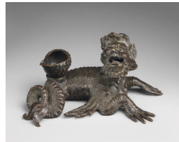
Title: Sea-Monster Date: ca. 1510 Primary Maker: Severo da Ravenna (Severo Calzetta) Medium: Bronze Dimensions: 4 1/2 x 9 3/4 x 6 3/4 in. (11.4 x 24.8 x 17.1 cm)