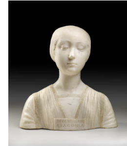
Title: Beatrice of Aragon Date: Probably 1472-74 Primary Maker: Francesco Laurana Medium: Marble Dimensions: 16 x 15 7/8 x 8 in. (40.6 x 40.3 x 20.3 cm)