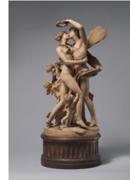
Title: Zephyrus and Flora Date: 1799 Primary Maker: Clodion (Claude Michel) Medium: Terracotta Dimensions: 23 x 10 1/4 x 11 1/2 in. (58.4 x 26 x 29.2 cm)