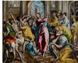
Title: Purification of the Temple Date: ca. 1600 Primary Maker: El Greco (Doménikos Theotokópoulos) Medium: Oil on canvas Dimensions: 16 1/2 x 20 5/8 in. (41.9 x 52.4 cm)