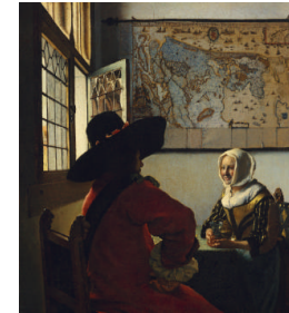
Title: Officer and Laughing Girl Date: ca. 1657 Primary Maker: Johannes Vermeer Medium: Oil on canvas Dimensions: 19 7/8 x 18 1/8 in. (50.5 x 46 cm)