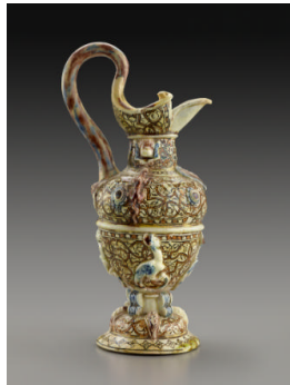
Title: Ewer Date: mid-16th century Primary Maker: Saint-Porchaire Ware Medium: Glazed earthenware Dimensions: 9 x 4 1/2 x 3 1/4 in. (22.9 x 11.4 x 8.3 cm)