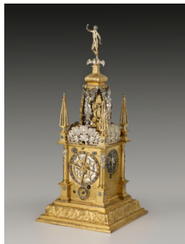
Title: Table Clock with Astronomical and Calendrical Dials Date: probably 1653 Primary Maker: David Weber Medium: Gilt brass and silver Dimensions: 23 3/8 x 10 1/16 x 9 7/8 in. (59.4 x 25.5 x 25.1 cm)