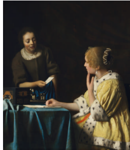
Title: Mistress and Maid Date: ca. 1666–67 Primary Maker: Johannes Vermeer Medium: Oil on canvas Dimensions: 35 1/2 x 31 in. (90.2 x 78.7 cm)