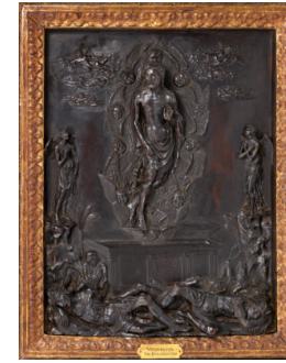
Title: The Resurrection Date: 1472 Primary Maker: Vecchietta (Lorenzo di Pietro) Medium: Bronze Dimensions: 21 3/8 x 16 1/4 in. (54.3 x 41.3 cm)