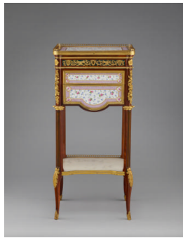
Title: Mechanical Table Date: ca. 1780 Primary Maker: Martin Carlin Medium: Oak veneered with maple; plaques of soft-paste porcelain; gilt bronze Dimensions: 45 3/4 x 14 1/8 x 10 3/4 in. (116.2 x 35.9 x 27.3 cm)