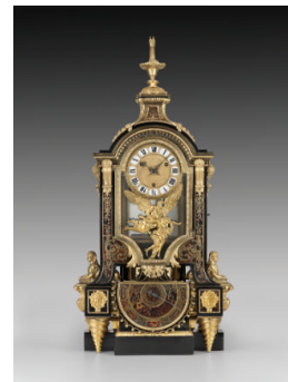
Title: Barometer Clock Date: ca. 1690-1700 Primary Maker: André-Charles Boulle Medium: Ebony, turtle shell, brass, gilt bronze, and enamel Dimensions: 45 1/4 x 23 1/8 x 10 1/4 in. (114.9 x 58.7 x 26 cm)