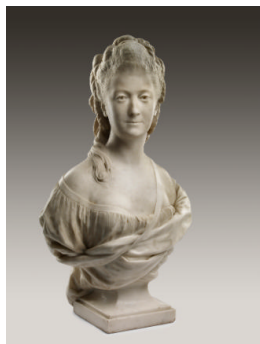
Title: Madame His Date: 1775 Primary Maker: Jean-Antoine Houdon Medium: Marble Dimensions: 31 1/2 x 17 x 12 1/2 in. (80 x 43.2 x 31.8 cm)