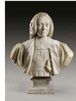
Title: Armand-Thomas Hue, Marquis de Miromesnil Date: 1777 Primary Maker: Jean-Antoine Houdon Medium: Marble Dimensions: 25 1/2 x 22 1/16 x 13 3/4 in. (64.8 x 56 x 35 cm)