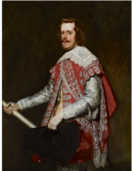
Title: King Philip IV of Spain Date: 1644 Primary Maker: Diego Rodríguez de Silva y Velázquez Medium: Oil on canvas Dimensions: 51 1/8 x 39 1/8 in. (129.9 x 99.4 cm)