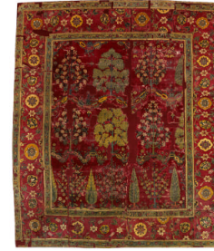
Title: Carpet with Trees Date: ca. 1630 Primary Maker: Mughal India (1526-1857) Medium: Silk (warp and weft) and pashmina (pile) Dimensions: 89 5/16 x 75 5/8 in. (226.9 x 192.1 cm)