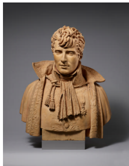
Title: Portrait of Étienne Vincent de Margnolas Date: 1809 Primary Maker: Joseph Chinard Medium: Terracotta Dimensions: 25 3/16 x 25 3/16 x 14 15/16 in. (64 x 64 x 38 cm)