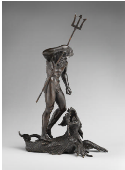
Title: Neptune on a Sea-Monster Date: early 16th century (probably before 1511) Primary Maker: Severo da Ravenna (Severo Calzetta) Medium: Bronze Dimensions: 13 3/8 x 11 1/2 in. (34 x 29.2 cm)