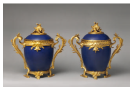
Title: Pair of Mounted Covered Jars Date: 1745-49 Primary Maker: Chinese, Qing Dynasty (1644-1911) Medium: Hard-paste porcelain and gilt bronze Dimensions: 17 7/8 x 18 5/8 x 10 11/16 in. (45.4 x 47.3 x 27.1 cm)