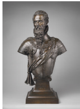
Title: Don Fernando Álvarez de Toledo, Third Duke of Alba Date: 1571 Primary Maker: Jacques Jonghelinck Medium: Bronze Dimensions: 46 x 26 3/4 x 15 in. (116.8 x 67.9 x 38.1 cm)