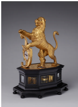
Title: Automaton Lion Clock Date: 1640 Primary Maker: Christoph Miller Medium: Gilt bronze and ebony on oak Dimensions: 13 5/16 x 9 1/2 x 6 9/16 in. (33.8 x 24.1 x 16.7 cm)