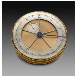
Title: Double-Dial Desk Watch Showing Decimal and Traditional Time Date: ca. 1795-after 1807 Primary Maker: Abraham-Louis Breguet Medium: Gold, enamel, gilt brass, brass, and steel Dimensions: 2 7/8 x 2 7/8 x 13/16 in. (7.3 x 7.3 x 2 cm) H.: 15/16 in. (2.4 cm), diam.: 2 7/8 in. (7.3 cm)