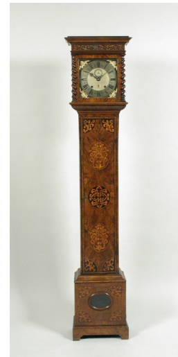
Title: Longcase Clock Date: 1685 Primary Maker: Edward East Medium: Walnut on oak and mahogany? Dimensions: 79 1/2 x 16 1/8 x 9 in. (201.9 x 40.9 x 22.9 cm)