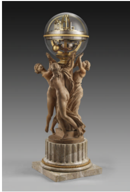
Title: The Dance of Time Time: Three Nymphs Supporting a Clock Date: 1788 Primary Maker: Clodion (Claude Michel) Medium: Terracotta, brass, gilt brass, silvered brass, steel and glass Dimensions: H. (overall): 40 3/4 in. (103.5 cm) Sculpture: 21 3/8 x 12 3/4 x 8 1/4 in. (54.3 x 32.4 x 21 cm) Globe: diam.: 10 13/16 in. (27.5 cm)