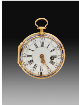
Title: Pocket Watch Date: ca. 1750 Primary Maker: Julien Le Roy Medium: Gold and enamel Dimensions: 2 1/4 x 1 3/4 x 1 3/4 in. (5.8 x 4.5 x 4.4 cm)