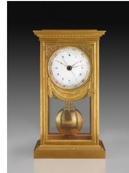
Title: Mantel Regulator Clock Showing Mean and Solar Time Date: 1792 Primary Maker: Robert Robin Medium: Gilt brass, steel, polychrome enamel and gold on gilt brass and bronze Dimensions: 16 5/8 x 9 3/8 x 7 5/8 in. (42.2 x 23.8 x 19.4 cm)