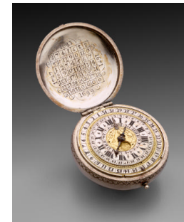
Title: Silver Case Verge Watch Date: 1643 Primary Maker: Robert Grinkin Medium: Silver Dimensions: 2 3/4 x 1 7/8 x 7/8 in. (7 x 4.8 x 2.2 cm)