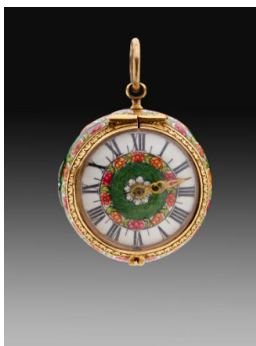
Title: Pendant Watch Date: ca. 1660 Primary Maker: Chavannes le Jeune Medium: Gold and enamel Dimensions: 1 7/8 × 1 5/16 × 1 1/4 in. (4.7 × 3.3 × 3.2 cm)