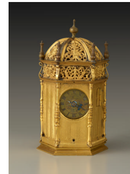
Title: Gilt Brass Table Clock with Later Movement Date: ca. 1550 Primary Maker: French, Sixteenth Century Medium: Gilt brass Dimensions: 5 1/4 × 3 1/16 × 2 3/4 in. (13.3 × 7.7 × 7 cm)