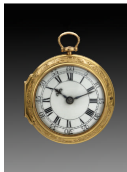
Title: Pocket Watch Date: 1757 Primary Maker: Thomas Mudge Medium: Gold and enamel Dimensions: 2 3/8 × 1 15/16 × 1 3/4 in. (6 × 4.9 × 4.4 cm)