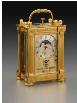
Title: Carriage Clock with Calendar Date: 1811 Primary Maker: Abraham-Louis Breguet Medium: Gilt bronze, silver, and enamel Dimensions: 4 3/8 × 3 5/16 × 2 7/16 in. (11.1 × 8.4 × 6.2 cm)