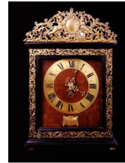
Title: Pendulum Wall Clock Date: ca. 1665 Primary Maker: Nicolas Hanet Medium: Ebony and bronze on walnut and fruitwood Dimensions: 16 7/8 × 10 3/4 × 4 5/8 in. (42.9 × 27.3 × 11.7 cm)