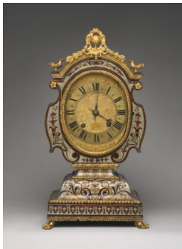
Title: Tête de Poupée Clock Date: ca. 1680–90 Primary Maker: Balthazar Martinot II Medium: Pewter, turtle shell, brass, oak, and pine Dimensions: 21 3/8 × 11 1/8 × 6 7/8 in. (54.4 × 28.2 × 17.5 cm)