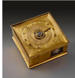
Title: Table Clock Date: ca. 1565 Primary Maker: Flemish Medium: Gilt brass Dimensions: 2 7/16 x 5 3/16 x 5 1/4 in. (6.2 x 13.2 x 13.3 cm)