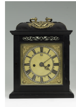
Title: Ebony Bracket Clock Date: 1685 Primary Maker: Joseph Knibb Medium: Ebony on oak Dimensions: 13 3/8 x 9 9/16 x 6 in. (34 x 24.3 x 15.2 cm)