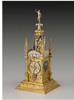
Title: Table Clock with Astronomical and Calendrical Dials Date: probably 1653 Primary Maker: David Weber Medium: Gilt brass and silver Dimensions: 23 3/8 x 10 1/16 x 9 7/8 in. (59.4 x 25.5 x 25.1 cm)