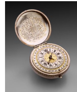
Title: Silver Case Verge Watch Date: 1643 Primary Maker: Robert Grinkin Medium: Silver Dimensions: 2 3/4 x 1 7/8 x 7/8 in. (7 x 4.8 x 2.2 cm)