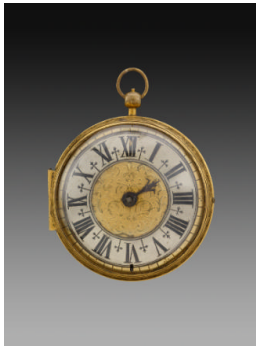
Title: Gilt-Brass Eight-Day Verge Watch Showing Traditional and Canonical Hours Date: ca. 1685 Primary Maker: Jean Hubert Medium: Gilt brass Dimensions: 3 5/16 x 2 9/16 x 1 3/4 in. (8.4 x 6.5 x 4.5 cm)