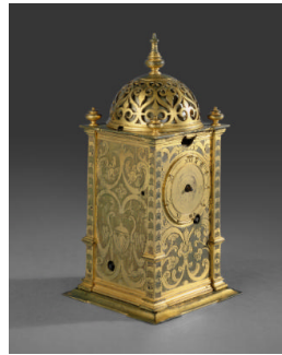
Title: Gilt-Brass Tower Table Clock Date: ca. 1575 Primary Maker: Hans Koch Medium: Cast and sheet gilt brass Dimensions: 7 1/8 x 3 9/16 x 3 9/16 in. (18.1 x 9 x 9 cm)