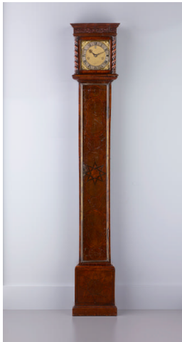
Title: Longcase Clock Date: ca. 1675–80 Primary Maker: Edward East Medium: Olive wood and brass on oak, walnut, and burl wood Dimensions: 79 1/2 × 16 1/8 × 9 in. (201.9 × 41 × 22.9 cm)