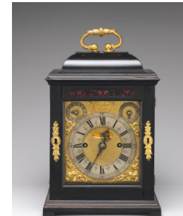
Title: Bracket Clock Date: ca. 1695-97 Primary Maker: George Graham Medium: Ebony and oak Dimensions: 11 5/16 x 6 15/16 x 4 13/16 in. (28.7 x 17.7 x 12.3 cm)