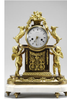
Title: Mantel Clock with Attributes of Ceres, Venus, and Bacchus Date: ca. 1790 Primary Maker: French, Last Quarter of the Eighteenth Century Medium: Case and figures of gilt bronze on white marble plinth Dimensions: 17 3/4 x 13 3/4 x 6 in. (45.1 x 34.9 x 15.2 cm)