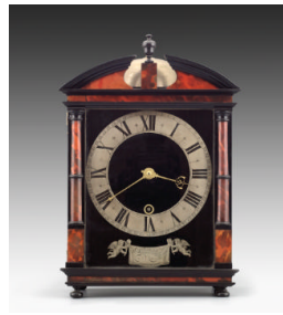
Title: Hague Clock Date: probably ca. 1678–85 Primary Maker: Benjamin Lisle Medium: Silver, tortoiseshell and ebony on oak, ebony, and tortoiseshell Dimensions: 14 1/4 × 9 3/4 × 4 7/8 in. (36.2 × 24.8 × 12.4 cm)