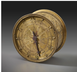
Title: Portable Drum Clock Date: ca. 1550 Primary Maker: German, probably Augsburg Medium: Gilt brass Dimensions: H.: 1 1/2 in. (3.8 cm), diam.: 2 3/8 in. (6 cm)