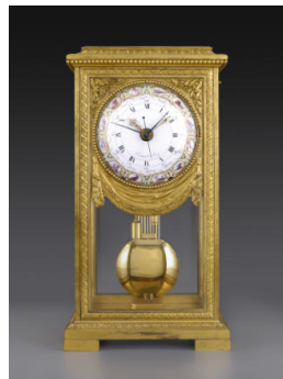
Title: Regulator Clock Showing Mean and Solar Time Date: 1784 Primary Maker: Robert Robin Medium: Gilt brass, steel, polychrome enamel and gold on gilt brass and bronze Dimensions: 16 1/8 x 8 3/4 x 6 13/16 in. (41 x 22.3 x 17.3 cm)