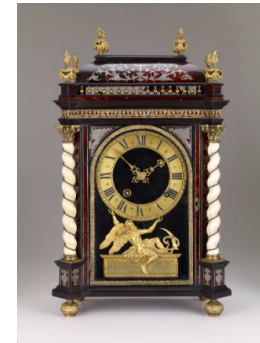
Title: Mantel Clock with Ivory Twist Pillars Date: ca. 1675 Primary Maker: André-Charles Boulle Medium: Ebony, pewter and ivory on oak Dimensions: 24 x 14 7/8 x 7 1/4 in. (61 x 37.8 x 18.4 cm)