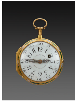
Title: Pocket Watch Date: 1750-55 Primary Maker: François Beeckaert Medium: Gold and enamel Dimensions: 2 1/4 x 1 3/4 x 1 3/4 in. (5.7 x 4.4 x 4.4 cm)