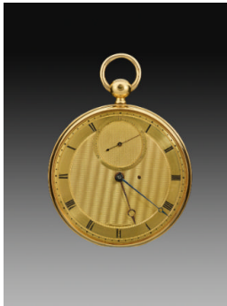
Title: Pocket Watch with Tourbillon Date: ca. 1820 Primary Maker: Abraham-Louis Breguet Medium: Gold, gilt brass, and steel Dimensions: 3 1/8 x 2 5/16 x 2 5/8 in. (8 x 5.9 x 6.7 cm)