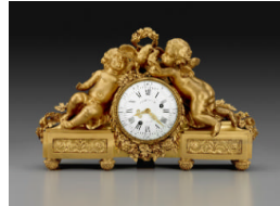
Title: Mantel Clock Date: ca. 1770 Primary Maker: Ferdinand Berthoud Medium: Gilt bronze Dimensions: 16 1/4 x 26 1/4 x 7 7/8 in. (41.3 x 66.7 x 20 cm)