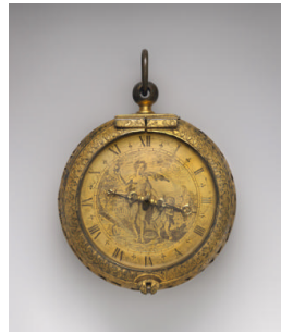
Title: Gilt Brass Coach Clock-Watch Date: 1645 Primary Maker: Pierre Norry Medium: Gilt brass, glass Dimensions: 6 5/8 x 4 7/8 x 2 1/2 in. (16.8 x 12.3 x 6.4 cm)