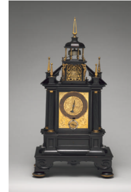
Title: Altar Clock Date: ca. 1635 Primary Maker: Hans Bushman Medium: Ebony and gilt brass Dimensions: 26 7/8 x 13 3/4 x 7 7/8 in. (68.2 x 34.9 x 20 cm)