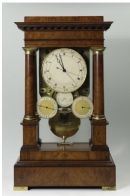
Title: Mantel Regulator Clock Date: ca. 1823 Primary Maker: Charles Mugnier Medium: Gilt brass, brass and steel on oak and mahogany Dimensions: 23 3/8 x 13 3/4 x 9 1/4 in. (59.3 x 34.9 x 23.5 cm)