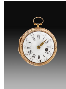
Title: Pendant Watch Date: ca. 1765 Primary Maker: Dutertre Medium: Gold, gilt brass, enamel, and copper Dimensions: 2 3/8 x 1 7/8 x 1 in. (6 x 4.8 x 2.5 cm)