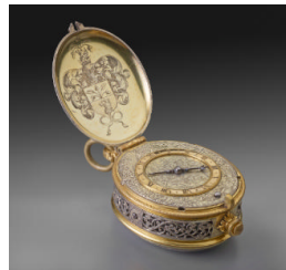
Title: Pendant Clock Date: ca. 1620 Primary Maker: Abraham Gribelin Medium: Silver Dimensions: 3 1/4 x 1 7/8 x 1 1/8 in. (8.3 x 4.7 x 2.9 cm)