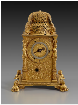
Title: Tower Table Clock Date: ca. 1580 Primary Maker: German, probably Augsburg Medium: Gilt brass Dimensions: 9 3/4 x 7 1/8 x 7 1/8 in. (24.8 x 18.1 x 18.1 cm)