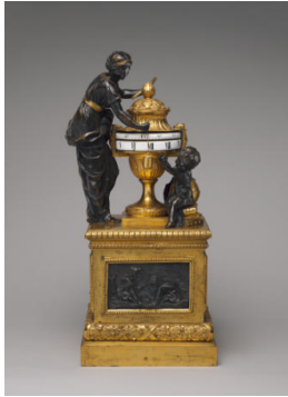
Title: Annular Mantel Clock with Figures Emblematic of the Passing of Time Date: ca. 1770 Primary Maker: French, Eighteenth Century Medium: Gilt bronze on wood Dimensions: 21 1/4 x 10 1/2 in. (54 x 26.7 cm)