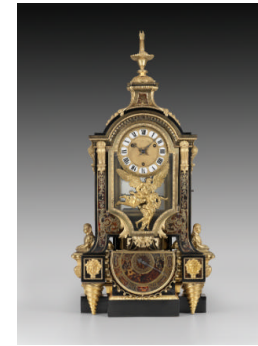
Title: Barometer Clock Date: ca. 1690-1700 Primary Maker: André-Charles Boulle Medium: Ebony, turtle shell, brass, gilt bronze, and enamel Dimensions: 45 1/4 x 23 1/8 x 10 1/4 in. (114.9 x 58.7 x 26 cm)