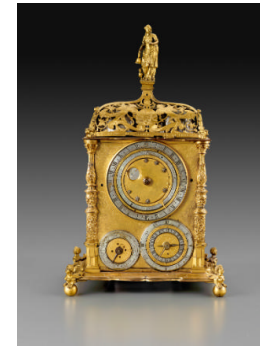
Title: Clock with Astronomical and Calendrical Dials Date: 1554 Primary Maker: Veyt Schaufel Medium: Gilt brass Dimensions: 12 3/8 x 7 3/8 x 5 3/16 in. (31.4 x 18.8 x 13.2 cm)