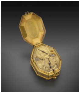
Title: Calendrical and Astronomical Pendant Watch Date: ca. 1625 Primary Maker: George Smith Medium: Silver and gilt brass Dimensions: 2 7/16 x 1 7/16 x 1 in. (6.2 x 3.6 x 2.5 cm)