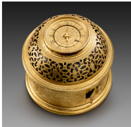
Title: Gilt-Brass Drum Table Clock Date: ca. 1575 Primary Maker: Pierre Auvray Medium: Gilded brass on brass Dimensions: 4 1/8 x 5 x 5 in. (10.5 x 12.7 x 12.7 cm)