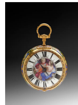
Title: Pendant Watch Date: ca. 1685 Primary Maker: Henry Arlaud Medium: Gold and enamel Dimensions: 2 5/16 × 1 5/8 × 15/16 in. (5.9 × 4.1 × 2.4 cm)