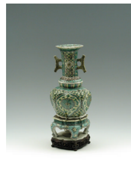
Title: Jar (One of a Five Piece Set with Famille Verte Decoration) Date: 1644–1911 Primary Maker: Chinese, Qing Dynasty (1644–1911) Medium: Famille verte porcelain Dimensions: H.: 8 5/8 in. (21.9 cm)