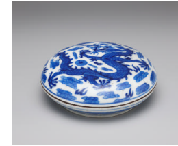
Title: Seal Box with Cover Date: 19th century Primary Maker: Chinese, Qing Dynasty (1644–1911) Medium: Hard-paste porcelain with underglaze blue Dimensions: 1 1/4 x 3 1/4 in. (3.1 x 8.2 cm)