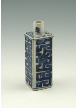
Title: Snuff Bottle Date: 18th century Primary Maker: Chinese, Qing Dynasty (1644–1911) Medium: Hard-paste porcelain with underglaze blue Dimensions: 2 5/8 x 1 x 1 in. (6.7 x 2.6 x 2.6 cm)