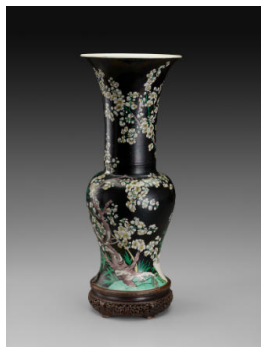
Title: Tall Vase with Black Ground Date: probably 19th century Primary Maker: Chinese, Qing Dynasty (1644–1911) Medium: Famille noire porcelain Dimensions: 16 3/4 x 7 1/8 in. (42.5 x 18.1 cm)