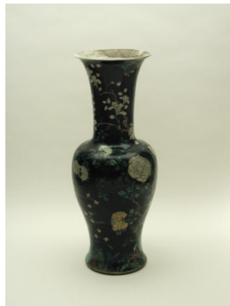
Title: Tall Vase with Black Ground Date: probably 19th century Primary Maker: Chinese, Qing Dynasty (1644–1911) Medium: Famille noire porcelain Dimensions: 27 1/4 x 10 1/2 in. (69.2 x 26.7 cm)