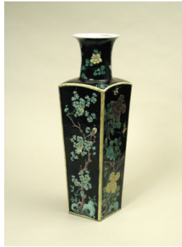
Title: Two Square Vases Date: probably 19th century Primary Maker: Chinese, Qing Dynasty (1644–1911) Medium: Famille noire porcelain Dimensions: H.: 19 1/4 in. (48.9 cm)