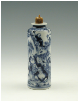
Title: Snuff Bottle Date: 18th century Primary Maker: Chinese, Qing Dynasty (1644–1911) Medium: Hard-paste porcelain with underglaze blue Dimensions: 3 1/4 x 1 1/8 in. (8.2 x 2.9 cm)