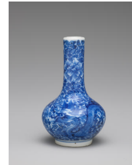
Title: Bottle-Shaped Vase (One of a Pair) Date: 18th century Primary Maker: Chinese, Qing Dynasty (1644–1911) Medium: Hard-paste porcelain with underglaze blue Dimensions: 2 3/4 x 1 5/8 in. (7 x 4.1 cm)