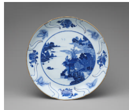
Title: Dish with Foliate Rim Date: 18th century Primary Maker: Chinese, Qing Dynasty (1644–1911) Medium: Hard-paste porcelain with underglaze blue Dimensions: 1 7/8 x 11 in. (4.8 x 27.9 cm)