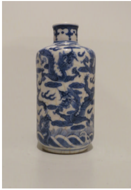
Title: Miniature Vase Date: 18th century Primary Maker: Chinese, Qing Dynasty (1644–1911) Medium: Hard-paste porcelain with underglaze blue Dimensions: 3 1/16 x 1 7/16 in. (7.7 x 3.7 cm)