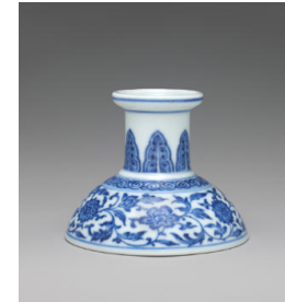
Title: Low Candlestick (One of a Pair) Date: 18th century Primary Maker: Chinese, Qing Dynasty (1644–1911) Medium: Hard-paste porcelain with underglaze blue Dimensions: 2 3/8 x 2 7/8 in. (6 x 7.3 cm)