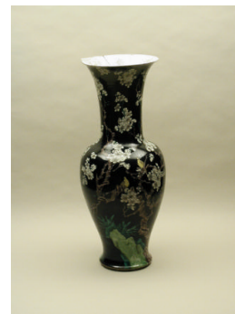
Title: Pair of Vases Date: probably 19th century Primary Maker: Chinese, Qing Dynasty (1644–1911) Medium: Famille noire porcelain Dimensions: 26 1/4 x 10 3/4 in. (66.7 x 27.3 cm)