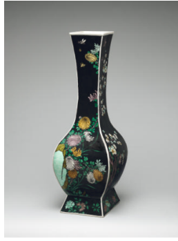
Title: Quadrilateral Vase Date: probably 19th century Primary Maker: Chinese, Qing Dynasty (1644–1911) Medium: Famille noire porcelain on carved wooden base with brass fittings Dimensions: H.: 20 3/4 in. (52.7 cm)