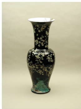
Title: Vase Date: probably 19th century Primary Maker: Chinese, Qing Dynasty (1644–1911) Medium: Famille noire porcelain Dimensions: 27 1/4 x 10 3/4 in. (69.2 x 27.3 cm)