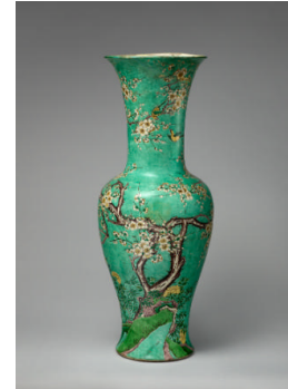
Title: Tall Vase with Green Ground Date: probably 19th century Primary Maker: Chinese, Qing Dynasty (1644–1911) Medium: Famille verte porcelain Dimensions: 27 x 10 in. (68.6 x 25.4 cm)