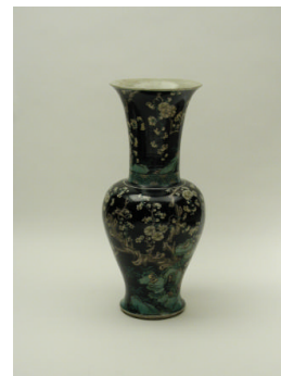
Title: Tall Vase with Black Ground Date: probably 19th century Primary Maker: Chinese, Qing Dynasty (1644–1911) Medium: Famille noire porcelain on wood base with brass fittings Dimensions: 22 1/4 x 10 in. (56.5 x 25.4 cm)