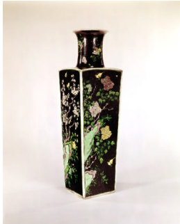
Title: Two Square Vases Date: probably 19th century Primary Maker: Chinese, Qing Dynasty (1644–1911) Medium: Famille noire porcelain Dimensions: H.: 19 1/4 in. (48.9 cm)