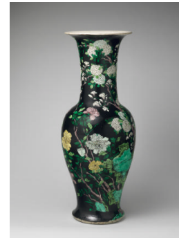
Title: Vase Date: probably 19th century Primary Maker: Chinese, Qing Dynasty (1644–1911) Medium: Famille noire porcelain Dimensions: 27 x 10 1/2 in. (68.6 x 26.7 cm)