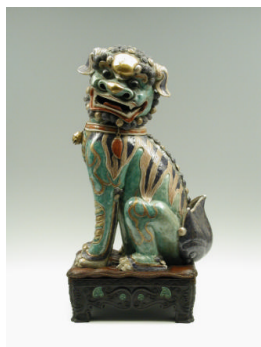
Title: Pair of Lions Date: 18th century Primary Maker: Chinese, Qing Dynasty (1644–1911) Medium: Famille verte porcelain Dimensions: H.: 19 in. (48.3 cm)