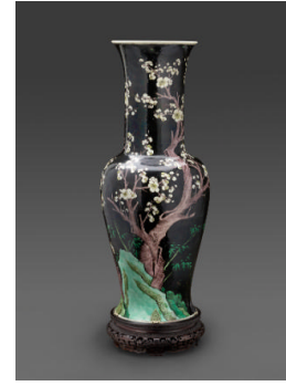
Title: Tall Vase with Black Ground Date: probably 19th century Primary Maker: Chinese, Qing Dynasty (1644–1911) Medium: Famille noire porcelain Dimensions: 24 1/4 x 9 5/8 in. (61.6 x 24.4 cm)