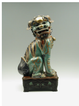
Title: Pair of Lions Date: 18th century Primary Maker: Chinese, Qing Dynasty (1644–1911) Medium: Famille verte porcelain Dimensions: H.: 19 in. (48.3 cm)