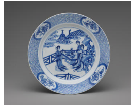
Title: Plate (One of a Set of Four) Date: 1662–1722 Primary Maker: Chinese, Qing Dynasty (1644–1911) Medium: Hard-paste porcelain with underglaze blue Dimensions: 1 5/8 x 10 1/4 in. (4.1 x 26.1 cm)