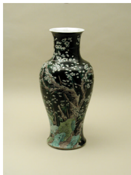
Title: Tall Vase with Black Ground Date: probably 19th century Primary Maker: Chinese, Qing Dynasty (1644–1911) Medium: Famille noire porcelain Dimensions: 17 1/2 x 8 1/8 in. (44.5 x 20.6 cm)