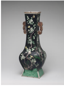
Title: Quadrilateral Vase Date: probably 19th century Primary Maker: Chinese, Qing Dynasty (1644–1911) Medium: Famille noire porcelain on wood base with brass fittings Dimensions: H.: 22 in. (55.9 cm)