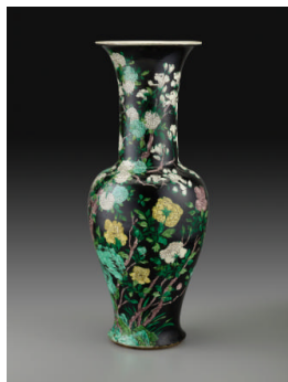
Title: Vase Date: probably 19th century Primary Maker: Chinese, Qing Dynasty (1644–1911) Medium: Hard-paste porcelain with polychrome overglaze Dimensions: H.: 27 in. (68.6 cm), diam.: 11 in. (27.9 cm)