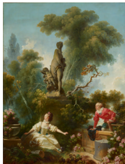
Title: The Progress of Love: The Meeting Date: 1771-72 Primary Maker: Jean-Honoré Fragonard Medium: Oil on canvas Dimensions: 125 x 96 in. (317.5 x 243.8 cm)