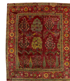
Title: Carpet with Trees Date: ca. 1630 Primary Maker: Mughal India (1526–1857) Medium: Silk (warp and weft) and pashmina (pile) Dimensions: 89 5/16 × 75 5 /8 in. (226.9 × 192.1 cm)