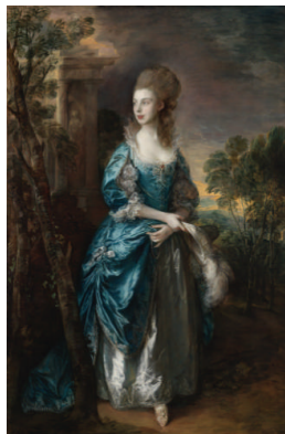
Title: The Hon. Frances Duncombe Date: ca. 1777 Primary Maker: Thomas Gainsborough Medium: Oil on canvas Dimensions: 92 1/4 x 61 1/8 in. (234.3 x 155.3 cm)