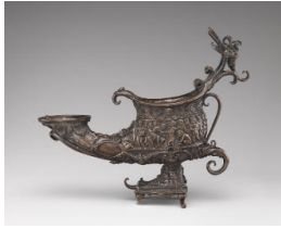
Title: Lamp Date: ca. 1516–24 Primary Maker: Riccio (Andrea Briosco) Medium: Bronze Dimensions: H.: 6 5/8 in. (16.8 cm)