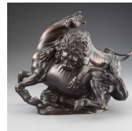
Title: A Lion Attacking a Horse Date: ca. 1630–40 Primary Maker: Giovanfrancesco Susini Medium: Bronze Dimensions: 9 1/2 x 9 13/16 x 11 13/16 in. (24.2 x 25 x 30 cm)