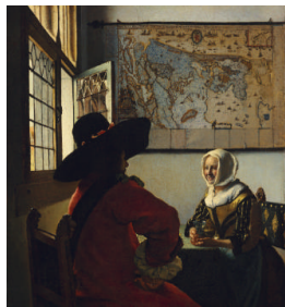
Title: Officer and Laughing Girl Date: ca. 1657 Primary Maker: Johannes Vermeer Medium: Oil on canvas Dimensions: 19 7/8 x 18 1/8 in. (50.5 x 46 cm)