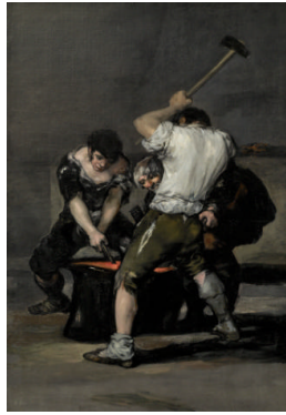
Title: The Forge Date: ca. 1815-20 Primary Maker: Francisco de Goya y Lucientes Medium: Oil on canvas Dimensions: 71 1/2 x 49 1/4 in. (181.6 x 125.1 cm)