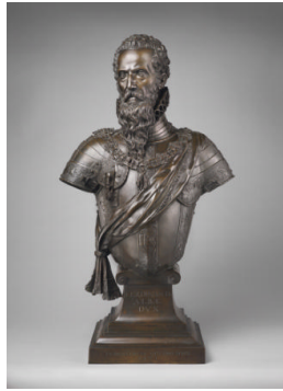
Title: Don Fernando Álvarez de Toledo, Third Duke of Alba Date: 1571 Primary Maker: Jacques Jonghelinck Medium: Bronze Dimensions: 46 × 26 3/4 × 15 in. (116.8 × 67.9 × 38.1 cm)