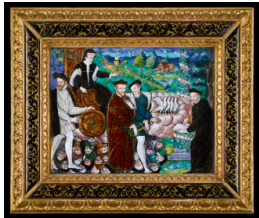
Title: The Triumph of the Eucharist and the Catholic Faith Date: 1561–62 Primary Maker: Léonard Limosin (or Limousin) Medium: Painted enamel on copper, partly gilt Dimensions: 7 3/4 × 10 in. (19.7 × 25.4 cm)