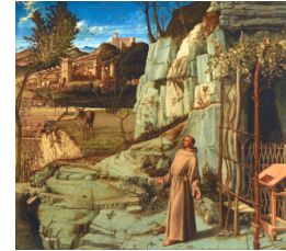
Title: St. Francis in the Desert Date: ca. 1475-80 Primary Maker: Giovanni Bellini Medium: Oil on panel Dimensions: Panel: 49 1/16 x 55 7/8 in. (124.6 x 142 cm) Image: 48 7/8 x 55 5/16 in. (124.1 x 140.5 cm)