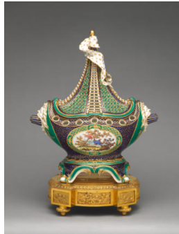
Title: Pot-pourri à Vaisseau Date: 1760 Primary Maker: Sèvres Porcelain Manufactory Medium: Soft-paste porcelain, with later gilt- bronze mount Dimensions: 17 1/2 × 14 7 /8 × 7 1/2 in. (44.5 × 37.8 × 19.1 cm)