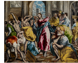
Title: Purification of the Temple Date: ca. 1600 Primary Maker: El Greco (Doménikos Theotokópoulos) Medium: Oil on canvas Dimensions: 16 1/2 x 20 5/8 in. (41.9 x 52.4 cm)