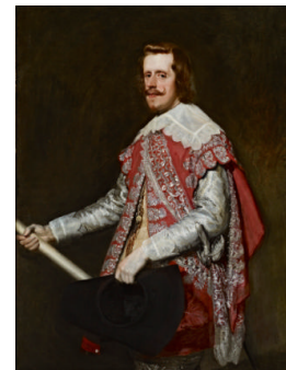
Title: King Philip IV of Spain Date: 1644 Primary Maker: Diego Rodríguez de Silva y Velázquez Medium: Oil on canvas Dimensions: 51 1/8 x 39 1/8 in. (129.9 x 99.4 cm)