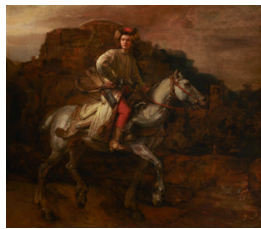
Title: The Polish Rider Date: ca. 1655 Primary Maker: Rembrandt Harmensz. van Rijn Medium: Oil on canvas Dimensions: 46 x 53 1/8 in. (116.8 x 134.9 cm)