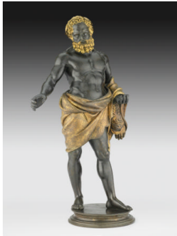
Title: Hercules Date: probably 1499 Primary Maker: Antico (Pier Jacopo Alari Bonacolsi) Medium: Bronze, partial gilding and silvering Dimensions: 15 1/8 x 8 3/8 x 4 3/4 in. (38.4 x 21.3 x 12.1 cm)