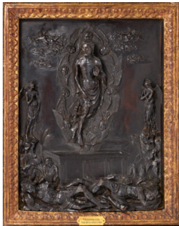
Title: The Resurrection Date: 1472 Primary Maker: Vecchietta (Lorenzo di Pietro) Medium: Bronze Dimensions: 21 3/8 x 16 1/4 in. (54.3 x 41.3 cm)