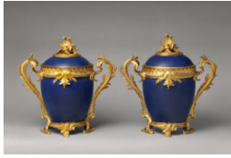
Title: Pair of Mounted Covered Jars Date: 1745–49 Primary Maker: Chinese, Qing Dynasty (1644–1911) Medium: Hard-paste porcelain and gilt bronze Dimensions: 17 7/8 x 18 5/8 x 10 11/16 in. (45.4 x 47.3 x 27.1 cm)