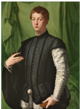
Title: Lodovico Capponi Date: ca. 1550-55 Primary Maker: Agnolo Bronzino (Agnolo di Cosimo) Medium: Oil on panel Dimensions: 45 7/8 x 33 3/4 in. (116.5 x 85.7 cm)