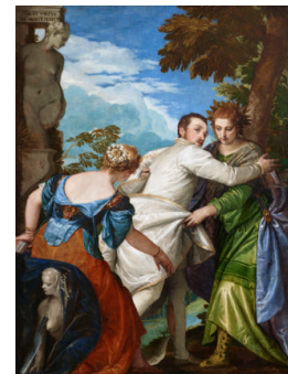
Title: The Choice Between Virtue and Vice Date: ca. 1565 Primary Maker: Paolo Veronese (Paolo Caliari) Medium: Oil on canvas Dimensions: 86 1/4 x 66 3/4 in. (219.1 x 169.5 cm)