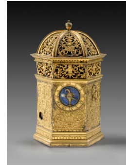
Title: Table Clock Date: ca. 1530 Primary Maker: Pierre de Fobis Medium: Gilt brass and enamel Dimensions: 5 x 2 3/4 x 2 3/4 in. (12.8 x 7 x 7 cm)