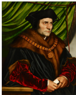
Title: Sir Thomas More Date: 1527 Primary Maker: Hans Holbein the Younger Medium: Oil on oak panel Dimensions: 29 1/2 x 23 3/4 in. (74.9 x 60.3 cm)