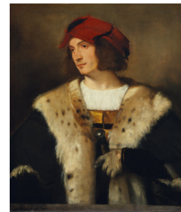
Title: Portrait of a Man in a Red Hat Date: ca. 1520 Primary Maker: Titian (Tiziano Vecellio) Medium: Oil on canvas Dimensions: 32 1/4 x 28 x 3/4 in. (81.9 x 71.1 x 1.9 cm)