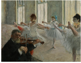
Title: The Rehearsal Date: 1878-79 Primary Maker: Edgar Degas Medium: Oil on canvas Dimensions: 18 3/4 x 24 in. (47.6 x 61 cm)