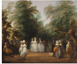
Title: The Mall in St. James's Park Date: ca. 1783 Primary Maker: Thomas Gainsborough Medium: Oil on canvas Dimensions: 47 1/2 x 57 7/8 in. (120.7 x 147 cm)