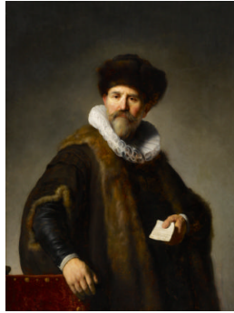
Title: Nicolaes Ruts Date: 1631 Primary Maker: Rembrandt Harmensz. van Rijn Medium: Oil on panel Dimensions: 46 x 34 3/8 in. (116.8 x 87.3 cm)