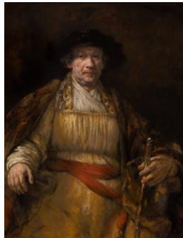
Title: Self-Portrait Date: 1658 Primary Maker: Rembrandt Harmensz. van Rijn Medium: Oil on canvas Dimensions: 52 5/8 x 40 7/8 in. (133.7 x 103.8 cm)