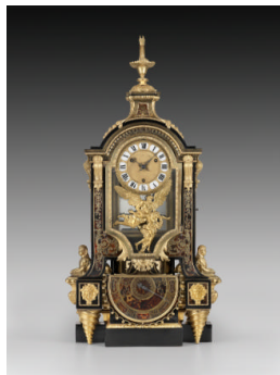
Title: Barometer Clock Date: ca. 1690–1700 Primary Maker: André-Charles Boulle Medium: Ebony, turtle shell, brass, gilt bronze, and enamel Dimensions: 45 1/4 x 23 1/8 x 10 1/4 in. (114.9 x 58.7 x 26 cm)