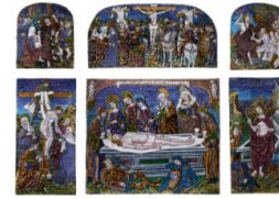
Title: Double-Tiered Triptych: Scenes from the Passion of Christ Date: mid-16th century Primary Maker: Nardon Pénicaud Medium: Painted enamel on copper, partly gilded Dimensions: 14 × 16 in. (35.6 × 40.6 cm) Upper central plaque: 5 1/2 × 11 in. (14 × 27.9 cm) Upper wings: 5 3/4 × 4 3/4 in. (14.6 × 12.1 cm) Lower central plaque: 9 7/8 × 11 3 /8 in. (25.1 × 28.9 cm) Lower wings: 9 3/4 × 5 in. (24.8 × 12.7 cm)