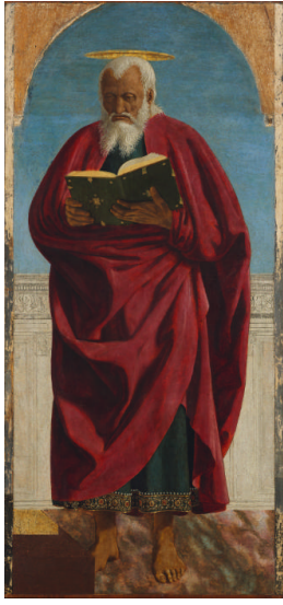
Title: St. John the Evangelist Date: 1454–69 Primary Maker: Piero della Francesca Medium: Tempera on panel Dimensions: 52 3/4 x 24 1/2 in. (134 x 62.2 cm)