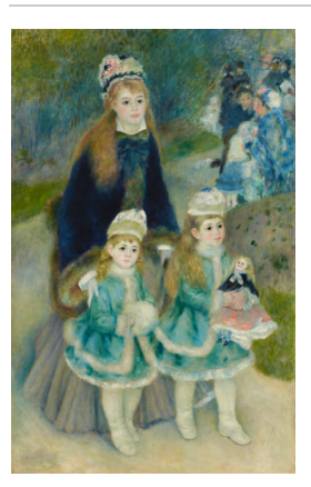
Title: La Promenade Date: 1875-76 Primary Maker: Pierre-Auguste Renoir Medium: Oil on canvas Dimensions: 67 x 42 5/8 in. (170.2 x 108.3 cm)

Medium: Oil on canvas Dimensions: 18 7/8 x 42 7 /8 in. (47.9 x 108.9 cm)