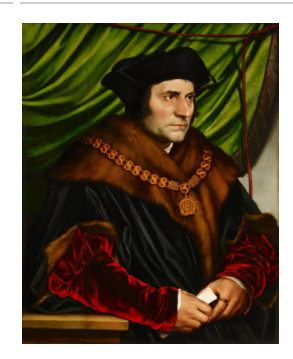
Title: Sir Thomas More Date: 1527 Primary Maker: Hans Holbein the Younger Medium: Oil on oak panel Dimensions: 29 1/2 x 23 3 /4 in. (74.9 x 60.3 cm)

Medium: Oil on canvas Dimensions: 19 7/8 x 18 1 /8 in. (50.5 x 46 cm)