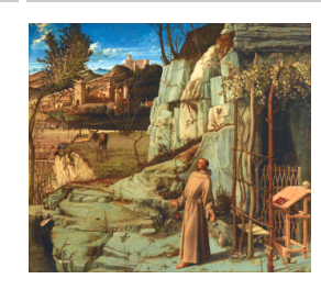
Desert Date: ca. 1475-80 Primary Maker: Giovanni Bellini Medium: Oil on panel