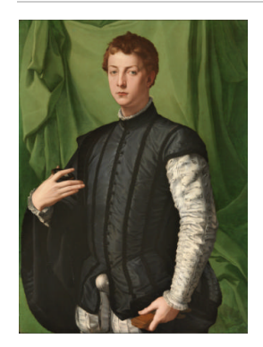
Title: Lodovico Capponi Date: ca. 1550-55 Primary Maker: Agnolo Bronzino (Agnolo di Cosimo) Medium: Oil on panel Dimensions: 45 7/8 x 33 3

Dimensions: Panel: 49 1/16 x 55 7/8 in. (124.6 x 142 cm) Image: 48 7/8 \times 55 5 /16 in. (124.1 \times 140.5 \text{ cm})