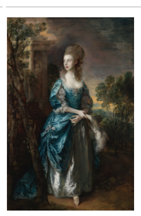
Title: The Hon. Frances Duncombe Date: ca. 1777 Primary Maker: Thomas Gainsborough Medium: Oil on canvas Dimensions: 92 1/4 x 61 1 /8 in. (234.3 x 155.3 cm)