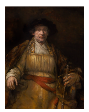
Title: Self-Portrait Date : 1658 Primary Maker: Rembrandt Harmensz. van Rijn Medium: Oil on canvas Dimensions: 52 5/8 x 40 7 /8 in. (133.7 x 103.8 cm)