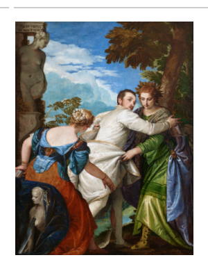
Title: The Choice Between Virtue and Vice Date: ca. 1565 Primary Maker: Paolo Veronese (Paolo Caliari) Medium: Oil on canvas Dimensions: 86 1/4 x 66 3 /4 in. (219.1 x 169.5 cm)