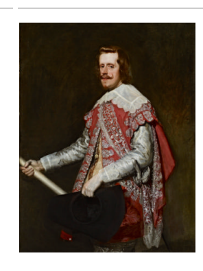
Title: King Philip IV of Spain Date: 1644 Primary Maker: Diego Rodríguez de Silva y Velázguez Medium: Oil on canvas Dimensions: 51 1/8 \times 39 1 /8 in. (129.9 \times 99.4 cm)