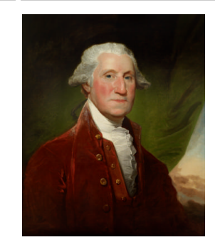
Washington Date: 1795 Primary Maker: Gilbert Stuart Medium: Oil on canvas Dimensions: 29 1/4 x 24 in.