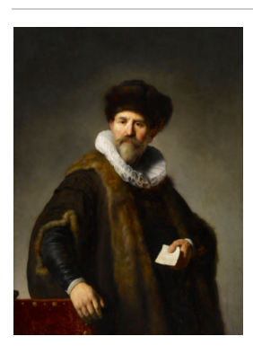
Title: Nicolaes Ruts Date: 1631 Primary Maker: Rembrandt Harmensz. van Rijn Medium: Oil on panel Dimensions: 46 x 34 3/8 in. (116.8 x 87.3 cm)