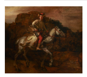
Title: The Polish Rider Date: ca. 1655 Primary Maker: Rembrandt Harmensz. van Rijn Medium: Oil on canvas Dimensions: 46 x 53 1/8 in. (116.8 x 134.9 cm)