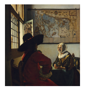
Title: Officer and Laughing Girl Date: ca. 1657 Primary Maker: Johannes