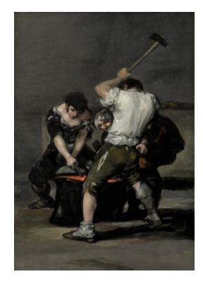
Title: The Forge Date: ca. 1815-20 Primary Maker: Francisco de Goya y Lucientes Medium: Oil on canvas Dimensions: 71 1/2 x 49 1 /4 in. (181.6 x 125.1 cm)