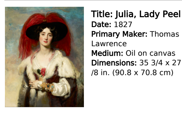
Date: 1827 Primary Maker: Thomas Lawrence Medium: Oil on canvas Dimensions: 35 3/4 x 27 7 /8 in. (90.8 x 70.8 cm)