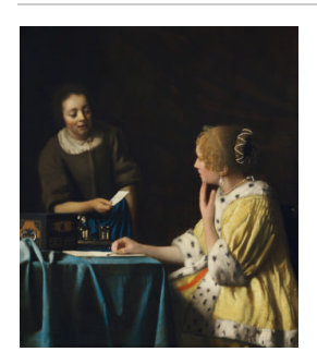
Title: Mistress and Maid Date: ca. 1666-67 Primary Maker: Johannes