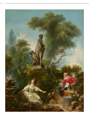
Title: The Progress of Love: The Meeting Date: 1771-72 Primary Maker: Jean-Honoré Fragonard Medium: Oil on canvas Dimensions: 125 x 96 in. (317.5 x 243.8 cm)