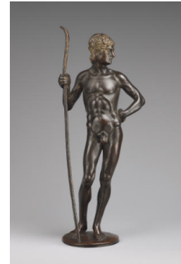
Title: Paris Date: first half of the 16th century Primary Maker: Italian Medium: Bronze, partial gilding Dimensions: H.: 10 3/4 in. (27.3 cm)