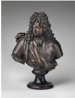
Title: The Grand Dauphin Date: 18th century Primary Maker: François Girardon Medium: Bronze Dimensions: H.: 16 1/4 in. (41.3 cm)