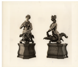
Title: Harpy Bestriding Grotesque Fish Date: late 16th to early 17th century Primary Maker: Italian, Florence Medium: Bronze Dimensions: H.: 8 1/2 in. (21.6 cm)