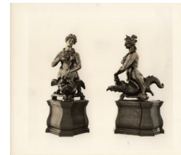
Title: Harpy Bestriding Grotesque Fish Date: late 16th to early 17th century Primary Maker: Italian, Florence Medium: Bronze Dimensions: H.: 8 1/16 in. (20.5 cm)