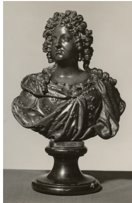
Title: Marie-Thérèse, Queen of France Date: 18th century Primary Maker: François Girardon Medium: Bronze Dimensions: H.: 14 1/4 in. (36.2 cm)