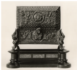
Title: Casket Date: 16th century Primary Maker: Italian Medium: Bronze Dimensions: 4 7/8 x 9 3/4 x 7 1/4 in. (12.4 x 24.8 x 18.4 cm)