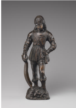
Title: David Date: late 15th to 17th century Primary Maker: Italian Medium: Bronze Dimensions: H.: 10 in. (25.4 cm)