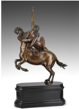
Title: Nessus and Deianira Date: late 16th to early 17th century Primary Maker: Pietro Tacca Medium: Bronze Dimensions: H.: 34 3/4 in. (88.3 cm)