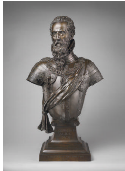
Title: Don Fernando Álvarez de Toledo, Third Duke of Alba Date: 1571 Primary Maker: Jacques Jonghelinck Medium: Bronze Dimensions: 46 x 26 3/4 x 15 in. (116.8 x 67.9 x 38.1 cm)