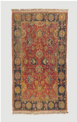
Title: Floral Rug, Herat Date: early 17th century Primary Maker: Persia: Safavid Dynasty Medium: Cotton, wool and senna Dimensions: Without Fringe: 8 1/4 × 4 9/16 ft. (98 3/4 × 54 3/4 in.) With Fringe: 8 1/2 × 4 9/16 ft. (102 1/4 × 54 3/4 in.)