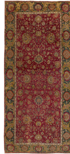
Title: Carpet Date: second half of the 16th century Primary Maker: Persian, Herat Medium: Cotton (warp and weft), wool (weft), and Senna (pile) Dimensions: 21 7/8 × 9 9/16 ft. (262 1/2 × 114 1/2 in.)