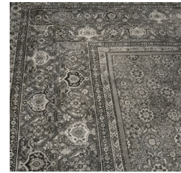
Title: Floral Design Carpet Date: late 18th century Primary Maker: Persian, Eighteenth Century Medium: Wool on linen backing Dimensions: 12 × 17 ft. (144 × 204 in.)