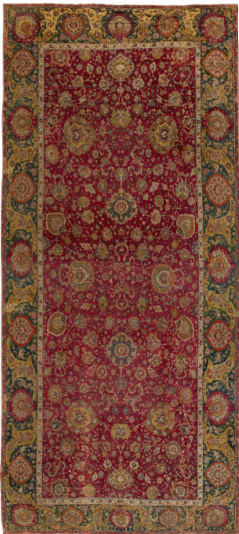
Title: Carpet Date: second half of the 16th century Primary Maker: Persian, Herat Medium: Cotton (warp and weft), wool (weft), and Senna (pile) Dimensions: 21 7/8 × 9 9 /16 ft. (262 1/2 × 114 1/2 in.)