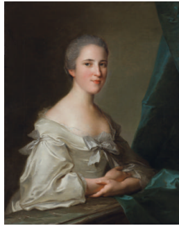
Title: Elizabeth, Countess of Warwick Date: 1754 Primary Maker: Jean-Marc Nattier Medium: Oil on canvas Dimensions: 32 1/8 x 25 3/4 in. (81.6 x 65.4 cm)