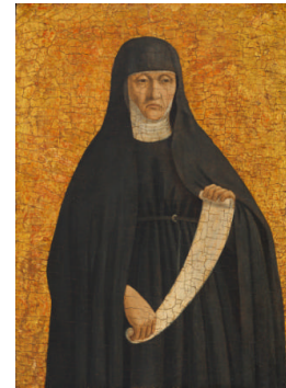
Title: An Augustinian Nun (St. Monica) Date: 1454–69 Primary Maker: Piero della Francesca Medium: Tempera on panel Dimensions: 15 1/4 x 11 in. (38.7 x 27.9 cm)