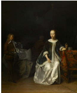
Title: A Lady at Her Toilet Date: 1648–67 Primary Maker: Gabriel Metsu Medium: Oil on canvas Dimensions: 20 3/8 x 16 5/8 in. (51.8 x 42.2 cm)