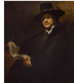
Title: Portrait of a Young Artist Date: 1650s Primary Maker: Rembrandt Harmensz. van Rijn Medium: Oil on canvas Dimensions: 39 1/8 x 35 in. (99.4 x 88.9 cm)