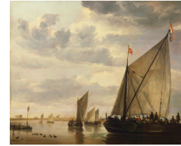
Title: River Scene Date: 17th century Primary Maker: Aelbert Cuyp Medium: Oil on oak panel Dimensions: 23 1/8 × 29 1/8 in. (58.7 × 74 cm)