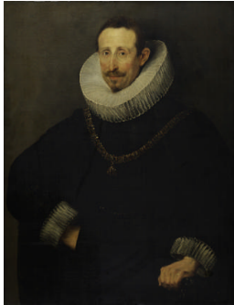
Title: A Knight of the Order of the Golden Fleece Date: early 17th century Primary Maker: Peter Paul Rubens Medium: Oil on canvas Dimensions: 39 3/4 x 30 1/2 in. (101 x 77.5 cm)