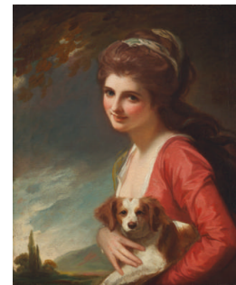
Title: Lady Hamilton as "Nature" Date: 1782 Primary Maker: George Romney Medium: Oil on canvas Dimensions: 29 7/8 x 24 3/4 in. (75.9 x 62.9 cm)