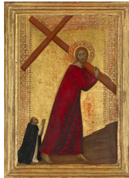
Title: Christ Bearing the Cross, with a Dominican Friar Date: ca. 1350 Primary Maker: Barna da Siena Medium: Tempera on panel Dimensions: 12 x 8 1/2 in. (30.5 x 21.6 cm)