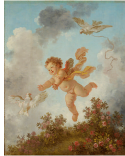
Title: The Progress of Love: Love Pursuing a Dove Date: ca. 1790–91 Primary Maker: Jean-Honoré Fragonard Medium: Oil on canvas Dimensions: 59 5/8 x 47 3/4 in. (151.4 x 121.3 cm)