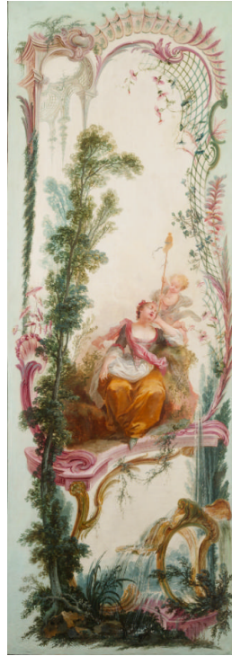
Title: Decorative Panel: Shepherdess Asleep

Dimensions: 58 5/8 x 21 1/2 in. (148.9 x 54.6 cm)