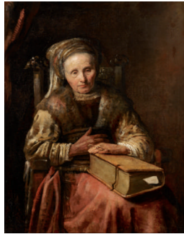
Title: Old Woman with a Book Date: mid-1650s Primary Maker: Carel van der Pluym Medium: Oil on canvas Dimensions: 38 5/8 x 30 3/4 in. (98.1 x 78.1 cm)