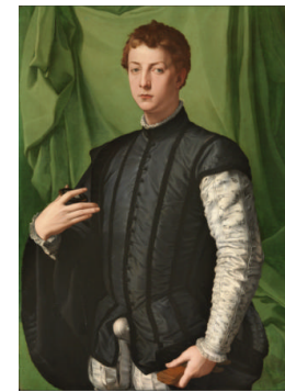
Title: Lodovico Capponi Date: ca. 1550–55 Primary Maker: Agnolo di Cosimo (Bronzino) Medium: Oil on panel Dimensions: 45 7/8 x 33 3/4 in. (116.5 x 85.7 cm)