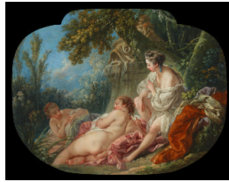
Title: The Four Seasons: Summer Date: 1755 Primary Maker: François Boucher Medium: Oil on canvas Dimensions: 22 1/2 x 28 5/8 in. (57.2 x 72.7 cm)