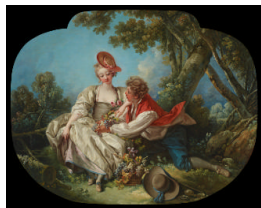
Title: The Four Seasons: Autumn Date: 1755 Primary Maker: François Boucher Medium: Oil on canvas Dimensions: 22 1/4 x 28 3/4 in. (56.5 x 73 cm)