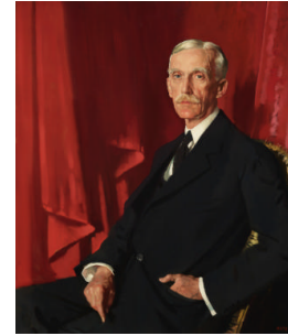
Title: Portrait of Andrew W. Mellon Date: 1924 Primary Maker: William Orpen Medium: Oil on canvas Dimensions: 39 3/4 x 33 in. (101 x 83.8 cm)