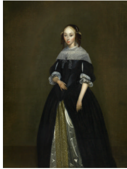
Title: Portrait of a Young Lady Date: ca. 1665–70 Primary Maker: Gerard ter Borch Medium: Oil on canvas Dimensions: 21 1/8 x 16 in. (53.7 x 40.6 cm)