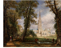
Title: Salisbury Cathedral from the Bishop's Grounds Date: 1826 Primary Maker: John Constable Medium: Oil on canvas Dimensions: 35 × 44 1/4 in. (88.9 × 112.4 cm)