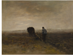
Title: Early Morning Plowing Date: ca. 1875 Primary Maker: Anton Mauve Medium: Oil on canvas Dimensions: 16 7/8 x 22 7/8 in. (42.9 x 58.1 cm)