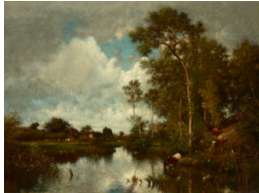
Title: The River Date: 19th century Primary Maker: Jules Dupré Medium: Oil on canvas Dimensions: 17 x 23 in. (43.2 x 58.4 cm)