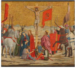
Title: The Crucifixion Date: 1454-69 Primary Maker: Piero della Francesca Medium: Tempera on panel Dimensions: 14 3/4 x 16 3/16 in. (37.5 x 41.1 cm)