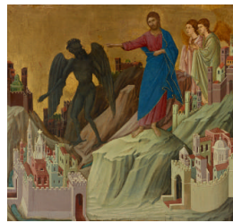
Title: The Temptation of Christ on the Mountain Date: 1308–11 Primary Maker: Duccio di Buoninsegna Medium: Tempera on poplar panel Dimensions: 17 x 18 1/8 in. (43.2 x 46 cm)