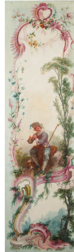
Title: Decorative Panel: The Shepherd's Song

Dimensions: 58 5/8 x 21 1/2 in. (148.9 x 54.6 cm)