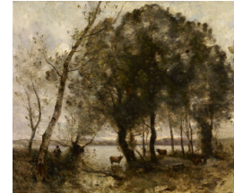
Title: The Lake Date: 1861 Primary Maker: Jean-Baptiste-Camille Corot Medium: Oil on canvas Dimensions: 52 3/8 × 62 in. (133 × 157.5 cm)