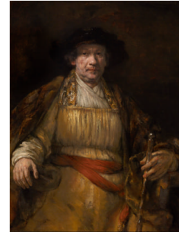
Title: Self-Portrait Date: 1658 Primary Maker: Rembrandt Harmensz. van Rijn Medium: Oil on canvas Dimensions: 52 5/8 x 40 7/8 in. (133.7 x 103.8 cm)