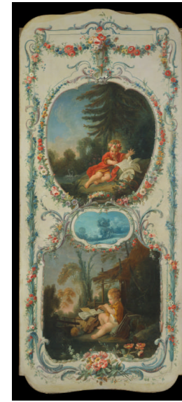
Title: The Arts and Sciences: Poetry and Music Date: ca. 1760 Primary Maker: François Boucher Medium: Oil on canvas Dimensions: 85 1/2 x 38 in. (217.2 x 96.5 cm)