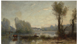
Title: Ville-d'Avray Date: ca. 1860 Primary Maker: Jean-Baptiste-Camille Corot Medium: Oil on canvas Dimensions: 17 1/4 × 29 1/4 in. (43.8 × 74.3 cm)