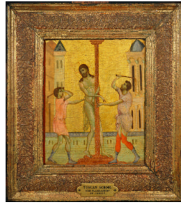
Title: The Flagellation of Christ Date: ca. 1280 Primary Maker: Cimabue (Cenni di Pepo) Medium: Tempera on panel Dimensions: 9 3/4 × 7 7/8 in. (24.8 × 20 cm)