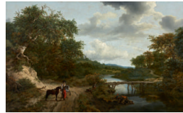
Title: Landscape with a Footbridge Date: 1652 Primary Maker: Jacob van Ruisdael Medium: Oil on canvas Dimensions: 38 3/4 x 62 5/8 in. (98.4 x 159.1 cm)