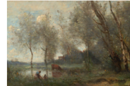
Title: The Pond Date: ca. 1868–70 Primary Maker: Jean-Baptiste-Camille Corot Medium: Oil on canvas Dimensions: 19 1/4 × 29 in. (48.9 × 73.7 cm)