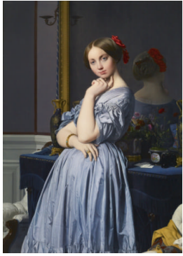
Title: Louise, Princesse de Broglie, Later the Comtesse d'Haussonville