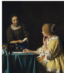
Title: Mistress and Maid Date: ca. 1666–67 Primary Maker: Johannes Vermeer Medium: Oil on canvas Dimensions: 35 1/2 x 31 in. (90.2 x 78.7 cm)