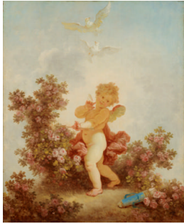
Title: The Progress of Love: Love the Sentinel Date: ca. 1790–91 Primary Maker: Jean-Honoré Fragonard Medium: Oil on canvas Dimensions: 57 5/8 x 47 1/2 in. (146.4 x 120.7 cm)