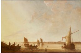
Title: Dordrecht: Sunrise Date: ca. 1650 Primary Maker: Aelbert Cuyp Medium: Oil on canvas Dimensions: 41 3/8 × 63 3/8 in. (105.1 × 161 cm)