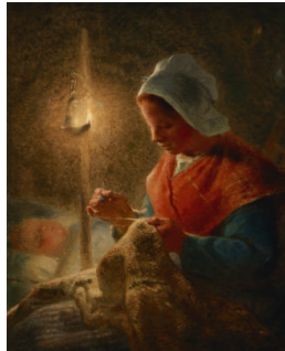
Title: Woman Sewing by Lamplight Date: 1870–72 Primary Maker: Jean-François Millet Medium: Oil on canvas Dimensions: 39 5/8 x 32 1/4 in. (100.6 x 81.9 cm)