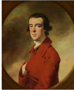
Title: The Hon. Booth Grey Date: 1764 Primary Maker: Francis Cotes Medium: Oil on canvas Dimensions: 29 1/2 × 24 in. (74.9 × 61 cm)