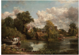
Title: The White Horse Date: 1819 Primary Maker: John Constable Medium: Oil on canvas Dimensions: 51 3/4 × 74 1/8 in. (131.4 × 188.3 cm)