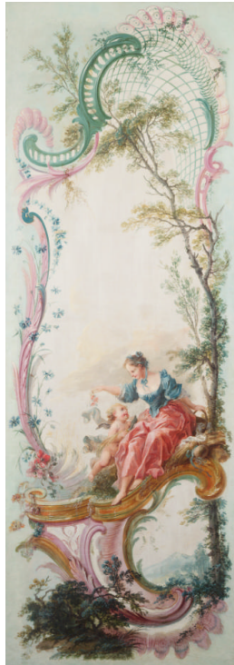
Title: Decorative Panel: Girl with Cupid

Dimensions: 33 x 39 1/2 in. (83.8 x 100.3 cm)