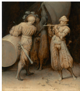
Title: Three Soldiers Date: 1568 Primary Maker: Pieter Bruegel the Elder Medium: Oil on oak panel Dimensions: 8 x 7 in. (20.3 x 17.8 cm)