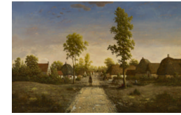
Title: The Village of Becquigny Date: ca. 1857 Primary Maker: Théodore Rousseau Medium: Oil on mahogany panel Dimensions: 25 x 39 3/8 in. (63.5 x 100 cm)