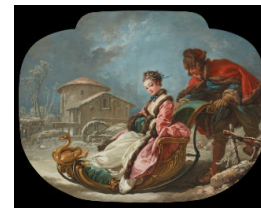
Title: The Four Seasons: Winter Date: 1755 Primary Maker: François Boucher Medium: Oil on canvas Dimensions: 22 3/8 x 28 3/4 in. (56.8 x 73 cm)