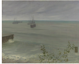
Title: Symphony in Grey and Green: The Ocean Date: 1866 Primary Maker: James McNeill Whistler Medium: Oil on canvas Dimensions: 31 3/4 × 40 1/8 in. (80.6 × 101.9 cm)