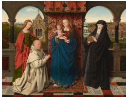
Title: The Virgin and Child with St. Barbara, St. Elizabeth, and Jan Vos Date: ca. 1441–43 Primary Maker: Jan van Eyck Medium: Oil on masonite, transferred from panel Dimensions: 18 5/8 x 24 1/8 in. (47.3 x 61.3 cm)