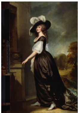
Title: Charlotte, Lady Milnes Date: 1788–92 Primary Maker: George Romney Medium: Oil on canvas Dimensions: 95 1/8 x 58 3/4 in. (241.6 x 149.2 cm)