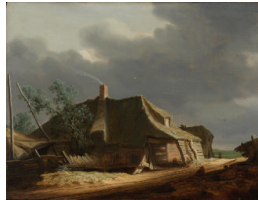
Title: Landscape with Farmhouse Date: 1628 Primary Maker: Salomon van Ruysdael Medium: Oil on panel Dimensions: 12 15/16 × 16 3/4 × 1/2 in. (32.9 × 42.5 × 1.3 cm)