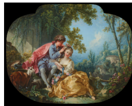
Title: The Four Seasons: Spring Date: 1755 Primary Maker: François Boucher Medium: Oil on canvas Dimensions: 21 3/8 x 28 5/8 in. (54.3 x 72.7 cm)