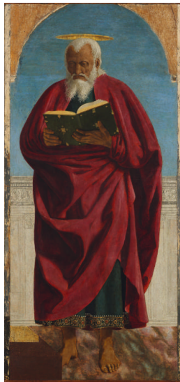
Title: St. John the Evangelist Date: 1454–69 Primary Maker: Piero della Francesca Medium: Tempera on panel Dimensions: 52 3/4 x 24 1/2 in. (134 x 62.2 cm)