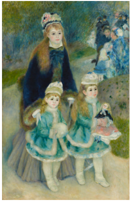
Title: La Promenade Date: 1875–76 Primary Maker: Pierre-Auguste Renoir Medium: Oil on canvas Dimensions: 67 x 42 5/8 in. (170.2 x 108.3 cm)