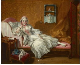
Title: A Lady on Her Day Bed Date: 1743 Primary Maker: François Boucher Medium: Oil on canvas Dimensions: 22 1/2 x 26 7/8 in. (57.2 x 68.3 cm)