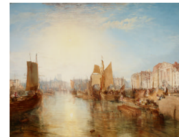
Title: Harbor of Dieppe: Changement de Domicile Date: exhibited 1825, but subsequently dated 1826 Primary Maker: Joseph Mallord William Turner Medium: Oil on canvas Dimensions: 68 3/8 x 88 3/4 in. (173.7 x 225.4 cm)