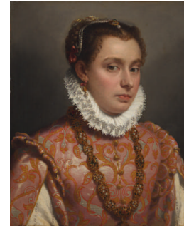
Title: Portrait of a Woman Date: ca. 1575 Primary Maker: Giovanni Battista Moroni Medium: Oil on canvas Dimensions: 20 3/8 × 16 5/16 in. (51.8 × 41.4 cm)