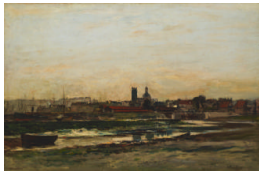
Title: Dieppe Date: 1877 Primary Maker: Charles-François Daubigny Medium: Oil on canvas Dimensions: 26 3/8 × 39 3/4 in. (67 × 101 cm)