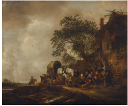
Title: Travelers Halting at an Inn Date: ca. 1635–49 Primary Maker: Isack van Ostade Medium: Oil on oak panel Dimensions: 20 1/8 x 24 1/2 in. (51.1 x 62.2 cm)