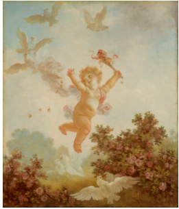
Title: The Progress of Love: Love the Jester Date: ca. 1790-91 Primary Maker: Jean-Honoré Fragonard Medium: Oil on canvas Dimensions: 59 3/8 x 50 3/8 in. (150.8 x 128 cm)