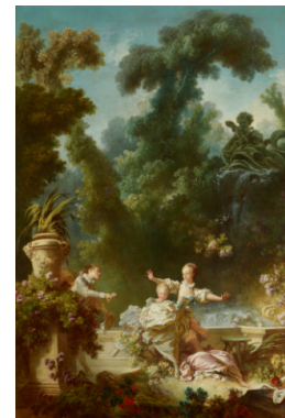
Title: The Progress of Love: The Pursuit Date: 1771-72 Primary Maker: Jean-Honoré Fragonard Medium: Oil on canvas Dimensions: 125 1/8 x 84 7/8 in. (317.8 x 215.6 cm)