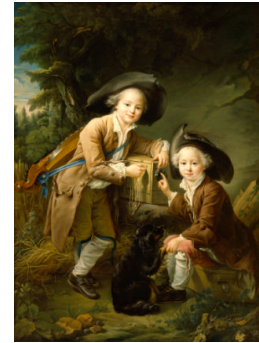
Title: The Comte and Chevalier de Choiseul as Savoyards Date: 1758 Primary Maker: François-Hubert Drouais Medium: Oil on canvas Dimensions: 54 7/8 x 42 in. (139.4 x 106.7 cm)