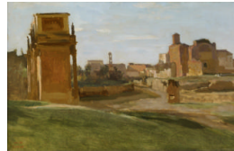
Title: The Arch of Constantine and the Forum, Rome Date: 1843 Primary Maker: Jean-Baptiste-Camille Corot Medium: Oil on paper mounted on canvas Dimensions: 10 5/8 × 16 1/2 in. (27 × 41.9 cm)