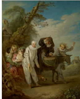
Title: Procession of Italian Comedians Date: 1713–36 Primary Maker: Jean-Baptiste Joseph Pater Medium: Oil on canvas Dimensions: 29 1/4 x 23 3/8 in. (74.3 x 59.4 cm)