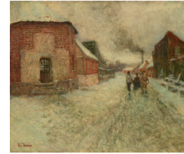
Title: Winter in Norway Date: ca. 1895 Primary Maker: Frits Thaulow Medium: Oil on canvas Dimensions: 21 1/2 x 25 3/4 in. (54.6 x 65.4 cm)