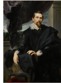
Title: Frans Snyders Date: ca. 1620 Primary Maker: Anthony van Dyck Medium: Oil on canvas Dimensions: 56 1/8 x 41 1/2 in. (142.6 x 105.4 cm)