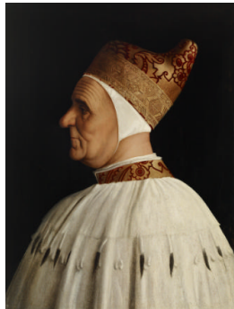
Title: Doge Giovanni Mocenigo Date: 1478–85 Primary Maker: Gentile Bellini Medium: Tempera on poplar panel Dimensions: 25 1/2 x 18 3/4 in. (64.8 x 47.6 cm)