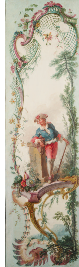
Title: Decorative Panel: Youth with a Spade

Dimensions: 58 5/8 x 21 1/2 in. (148.9 x 54.6 cm)