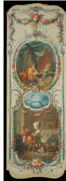
Title: The Arts and Sciences: Painting and Sculpture Date: ca. 1760 Primary Maker: François Boucher Medium: Oil on canvas Dimensions: 85 1/2 x 30 1/2 in. (217.2 x 77.5 cm)