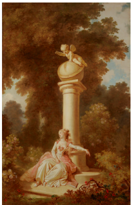
Title: The Progress of Love: Reverie Date: ca. 1790-91 Primary Maker: Jean-Honoré Fragonard Medium: Oil on canvas Dimensions: 125 1/8 x 77 5/8 in. (317.8 x 197.2 cm)