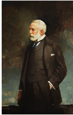
Title: Henry Clay Frick

Dimensions: 51 7/8 x 36 1/4 in. (131.8 x 92.1 cm)