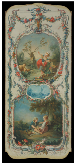
Title: The Arts and Sciences: Fowling and Horticulture Date: ca. 1760 Primary Maker: François Boucher Medium: Oil on canvas Dimensions: 85 1/2 x 38 in. (217.2 x 96.5 cm)