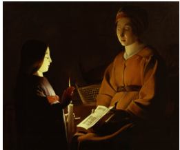
Title: The Education of the Virgin

Dimensions: 29 1/4 x 24 1/4 in. (74.3 x 61.6 cm)