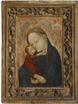
Title: Virgin and Child Date: ca. 1390–1400 Primary Maker: French, Probably Burgundian Medium: Oil and tempera on panel Dimensions: Image: 8 5/8 x 5 5/8 in. (21.9 x 14.3 cm)