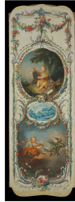
Title: The Arts and Sciences: Comedy and Tragedy Date: ca. 1760 Primary Maker: François Boucher Medium: Oil on canvas Dimensions: 85 1/2 x 30 1/2 in. (217.2 x 77.5 cm)