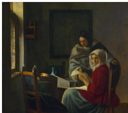
Title: Girl Interrupted at Her Music Date: ca. 1658–59 Primary Maker: Johannes Vermeer Medium: Oil on canvas Dimensions: 15 1/2 x 17 1/2 in. (39.4 x 44.5 cm)