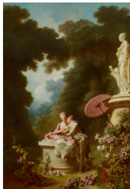
Title: The Progress of Love: Love Letters Date: 1771-72 Primary Maker: Jean-Honoré Fragonard Medium: Oil on canvas Dimensions: 124 7/8 x 85 3/8 in. (317.2 x 216.9 cm)