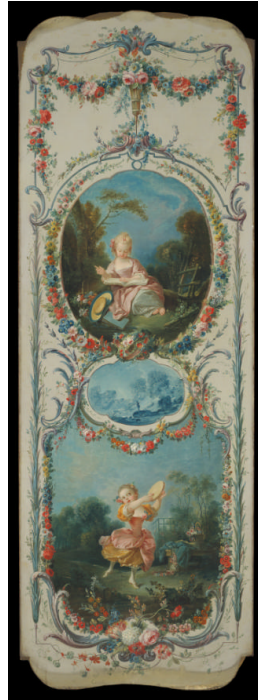
Title: The Arts and Sciences: Singing and Dancing Date: ca. 1760 Primary Maker: François Boucher Medium: Oil on canvas Dimensions: 85 1/2 x 30 1/2 in. (217.2 x 77.5 cm)