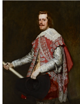
Title: King Philip IV of Spain Date: 1644 Primary Maker: Diego Rodríguez de Silva y Velázquez Medium: Oil on canvas Dimensions: 51 1/8 x 39 1/8 in. (129.9 x 99.4 cm)