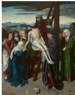
Title: The Deposition Date: ca. 1495–1500 Primary Maker: Gerard David Medium: Oil on canvas Dimensions: 56 1/8 × 44 1/4 in. (142.6 × 112.4 cm)