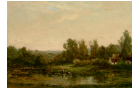
Title: The Washerwomen Date: 1870–74 Primary Maker: Charles-François Daubigny Medium: Oil on canvas Dimensions: 20 7/8 × 31 1/2 in. (53 × 80 cm)