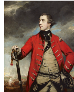
Title: General John Burgoyne Date: ca. 1766 Primary Maker: Joshua Reynolds Medium: Oil on canvas Dimensions: 50 x 39 7/8 in. (127 x 101.3 cm)