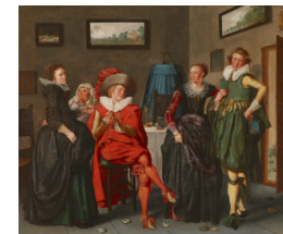
Title: The Jovial Company Date: ca. 1622–24 Primary Maker: Willem Pietersz Buytewech Medium: Oil on canvas Dimensions: 32 x 39 1/2 in. (81.3 x 100.3 cm)