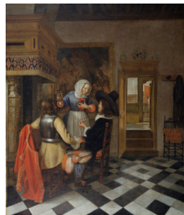
Title: Drinkers before the Fireplace Date: ca. 1660 Primary Maker: Hendrik van der Burgh Medium: Oil on canvas Dimensions: 30 1/2 x 26 1/8 in. (77.5 x 66.4 cm)