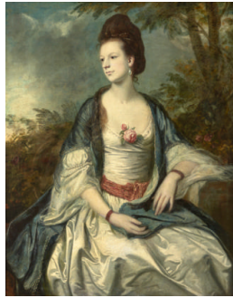
Title: Lady Cecil Rice Date: 1762 Primary Maker: Joshua Reynolds Medium: Oil on canvas Dimensions: 49 3/4 x 39 5/8 in. (126.4 x 100.6 cm)