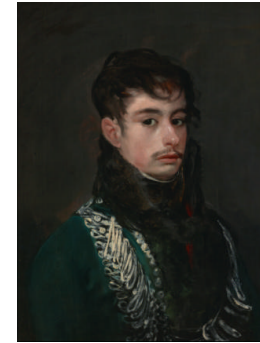
Title: An Officer (Conde de Teba?)

Dimensions: 35 3/4 x 18 1/2 in. (90.8 x 47 cm)