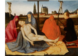
Title: Pietà with Donor Date: 15th century Primary Maker: French, Probably South of France Medium: Tempera or mixed technique on panel Dimensions: 15 5/8 x 22 in. (39.7 x 55.9 cm)