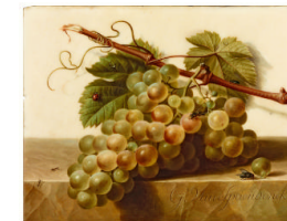
Title: Grapes with Insects on a Marble Top Date: ca. 1791–95 Primary Maker: Gerard van Spaendonck Medium: Oil on marble Dimensions: 7 3/8 x 9 1/4 x 1/8 in. (18.7 x 23.5 x 0.3 cm)