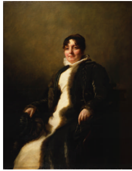
Title: Mrs. James Cruikshank Date: ca. 1805-08 Primary Maker: Sir Henry Raeburn Medium: Oil on canvas Dimensions: 50 3/4 x 40 in. (128.9 x 101.6 cm)