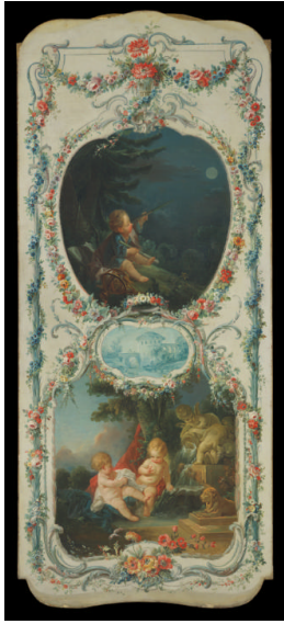
Title: The Arts and Sciences: Astronomy and Hydraulics Date: ca. 1760 Primary Maker: François Boucher Medium: Oil on canvas Dimensions: 85 1/2 x 38 in. (217.2 x 96.5 cm)