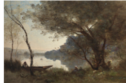
Title: The Boatman of Mortefontaine Date: ca. 1865–70 Primary Maker: Jean-Baptiste-Camille Corot Medium: Oil on canvas Dimensions: 24 × 35 3/8 in. (61 × 89.9 cm)