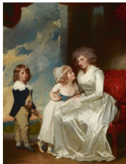
Title: Henrietta, Countess of Warwick, and Her Children Date: 1787–89 Primary Maker: George Romney Medium: Oil on canvas Dimensions: 79 3/4 x 61 1/2 in. (202.6 x 156.2 cm)