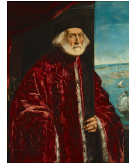
Title: Portrait of a Venetian Procurator Date: 16th century Primary Maker: Jacopo Tintoretto Medium: Oil on canvas Dimensions: 44 5/8 x 35 in. (113.3 x 88.9 cm)