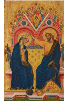
Title: The Coronation of the Virgin Date: 1358 Primary Maker: Paolo Veneziano Medium: Tempera on panel Dimensions: 43 1/4 x 27 in. (109.9 x 68.6 cm)