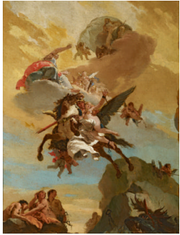
Title: Perseus and Andromeda Date: ca. 1730–31 Primary Maker: Giambattista Tiepolo Medium: Oil on canvas Dimensions: 20 3/8 x 16 in. (51.8 x 40.6 cm)