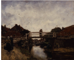
Title: The Bridge Date: 1885 Primary Maker: Jacobus Hendrikus Maris Medium: Oil on canvas Dimensions: 44 3/8 x 54 3/8 in. (112.7 x 138.1 cm)