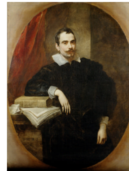
Title: Ottaviano Canevari Date: ca. 1627 Primary Maker: Anthony van Dyck Medium: Oil on canvas Dimensions: 51 1/4 x 39 in. (130.2 x 99.1 cm)