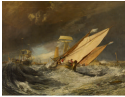
Title: Fishing Boats Entering Calais Harbor Date: ca. 1803 Primary Maker: Joseph Mallord William Turner Medium: Oil on canvas Dimensions: 29 x 38 3/4 in. (73.7 x 98.4 cm)