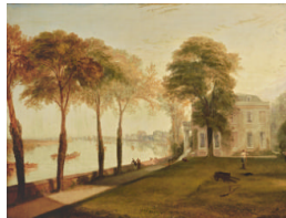
Title: Mortlake Terrace: Early Summer Morning Date: 1826 Primary Maker: Joseph Mallord William Turner Medium: Oil on canvas Dimensions: 36 5/8 x 48 1/2 in. (93 x 123.2 cm)