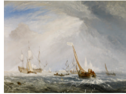
Title: Antwerp: Van Goyen Looking Out for a Subject Date: 1833 Primary Maker: Joseph Mallord William Turner Medium: Oil on canvas Dimensions: 36 1/8 x 48 3/8 in. (91.8 x 122.9 cm)