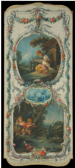
Title: The Arts and Sciences: Fishing and Hunting Date: ca. 1760 Primary Maker: François Boucher Medium: Oil on canvas Dimensions: 85 1/2 x 38 in. (217.2 x 96.5 cm)