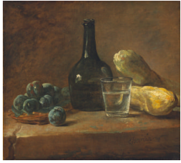
Title: Still Life with Plums Date: ca. 1730 Primary Maker: Jean-Siméon Chardin Medium: Oil on canvas Dimensions: 17 3/4 × 19 3/4 in. (45.1 × 50.2 cm)