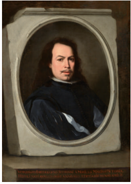
Title: Self-Portrait Date: ca. 1650–55 Primary Maker: Bartolomé Esteban Murillo Medium: Oil on canvas Dimensions: 42 1/8 x 30 1/2 in. (107 x 77.5 cm)