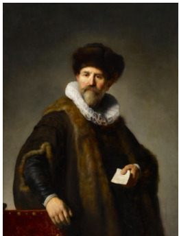
Title: Nicolaes Ruts Date: 1631 Primary Maker: Rembrandt Harmensz. van Rijn Medium: Oil on panel Dimensions: 46 x 34 3/8 in. (116.8 x 87.3 cm)