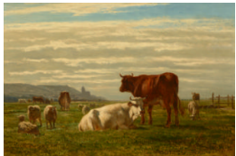
Title: A Pasture in Normandy Date: 1850s Primary Maker: Constant Troyon Medium: Oil on wood panel Dimensions: 17 x 25 5/8 in. (43.2 x 65.1 cm)