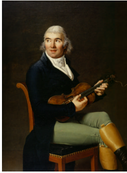
Title: Antonio Bartolomeo Bruni Date: before 1804 Primary Maker: Césarine-Henriette-Flore Davin-Mirvault Medium: Oil on canvas Dimensions: 50 7/8 x 37 3/4 in. (129.2 x 95.9 cm)