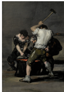
Title: The Forge

Dimensions: 31 1/2 x 23 in. (80 x 58.4 cm)