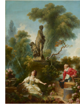
Title: The Progress of Love: The Meeting Date: 1771–72 Primary Maker: Jean-Honoré Fragonard Medium: Oil on canvas Dimensions: 125 x 96 in. (317.5 x 243.8 cm)