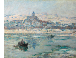
Title: Vétheuil in Winter Date: 1878–79 Primary Maker: Claude Monet Medium: Oil on canvas Dimensions: 27 x 35 3/8 in. (68.6 x 89.9 cm)