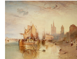
Title: Cologne, the Arrival of a Packet-Boat: Evening Date: 1826 Primary Maker: Joseph Mallord William Turner Medium: Oil on canvas Dimensions: 66 3/8 x 88 1/4 in. (168.6 x 224.2 cm)