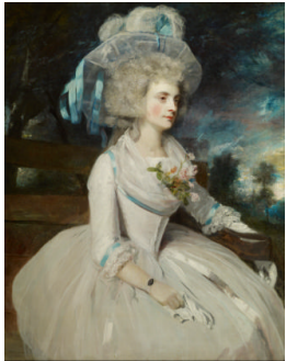
Title: Selina, Lady Skipwith Date: 1787 Primary Maker: Joshua Reynolds Medium: Oil on canvas Dimensions: 50 1/2 x 40 1/4 in. (128.3 x 102.2 cm)