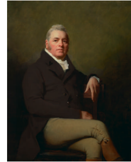
Title: James Cruikshank Date: 1805-08 Primary Maker: Sir Henry Raeburn Medium: Oil on canvas Dimensions: 50 x 40 in. (127 x 101.6 cm)