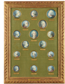
Title: Set of Sixteen Miniatures of French Eighteenth-Century Notables Date: probably 19th century Primary Maker: French, Probably Nineteenth Century Medium: Watercolor and gouache on ivory Dimensions: 18 1/8 x 12 1/2 in. (46 x 31.8 cm)