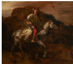
Title: The Polish Rider Date: ca. 1655 Primary Maker: Rembrandt Harmensz. van Rijn Medium: Oil on canvas Dimensions: 46 x 53 1/8 in. (116.8 x 134.9 cm)