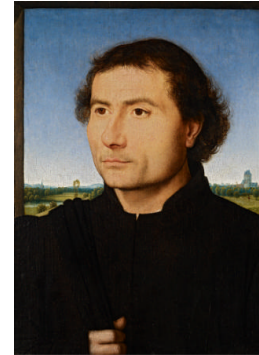
Title: Portrait of a Man Date: ca. 1470–75 Primary Maker: Hans Memling Medium: Oil on panel Dimensions: 13 1/8 x 9 1/8 in. (33.3 x 23.2 cm)