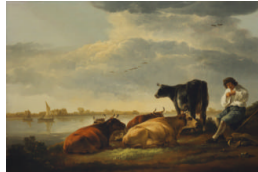
Title: Cows and Herdsman by a River Date: after 1650 Primary Maker: Aelbert Cuyp Medium: Oil on oak panel Dimensions: 19 3/4 × 29 1/4 in. (50.2 × 74.3 cm)