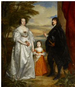
Title: James Stanley, Lord Strange, Later Seventh Earl of Derby, with His Wife, Charlotte, and Their Daughter Date: ca. 1636 Primary Maker: Anthony van Dyck Medium: Oil on canvas Dimensions: 97 x 84 1/8 in. (246.4 x 213.7 cm)