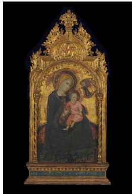
Title: Madonna and Child Date: late 14th century–early 15th century Primary Maker: Andrea di Bartolo Medium: Tempera on panel Dimensions: 21 x 13 in. (53.3 x 33 cm)