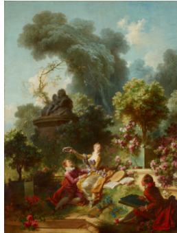
Title: The Progress of Love: The Lover Crowned Date: 1771-72 Primary Maker: Jean-Honoré Fragonard Medium: Oil on canvas Dimensions: 125 1/8 x 95 3/4 in. (317.8 x 243.2 cm)