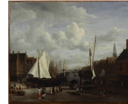
Title: Quay at Amsterdam Date: ca. 1670 Primary Maker: Jacob van Ruisdael Medium: Oil on canvas Dimensions: 20 3/8 x 25 7/8 in. (51.8 x 65.7 cm)