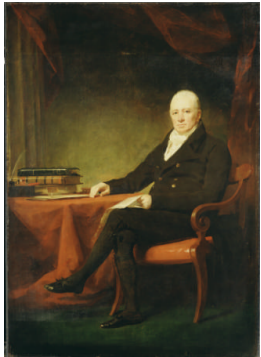
Title: Alexander Allan Date: ca. 1815 Primary Maker: Sir Henry Raeburn Medium: Oil on canvas Dimensions: 81 x 57 1/2 in. (205.7 x 146.1 cm)