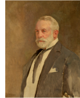
Title: Portrait of Henry Clay Frick

Dimensions: 56 1/8 x 35 15/16 in. (142.6 x 91.3 cm)