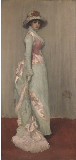
Title: Harmony in Pink and Grey: Portrait of Lady Meux Date: 1881–82 Primary Maker: James McNeill Whistler Medium: Oil on canvas Dimensions: 76 1/4 × 36 5/8 in. (193.7 × 93 cm)