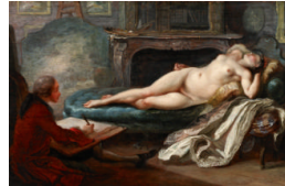
Title: The Private Academy Date: ca. 1755 Primary Maker: Gabriel de Saint-Aubin Medium: Oil on panel Dimensions: 13 1/2 x 15 x 3 1/4 in. (34.3 x 38.1 x 8.3 cm)