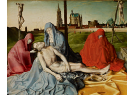
Title: Pietà Date: ca. 1440 Primary Maker: Konrad Witz Medium: Tempera and oil on panel Dimensions: 13 1/8 × 17 1/2 in. (33.3 × 44.5 cm)