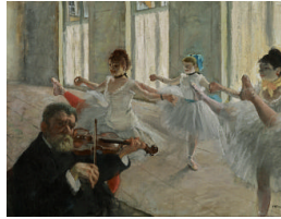
Title: The Rehearsal Date: 1878-79 Primary Maker: Edgar Degas Medium: Oil on canvas Dimensions: 18 3/4 x 24 in. (47.6 x 61 cm)