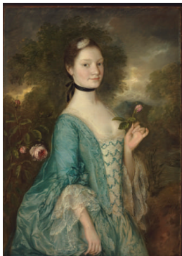
Title: Sarah, Lady Innes Date: ca. 1757 Primary Maker: Thomas Gainsborough Medium: Oil on canvas Dimensions: 40 x 28 5/8 in. (101.6 x 72.7 cm)