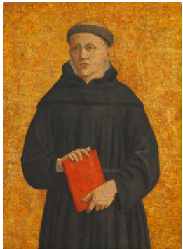
Title: An Augustinian Monk (St. Leonard?) Date: 1454–69 Primary Maker: Piero della Francesca Medium: Tempera on panel Dimensions: 15 3/4 x 11 1/8 in. (40 x 28.3 cm)