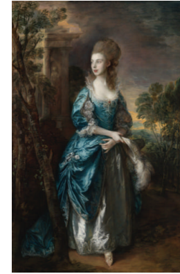
Title: The Hon. Frances Duncombe

Dimensions: 30 1/4 x 25 1/8 in. (76.8 x 63.8 cm)