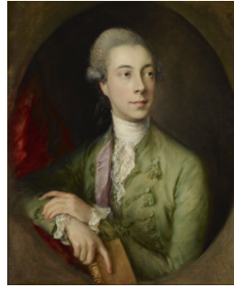
Title: Richard Paul Jodrell

Dimensions: 30 1/8 x 25 in. (76.5 x 63.5 cm)