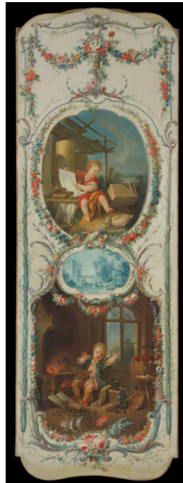
Title: The Arts and Sciences: Architecture and Chemistry Date: ca. 1760 Primary Maker: François Boucher Medium: Oil on canvas Dimensions: 85 1/2 x 30 1/2 in. (217.2 x 77.5 cm)