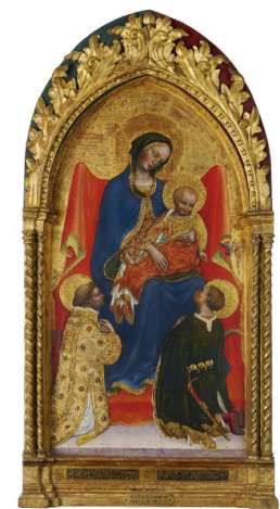
Title: Madonna and Child, with Saints Lawrence and Julian

Dimensions: 29 3/4 x 24 5/8 in. (75.6 x 62.5 cm)