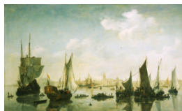
Title: A View of the River Maas Before Rotterdam Date: ca. 1645–65 Primary Maker: Jan van de Cappelle Medium: Oil on oak panel Dimensions: 34 3/4 x 64 x 2 1/4 in. (88.3 x 162.6 x 5.7 cm)