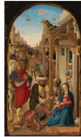
Title: Adoration of the Magi Date: 1470s Primary Maker: Lazzaro Bastiani Medium: Tempera on poplar panel Dimensions: 20 1/2 x 11 in. (52.1 x 27.9 cm)