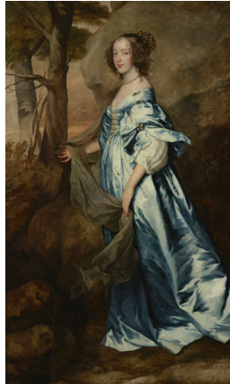
Title: Lady Anne Carey, Later Viscountess Claneboye and Countess of Clanbrassil Date: ca. 1636 Primary Maker: Anthony van Dyck Medium: Oil on canvas Dimensions: 83 1/2 x 50 1/4 in. (212.1 x 127.6 cm)