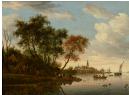
Title: River Scene: Men Dragging a Net Date: ca. 1667 Primary Maker: Salomon van Ruysdael Medium: Oil on canvas Dimensions: 26 1/4 x 35 1/8 in. (66.7 x 89.2 cm)