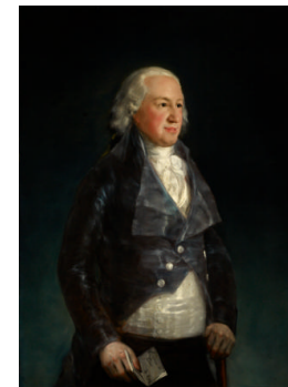
Title: Don Pedro, Duque de Osuna

Dimensions: 71 1/2 x 49 1/4 in. (181.6 x 125.1 cm)