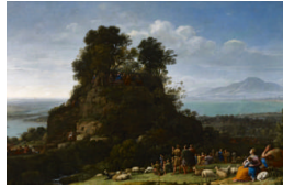
Title: The Sermon on the Mount Date: ca. 1656 Primary Maker: Claude Lorrain (Claude Gellée) Medium: Oil on canvas Dimensions: 67 1/2 x 102 1/4 in. (171.5 x 259.7 cm)