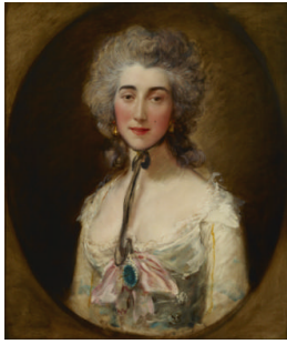
Title: Grace Dalrymple Elliott