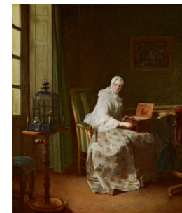
Title: Lady with a Bird-Organ Date: 1753 (?) Primary Maker: Jean-Siméon Chardin Medium: Oil on canvas Dimensions: 20 x 17 in. (50.8 x 43.2 cm)