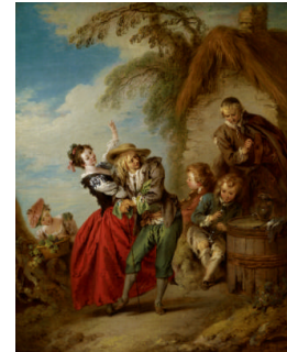
Title: The Village Orchestra Date: 1713–36 Primary Maker: Jean-Baptiste Joseph Pater Medium: Oil on canvas Dimensions: 29 3/8 x 23 1/2 in. (74.6 x 59.7 cm)