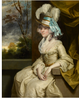
Title: Elizabeth, Lady Taylor Date: ca. 1780 Primary Maker: Joshua Reynolds Medium: Oil on canvas Dimensions: 50 1/8 x 40 1/4 in. (127.3 x 102.2 cm)