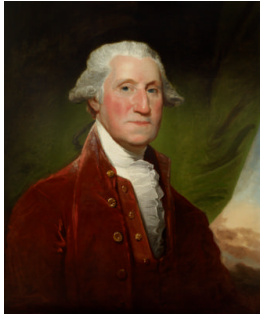
Title: George Washington Date: 1795 Primary Maker: Gilbert Stuart Medium: Oil on canvas Dimensions: 29 1/4 x 24 in. (74.3 x 61 cm)