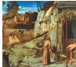
Title: St. Francis in the Desert Date: ca. 1475–80 Primary Maker: Giovanni Bellini Medium: Oil on panel Dimensions: Panel: 49 1/16 x 55 7/8 in. (124.6 x 142 cm) Image: 48 7/8 x 55 5/16 in. (124.1 x 140.5 cm)