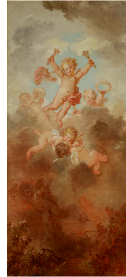
Title: The Progress of Love: Love Triumphant Date: ca. 1790-91 Primary Maker: Jean-Honoré Fragonard Medium: Oil on canvas Dimensions: 125 x 56 1/2 in. (317.5 x 143.5 cm)