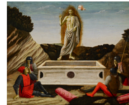
Title: The Resurrection Date: ca. 1465–70 Primary Maker: Francesco Botticini Medium: Tempera on poplar panel Dimensions: 11 1/4 x 13 1/4 in. (28.6 x 33.7 cm)