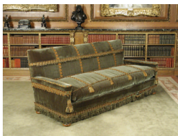
Title: Green Velvet Sofa with Braid Tassle Fringe Primary Maker: White Allom Ltd., London Medium: Walnut frame Dimensions: 30 1/2 x 99 x 34 1/2 in. (77.5 x 251.5 x 87.6 cm)