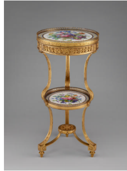
Title: Tripod Table Date: ca. 1783 Primary Maker: Sèvres Porcelain Manufactory Medium: Gilt bronze, oak, and Sèvres soft-paste porcelain Dimensions: H.: 29 1/2 (74.9 cm), diam.: 14 5/8 (37.1 cm)