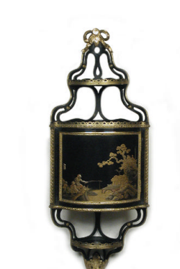
Title: Hanging Corner Cabinet with Panels of Black-and Gold Tôle (One of a Pair) Date: 1775–80 Primary Maker: Martin Carlin Medium: Ebony, tulipwood veneer, tôle, gilt bronze, and laquered brass on walnut Dimensions: 33 1/4 x 12 3/4 in. (84.5 x 32.4 cm)