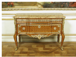
Title: Commode with Herringbone Parquetry (One of a Pair) Date: ca. 1770 Primary Maker: Pierre Dupré Medium: Tulipwood, amaranth, gilt bronze, marble on oak and fir Dimensions: 35 × 51 1/2 × 24 in. (88.9 × 130.8 × 61 cm)