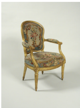
Title: Armchair with Tapestry Covers Showing Flowers on Blue Ground Date: ca. 1770–1850 Primary Maker: French Medium: Dyed wool and silk yarns on warps of undyed wool Dimensions: 35 1/8 x 24 x 21 7/8 in. (89.2 x 61 x 55.6 cm)