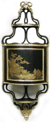
Title: Hanging Corner Cabinet with Panels of Black-and Gold Tôle (One of a Pair) Date: 1775–80 Primary Maker: Martin Carlin Medium: Ebony, tulipwood veneer, tôle, gilt bronze, and laquered brass on oak Dimensions: 33 1/4 x 12 3/4 in. (84.5 x 32.4 cm)