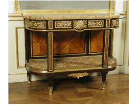
Title: Side Table with Quartered Veneer Date: 19th or early 20th century Primary Maker: Jean-Henri Riesener Medium: Tulipwood, fruitwood, amaranth, gilt-bronze mounts, and marble on oak Dimensions: 34 3/4 x 45 3/8 in. (88.3 x 115.3 cm)