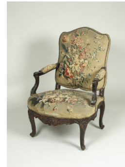
Title: Armchair Date: ca. 1730–70 Primary Maker: Probably French Medium: Dyed wool and silk yarns on wool on warps on walnut frames Dimensions: 40 1/2 x 28 x 24 1/2 in. (102.9 x 71.1 x 62.2 cm) Frames (average): 41 1/4 x 28 3/4 x 32 1/4 in. (104.8 x 73 x 81.9 cm) Covers (average): backs: 26 1/2 x 23 1/4 in. (67.3 x 59.1 cm) Covers (average): seats: 28 3/8 x 29 1/4 in. (72.1 x 74.3 cm)