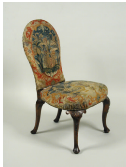
Title: Queen Anne Chair with Needlepoint Upholstery Date: 1702–14 Primary Maker: English, Eighteenth Century Medium: Walnut frame Dimensions: 40 x 21 in. (101.6 x 53.3 cm)