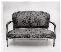
Title: Canapé with Tapestry Covers Showing Flowers on Blue Ground Date: ca. 1770–1850 Primary Maker: French Medium: Dyed wool and silk yarns on warps of undyed wool Dimensions: Frame: 36 1/4 x 52 7/8 x 28 in. (92.1 x 134.3 x 71.1 cm) Cover: back: 20 5/8 x 43 in. (20 5/8 x 43 in.) Cover: seat: 27 1/4 in. (27 1/4 in.) Cover: armrests: 9 1/8 in. (23.2 cm)