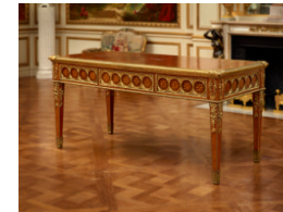
Title: Center Table with Marquetry of Trelliswork and Quatrefoils Date: ca. 1825–35 Primary Maker: French or English Medium: Tulipwood veneer, holly marquetry, plain tulipwood, gilt-bronze mounts on oak Dimensions: 33 1/2 x 70 1/4 x 32 1/2 in. (85.1 x 178.4 x 82.6 cm)