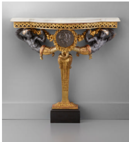
Title: Console Table (one of a pair) Date: ca. 1780 Primary Maker: French, Paris Medium: Beech, walnut, and marble Dimensions: 34 1/8 x 34 3/4 x 9 1/2 in. (86.7 x 88.3 x 24.1 cm)