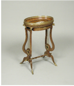
Title: Sewing Table with Sèvres Porcelain Plaque Date: 19th century Primary Maker: French or English Medium: Wood veneers, gilt-bronze mounts, and Sèvres porcelain on oak and walnut Dimensions: 27 1/2 x 19 1/8 x 15 3/8 in. (69.9 x 48.6 x 39.1 cm)