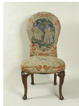
Title: Queen Anne Chair with Needlepoint Upholstery Date: 1702–14 Primary Maker: English, Eighteenth Century Medium: Walnut frame Dimensions: 40 x 22 x 20 in. (101.6 x 55.9 x 50.8 cm)