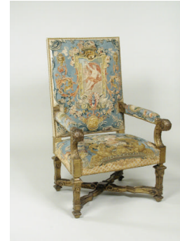
Title: Armchair Showing Grotesque Compositions on Beige or Blue Grounds (Part of a Set of One Canapé and Four Armchairs) Date: 1675–1725 and 19th century Primary Maker: French Medium: Dyed wool and silk yarns on undyed linen canvas and carved gilt-wood frame Dimensions: 52 x 33 3/8 x 30 1/4 in. (132.1 x 84.8 x 76.8 cm)