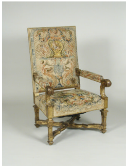
Title: Armchair Showing Grotesque Compositions on Beige or Blue Grounds (Part of a Set of One Canapé and Four Armchairs) Date: between 1675 and 1725 and 19th century Primary Maker: French Medium: Dyed wool and silk yarns on gilt beechwood Dimensions: 52 x 33 3/8 x 30 1/4 in. (132.1 x 84.8 x 76.8 cm)