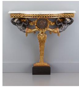
Title: Console Table (one of a pair) Date: ca. 1780 Primary Maker: French, Paris Medium: Beech, walnut, and marble Dimensions: 34 1/8 x 34 3/4 x 9 1/2 in. (86.7 x 88.3 x 24.1 cm)