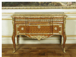
Title: Commode with Herringbone Parquetry (One of a Pair) Date: ca. 1770 Primary Maker: Pierre Dupré Medium: Tulipwood, amaranth, gilt bronze, marble on oak and fir Dimensions: 35 × 51 1/2 × 24 in. (88.9 × 130.8 × 61 cm)