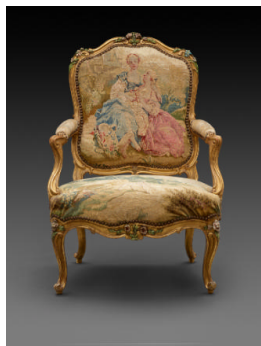
Title: Armchair with Gilt and Polychrome Frame and Beauvais Tapestry Cover Showing Pastoral Scenes (Part of a Set with Three Canapés and Four Armchairs) Date: ca. 1760–65 Primary Maker: Beauvais Tapestry Manufactory Medium: Dyed wool and silk yarns on wool and gilt walnut Dimensions: 36 1/4 x 26 1/4 x 27 in. (92.1 x 66.7 x 68.6 cm) Frames (average): 36 1/4 x 26 1/4 x 27 in. (92.1 x 66.7 x 68.6 cm) Covers (average): backs: 20 3/4 x 18 3/4 in. (52.7 x 47.6 cm) Covers (average): seats: 26 1/2 x 30 in. (67.3 x 76.2 cm)