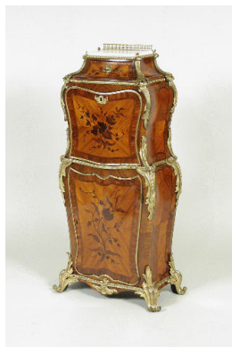
Title: Secrétaire with Floral Marquetry (One of a Pair) Date: 19th century Primary Maker: French or English Medium: Oak, pine and mahogany Dimensions: 47 × 25 × 15 in. (119.4 × 63.5 × 38.1 cm)