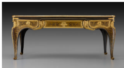
Title: Writing Table Date: ca. 1710, with later alterations Primary Maker: André-Charles Boulle Medium: Oak and walnut veneered with brass, turtle shell, ebony, and pewter; gilt bronze, leather Dimensions: 31 3/4 x 74 1/4 x 36 7/8 in. (80.6 x 188.6 x 93.7 cm)