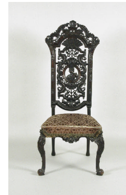
Title: Tallback Side-Chair Date: early 20th century Primary Maker: White Allom Ltd., London Medium: Walnut Dimensions: 54 x 24 x 20 1/2 in. (137.2 x 61 x 52.1 cm)