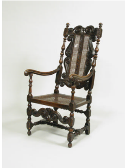
Title: Armchair Date: 19th century Medium: Walnut Dimensions: 49 x 23 1/2 x 28 in. (124.5 x 59.7 x 71.1 cm)