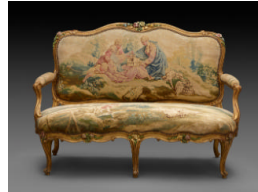
Title: Small Canapé with Gilt and Polychrome Frame and Beauvais Tapestry Cover Showing Pastoral Scenes (Part of a Set with Three Canapés and Four Armchairs) Date: ca. 1760–65 Primary Maker: Beauvais Tapestry Manufactory Medium: Dyed wool and silk yarns on wool and gilt walnut Dimensions: 37 1/8 x 52 5/8 x 29 3/8 in. (94.3 x 133.7 x 74.6 cm) Frame: 37 1/8 x 52 5/8 x 29 3/8 in. (94.3 x 133.7 x 74.6 cm) Covers: back: 21 3/4 x 45 1/4 in. (55.2 x 114.9 cm) Covers: seat: 27 1/2 x 57 in. (69.9 x 144.8 cm)