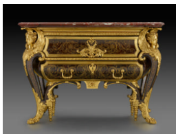
Title: Commode (one of a pair) Date: ca. 1820–50 Primary Maker: André-Charles Boulle Medium: Oak and walnut veneered with turtle shell, brass, and ebony; gilt bronze, marble Dimensions: 34 3/4 x 48 3/4 x 25 1/4 in. (88.3 x 123.8 x 64.1 cm)