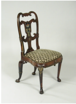
Title: Queen Anne Chair Date: 1702–14 Primary Maker: English, Eighteenth Century Medium: Walnut frame Dimensions: 41 x 22 3/4 x 21 1/4 in. (104.1 x 57.8 x 54 cm)