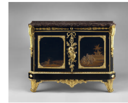
Title: Cabinet Date: ca. 1764 Primary Maker: Bernard van Risenburgh II Medium: Oak with veneered ebony, tulipwood, amaranth, and padouk; lacquer, gilt bronze, marble Dimensions: 35 1/4 x 47 1/4 x 22 in. (89.5 x 120 x 55.9 cm)