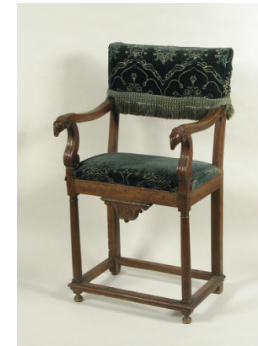
Title: Upholstered Armchair with Ram's-Head Terminals Date: 16th and 19th century Primary Maker: French, Sixteenth Century Dimensions: 41 1/2 x 20 5/8 x 23 1/4 in. (105.4 x 52.4 x 59.1 cm)