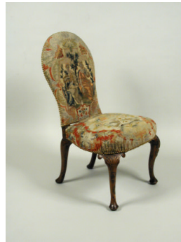
Title: Queen Anne Chair with Needlepoint Upholstery Date: 1702–14 Primary Maker: English, Eighteenth Century Medium: Walnut frame Dimensions: 40 x 22 x 20 in. (101.6 x 55.9 x 50.8 cm)