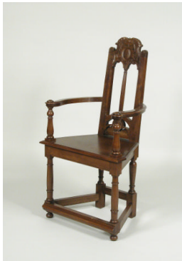
Title: Armchair with Scrollwork Cartouche and Open Back Date: late 16th century and 19th century Primary Maker: French, Late Sixteenth Century Medium: Walnut Dimensions: 44 5/8 x 24 1/4 x 20 1/8 in. (113.3 x 61.6 x 51.1 cm)