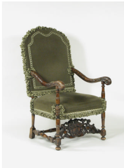
Title: Green Armchair Date: early 20th century Primary Maker: After the English Medium: Walnut frame Dimensions: 49 1/4 x 27 1/2 x 27 in. (125.1 x 69.9 x 68.6 cm)