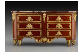
Title: Commode Date: ca. 1710, with later alterations Primary Maker: André-Charles Boulle Medium: Oak and walnut veneered with kingwood and tulipwood; gilt bronze, marble Dimensions: 34 1/2 x 66 3/4 x 24 in. (87.6 x 169.5 x 61 cm)