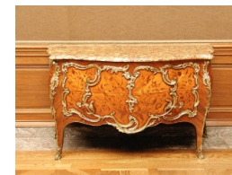
Title: Commode with Floral Marquetry Date: ca. 1755 Primary Maker: Jacques-Philippe Carel Medium: Mixed woods Dimensions: 34 1/4 x 57 3/4 x 26 in. (87 x 146.7 x 66 cm)