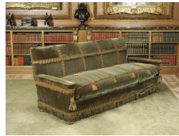
Title: Green Velvet Sofa with Braid Tassel Fringe Primary Maker: White Allom Ltd., London Medium: Walnut frame Dimensions: 30 1/2 x 99 x 34 1/2 in. (77.5 x 251.5 x 87.6 cm)