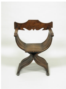
Title: Chair with Shield and Crests Date: 16th or 19th century Primary Maker: Italian, Sixteenth Century Medium: Walnut Dimensions: 38 x 27 1/2 x 22 in. (96.5 x 69.9 x 55.9 cm)