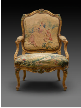
Title: Armchair with Gilt and Polychrome Frame and Beauvais Tapestry Cover Showing Pastoral Scenes (Part of a Set with Three Canapés and Four Armchairs) Date: ca. 1760–65 Primary Maker: Beauvais Tapestry Manufactory Medium: Dyed wool and silk yarns on wool and gilt walnut Dimensions: 36 1/4 x 26 1/4 in. (92.1 x 66.7 cm) Frames (average): 36 1/4 x 26 1/4 x 27 in. (92.1 x 66.7 x 68.6 cm) Covers (average): backs: 20 3/4 x 18 3/4 in. (52.7 x 47.6 cm) Covers (average): seats: 26 1/2 x 30 in. (67.3 x 76.2 cm)