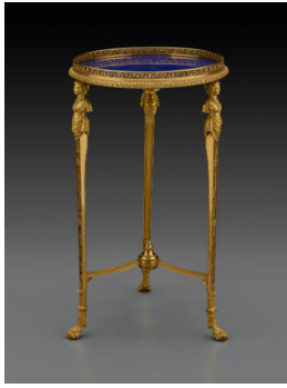
Title: Tripod Table Date: ca. 1785 Primary Maker: French, Paris Medium: Gilt bronze, lapis lazuli, iron, and oak Dimensions: H.: 28 1/4 in. (71.8 cm), diam.: 16 1/4 in. (41.3 cm)