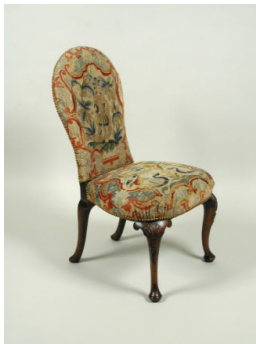
Title: Queen Anne Chair with Needlepoint Upholstery Date: 1702–14 Primary Maker: English, Eighteenth Century Medium: Walnut frame Dimensions: 40 x 22 x 20 in. (101.6 x 55.9 x 50.8 cm)