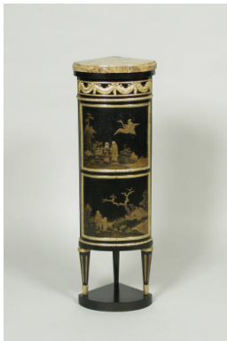
Title: Small Corner Cupboard with Panels of Black-and Gold Tôle (One of a Pair) Date: 1775-80 Primary Maker: Martin Carlin Medium: Ebony veneer, tôle, gilt-bronze mounts, and marble on oak Dimensions: 34 3/8 x 11 3/8 in. (87.3 x 28.9 cm)