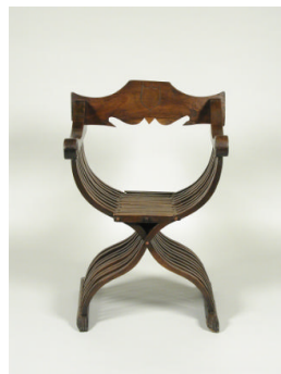
Title: Chair with Shield and Crests Date: 16th or 19th century Primary Maker: Italian, Sixteenth Century Medium: Walnut Dimensions: 38 x 27 1/2 x 22 in. (96.5 x 69.9 x 55.9 cm)