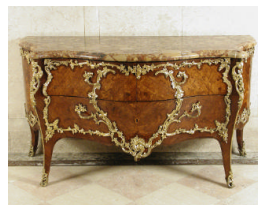
Title: Commode with Floral Marquetry Date: 1750–55 Primary Maker: Hubert Hansen Medium: Mahogany, kingwood marquetry, amaranth, gilt-bronze mounts, marble on oak Dimensions: 34 3/4 x 64 x 26 in. (88.3 x 162.6 x 66 cm)