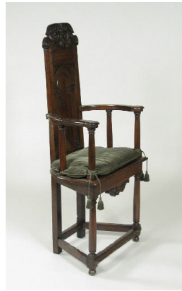
Title: Armchair with Archway in Relief Date: 16th and 19th century Primary Maker: French, Sixteenth Century Medium: Walnut Dimensions: 51 1/2 x 24 1/4 in. (130.8 x 61.6 cm)