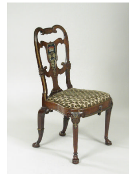
Title: Queen Anne Chair Date: 1702–14 Primary Maker: English, Eighteenth Century Medium: Walnut frame Dimensions: 41 x 22 3/4 x 21 1/4 in. (104.1 x 57.8 x 54 cm)