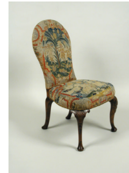
Title: Queen Anne Chair with Needlepoint Upholstery Date: 1702–14 Primary Maker: English, Eighteenth Century Medium: Walnut frame Dimensions: 40 x 22 x 20 in. (101.6 x 55.9 x 50.8 cm)