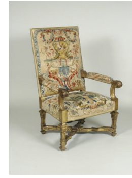
Title: Armchair Showing Grotesque Compositions on Beige or Blue Grounds (Part of a Set of One Canapé and Four Armchairs) Date: between 1675 and 1725 and 19th century Primary Maker: French Medium: Dyed wool and silk yarns on gilt beechwood Dimensions: 52 x 33 3/8 x 30 1/4 in. (132.1 x 84.8 x 76.8 cm)