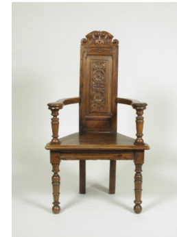
Title: Armchair with Rosettes and Foliage in Relief Date: 19th century Primary Maker: French, Nineteenth Century Medium: Walnut Dimensions: 45 3/8 x 25 1/4 x 18 3/4 in. (115.3 x 64.1 x 47.6 cm)