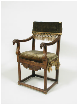
Title: Upholstered Armchair with Ram's-Head Terminals Date: 16th and 19th century Primary Maker: French, Sixteenth Century Medium: Walnut, pine, ebony and other wood, upholstered with velvet, braid and fringe Dimensions: 41 x 21 5/8 x 23 1/4 in. (104.1 x 54.9 x 59.1 cm)