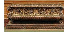
Title: Cassone with Rinceaux in Relief and Parcel Gilding Date: 16th century Primary Maker: Italian, Sixteenth Century Medium: Walnut and gilding Dimensions: 25 x 73 3/8 x 2 7/16 in. (63.5 x 186.4 x 6.2 cm)