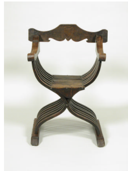
Title: Chair with Shield and Crests Date: 16th or 19th century Primary Maker: Italian, Sixteenth Century Medium: Walnut Dimensions: 38 x 27 1/2 x 22 in. (96.5 x 69.9 x 55.9 cm)