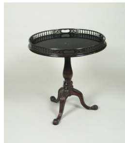
Title: Round Tripod Table Primary Maker: Thomas Chippendale Medium: Mahogany Dimensions: H.: 32 1/2; diam.: 30 in. (82.6 x 76.2 cm)