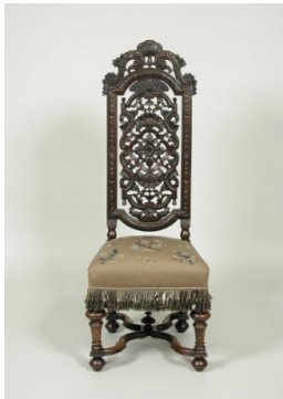
Title: Tallback Side-Chair with Appliquéd Seat Medium: Walnut frame Dimensions: 54 x 21 x 19 1/2 in. (137.2 x 53.3 x 49.5 cm)