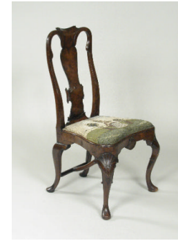
Title: Queen Anne Chair Date: 1702–14 Primary Maker: English, Eighteenth Century Medium: Walnut frame Dimensions: 41 1/8 x 22 1/4 x 19 3/4 in. (104.5 x 56.5 x 50.2 cm)