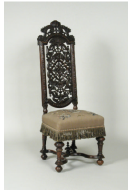
Title: Tallback Side-Chair with Appliquéd Seat Medium: Walnut frame Dimensions: 54 x 21 x 19 1/2 in. (137.2 x 53.3 x 49.5 cm)