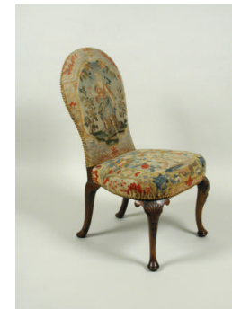
Title: Queen Anne Chair with Needlepoint Upholstery Date: 1702–14 Primary Maker: English, Eighteenth Century Medium: Walnut frame Dimensions: 40 x 22 x 20 in. (101.6 x 55.9 x 50.8 cm)