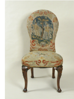
Title: Queen Anne Chair with Needlepoint Upholstery Date: 1702–14 Primary Maker: English, Eighteenth Century Medium: Walnut frame Dimensions: 40 x 22 x 20 in. (101.6 x 55.9 x 50.8 cm)