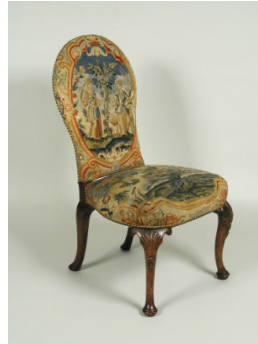
Title: Queen Anne Chair with Needlepoint Upholstery Date: 1702–14 Primary Maker: English, Eighteenth Century Medium: Walnut frame Dimensions: 40 x 22 x 20 in. (101.6 x 55.9 x 50.8 cm)