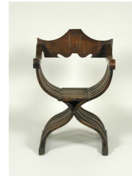
Title: Chair with Shield and Crests Date: 16th or 19th century Primary Maker: Italian, Sixteenth Century Medium: Walnut Dimensions: 39 1/2 x 25 7/16 x 21 3/8 in. (100.3 x 64.6 x 54.3 cm)