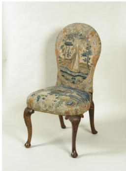
Title: Queen Anne Chair with Needlepoint Upholstery Date: 1702–14 Primary Maker: English, Eighteenth Century Medium: Walnut frame Dimensions: 40 x 22 x 20 in. (101.6 x 55.9 x 50.8 cm)