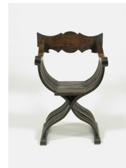
Title: Chair with Shield and Crests Date: 16th or 19th century Primary Maker: Italian, Sixteenth Century Medium: Walnut Dimensions: 40 x 27 1/4 x 22 1/4 in. (101.6 x 69.2 x 56.5 cm)