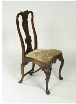
Title: Queen Anne Chair Date: 1702–14 Primary Maker: English, Eighteenth Century Medium: Walnut frame Dimensions: 41 1/8 x 22 1/4 x 19 3/4 in. (104.5 x 56.5 x 50.2 cm)