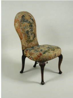
Title: Queen Anne Chair with Needlepoint Upholstery Date: 1702–14 Primary Maker: English, Eighteenth Century Medium: Walnut frame Dimensions: 40 x 22 x 20 in. (101.6 x 55.9 x 50.8 cm)