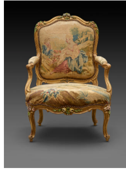
Title: Armchair with Gilt and Polychrome Frame and Beauvais Tapestry Cover Showing Pastoral Scenes (Part of a Set with Three Canapés and Four Armchairs) Date: ca. 1760–65 Primary Maker: Beauvais Tapestry Manufactory Medium: Dyed wool and silk yarns on wool and gilt walnut Dimensions: 36 1/4 x 26 1/4 x 27 in. (92.1 x 66.7 x 68.6 cm) Frames (average): 36 1/4 x 26 1/4 x 27 in. (92.1 x 66.7 x 68.6 cm) Covers (average): backs: 20 3/4 x 18 3/4 in. (52.7 x 47.6 cm) Covers (average): seats: 26 1/2 x 30 in. (67.3 x 76.2 cm)