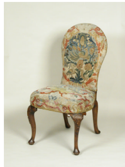
Title: Queen Anne Chair with Needlepoint Upholstery Date: 1702–14 Primary Maker: English, Eighteenth Century Medium: Walnut frame Dimensions: 40 x 22 x 20 in. (101.6 x 55.9 x 50.8 cm)