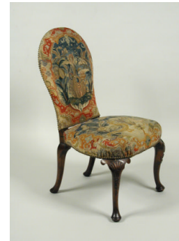
Title: Queen Anne Chair with Needlepoint Upholstery Date: 1702–14 Primary Maker: English, Eighteenth Century Medium: Walnut frame Dimensions: 40 x 21 in. (101.6 x 53.3 cm)