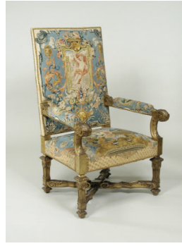
Title: Armchair Showing Grotesque Compositions on Beige or Blue Grounds (Part of a Set of One Canapé and Four Armchairs) Date: between 1675 and 1725 and 19th century Primary Maker: French Medium: Dyed wool and silk yarns on gilt beechwood Dimensions: 52 x 33 3/8 x 30 1/4 in. (132.1 x 84.8 x 76.8 cm)