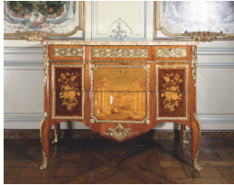
Title: Commode with Pictorial Marquetry Showing Classical Ruins and Floral Bouquets Date: ca. 1775 Primary Maker: André-Louis Gilbert Medium: Marquetry, ivory, tulipwood border, mounts of gilt bronze and marble on oak Dimensions: 33 7/8 x 45 5/8 x 20 1/2 in. (86 x 115.9 x 52.1 cm)