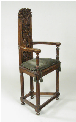
Title: Armchair with Grotesque Reliefs Date: 16th and 19th century Primary Maker: French, Sixteenth Century Medium: Walnut Dimensions: 50 1/2 x 24 7/8 in. (128.3 x 63.2 cm)