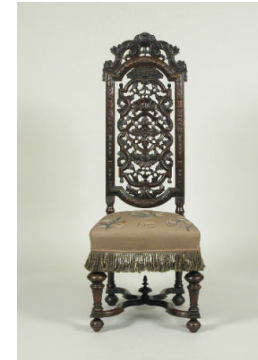
Title: Tallback Side-Chair with Appliquéd Seat Medium: Walnut frame Dimensions: 54 x 21 x 19 1/2 in. (137.2 x 53.3 x 49.5 cm)