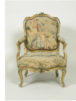
Title: Armchair with Gilt and Polychrome Frame and Beauvais Tapestry Cover Showing Pastoral Scenes (Part of a Set with Three Canapés and Four Armchairs) Date: ca. 1760–65 Primary Maker: Beauvais Tapestry Manufactory Medium: Dyed wool and silk yarns on wool and gilt walnut Dimensions: 36 x 26 x 21 1/2 in. (91.4 x 66 x 54.6 cm) Frames (average): 36 1/4 x 26 1/4 x 27 in. (92.1 x 66.7 x 68.6 cm) Covers (average): backs: 20 3/4 x 18 3/4 in. (52.7 x 47.6 cm) Covers (average): seats: 26 1/2 x 30 in. (67.3 x 76.2 cm)