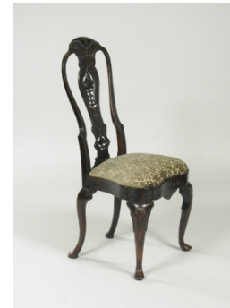
Title: Queen Anne Chair with Reliefs Date: 1702–14 Primary Maker: English, Eighteenth Century Medium: Walnut frame Dimensions: 44 5/16 x 20 1/2 x 17 1/4 in. (112.6 x 52.1 x 43.8 cm)