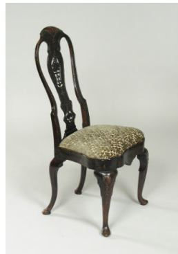
Title: Queen Anne Chair with Reliefs Date: 1702–14 Primary Maker: English, Eighteenth Century Medium: Walnut frame Dimensions: 44 5/16 x 20 1/2 x 17 1/4 in. (112.6 x 52.1 x 43.8 cm)