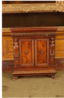
Title: Small Credenza with Terms in Relief Date: 16th century Primary Maker: Tuscan or Umbrian, Last Third of the Sixteenth Century Medium: Carved walnut, cast yellow metal mounts and wrought iron on poplar and pine Dimensions: 39 3/4 x 35 1/4 x 15 1/2 in. (101 x 89.5 x 39.4 cm)