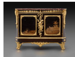
Title: Cabinet Date: ca. 1764 Primary Maker: Bernard van Risenburgh II Medium: Oak with veneered ebony, tulipwood, amaranth, and padouk; lacquer, gilt bronze, marble Dimensions: 35 1/4 × 47 1/4 × 22 in. (89.5 × 120 × 55.9 cm)