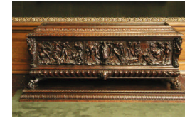
Title: Cassone with Reliefs of Caesar, the Slaying of Niobe's Sons (One of a Pair) Date: late 16th century Primary Maker: Italian, Third Quarter of the Sixteenth Century Medium: Walnut on pine Dimensions: 29 1/4 x 74 3/4 in. (74.3 x 189.9 cm)