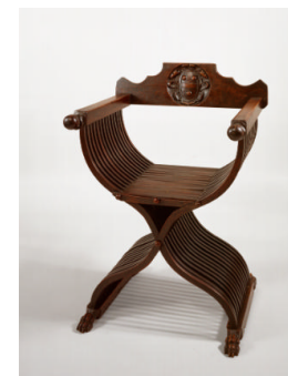
Title: Folding Armchair with Armorial Escutcheons in Relief (One of a Pair) Date: 16th or 19th century Primary Maker: Italian, Sixteenth Century Medium: Walnut Dimensions: 37 1/4 x 28 x 23 in. (94.6 x 71.1 x 58.4 cm)