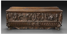
Title: Pair of Chests (cassoni) Date: third quarter of the 16th century with nineteenth-century alterations, additions and restorations Primary Maker: Italian, Milan (?) Medium: Walnut Dimensions: 28 1/2 x 70 1/2 x 21 1/4 in. (72.4 x 179.1 x 54 cm)