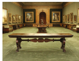
Title: Center Table with Volute-Shaped Supports and Lion's-Paw Feet Date: 16th and 19th century Primary Maker: Italian, Sixteenth Century Medium: Walnut Dimensions: 32 1/2 x 123 1/4 x 34 1/2 in. (82.6 x 313.1 x 87.6 cm)