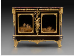
Title: Cabinet Date: ca. 1764 Primary Maker: Bernard van Risenburgh II Medium: Oak with veneered ebony, tulipwood, amaranth, and padouk; lacquer, gilt bronze, marble Dimensions: 35 1/4 x 47 1/4 x 22 in. (89.5 x 120 x 55.9 cm)