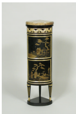
Title: Small Corner Cupboard with Panels of Black-and Gold Tôle (One of a Pair) Date: 1775–80 Primary Maker: Martin Carlin Medium: Ebony veneer, tôle, gilt-bronze mounts, and marble on oak Dimensions: 34 3/8 × 11 3/8 in. (87.3 × 28.9 cm)