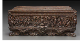
Title: Pair of Chests (cassoni) Date: Third quarter of the 16th century with nineteenth-century alterations, additions and restorations Primary Maker: Italian, Rome Medium: Walnut Dimensions: 28 x 65 1/2 x 23 1/4 in. (71.1 x 166.4 x 59.1 cm)