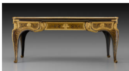
Title: Writing Table Date: ca. 1710, with later alterations Primary Maker: André-Charles Boulle Medium: Oak and walnut veneered with brass, turtle shell, ebony, and pewter; gilt bronze, leather Dimensions: 31 3/4 x 74 1/4 x 36 7/8 in. (80.6 x 188.6 x 93.7 cm)