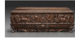
Title: Pair of Chests (cassoni) Date: third quarter of the 16th century with nineteenth-century alterations, additions and restorations Primary Maker: Italian, Milan (?) Medium: Walnut Dimensions: 27 3/4 x 70 7/8 x 21 1/2 in. (70.5 x 180 x 54.6 cm)