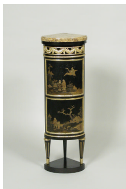
Title: Small Corner Cupboard with Panels of Black-and Gold Tôle (One of a Pair) Date: 1775–80 Primary Maker: Martin Carlin Medium: Ebony veneer, tôle, gilt-bronze mounts, and marble on oak Dimensions: 34 3/8 × 11 3/8 in. (87.3 × 28.9 cm)