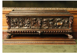
Title: Cassone with Reliefs of Caesar, the Slaying of Niobe's Sons (One of a Pair) Date: late 16th century Primary Maker: Italian, Third Quarter of the Sixteenth Century Medium: Walnut on pine Dimensions: 29 1/4 x 74 1/2 in. (74.3 x 189.2 cm)