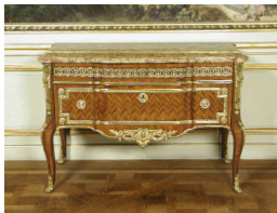
Title: Commode with Herringbone Parquetry (One of a Pair) Date: ca. 1770 Primary Maker: Pierre Dupré Medium: Tulipwood, amaranth, gilt bronze, marble on oak and fir Dimensions: 35 × 51 1/2 × 24 in. (88.9 × 130.8 × 61 cm)