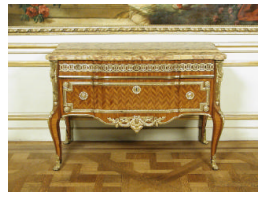
Title: Commode with Herringbone Parquetry (One of a Pair) Date: ca. 1770 Primary Maker: Pierre Dupré Medium: Tulipwood, amaranth, gilt bronze, marble on oak and fir Dimensions: 35 × 51 1/2 × 24 in. (88.9 × 130.8 × 61 cm)