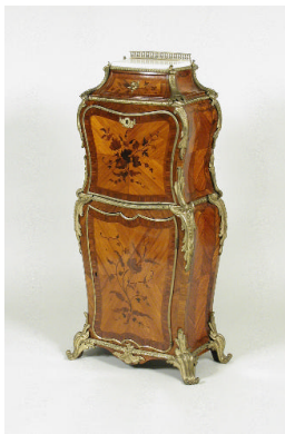
Title: Secrétaire with Floral Marquetry (One of a Pair) Date: 19th century Primary Maker: French or English Medium: Oak, pine and mahogany Dimensions: 47 × 25 × 15 in. (119.4 × 63.5 × 38.1 cm)