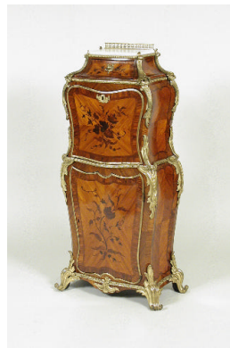
Title: Secrétaire with Floral Marquetry (One of a Pair) Date: 19th century Primary Maker: French or English Medium: Oak, pine and mahogany Dimensions: 47 × 25 × 15 in. (119.4 × 63.5 × 38.1 cm)