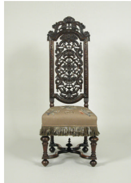
Title: Tallback Side-Chair with Appliquéd Seat Medium: Walnut frame Dimensions: 54 x 21 x 19 1/2 in. (137.2 x 53.3 x 49.5 cm)