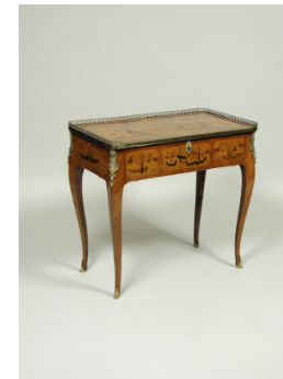
Title: Dressing and Writing Table with Pictorial Marquetry Date: ca. 1775 Primary Maker: Louis-Nöel Malle Medium: Marquetry, tulipwood, and laquered bronze mounts on oak and fir Dimensions: 28 1/4 × 29 7/8 × 17 in. (71.8 × 75.9 × 43.2 cm)