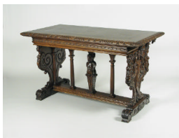
Title: Center Table with Figural and Columnar Supports Date: 16th and 19th century Primary Maker: French, Sixteenth Century Medium: Walnut Dimensions: 35 × 59 5/8 × 33 3/4 in. (88.9 × 151.4 × 85.7 cm)