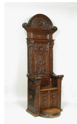
Title: High-Backed Armchair with Grotesque Reliefs and Salient Heads Date: 16th and 19th century Primary Maker: French, Sixteenth Century Medium: Walnut Dimensions: 116 3/4 × 35 3/4 × 20 in. (296.5 × 90.8 × 50.8 cm)