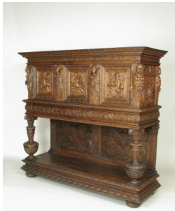
Title: Dressoir with Terms and Reliefs of the Elements Date: 19th century Primary Maker: French, Probably Nineteenth Century Medium: Walnut and pine Dimensions: 61 3/4 × 67 × 24 in. (156.8 × 170.2 × 61 cm)