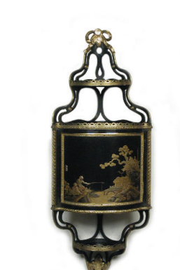
Title: Hanging Corner Cabinet with Panels of Black-and Gold Tôle (One of a Pair) Date: 1775–80 Primary Maker: Martin Carlin Medium: Ebony, tulipwood veneer, tôle, gilt bronze, and laquered brass on walnut Dimensions: 33 1/4 × 12 3/4 in. (84.5 × 32.4 cm)