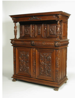
Title: Cabinet with Terms, Masks, and Foliage in Relief Date: 16th and 19th century Primary Maker: French, Sixteenth Century Medium: Walnut, pine and oak Dimensions: 67 1/2 × 56 7/8 × 26 in. (171.5 × 144.5 × 66 cm)