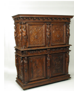
Title: Cabinet with Terms and Trophies in Relief Date: 16th and 19th century Primary Maker: French, Sixteenth Century Medium: Walnut and pine Dimensions: 79 1/2 × 69 1/8 × 27 1/2 in. (201.9 × 175.6 × 69.9 cm)