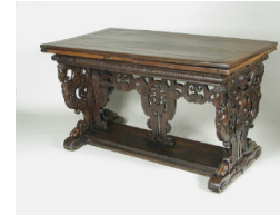
Title: Draw-Top Center Table with Figural and Openwork Supports Date: 16th century (late century) Primary Maker: French, Sixteenth Century Medium: Walnut Dimensions: 34 1/4 × 63 1/2 × 34 3/4 in. (87 × 161.3 × 88.3 cm)