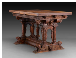
Title: Draw-Top Center Table Date: second half of the 16th century Primary Maker: French Medium: Walnut Dimensions: 34 3/4 × 59 1/2 × 34 in. (88.3 × 151.1 × 86.4 cm)