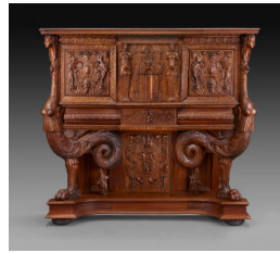
Title: Dressoir Date: ca. 1575, with 19th-century alterations, additions, and restorations Primary Maker: French, probably Lyon Medium: Walnut and beech Dimensions: 63 × 69 5/8 × 22 1/2 in. (160 × 176.8 × 57.2 cm)