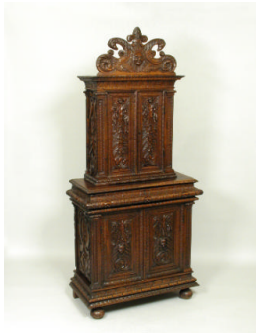
Title: Cabinet with Masks and Acanthus Relief Date: 16th and 19th century Primary Maker: French, Sixteenth Century Medium: Walnut and pine Dimensions: 73 3/8 × 39 5/8 × 19 in. (186.4 × 100.6 × 48.3 cm)